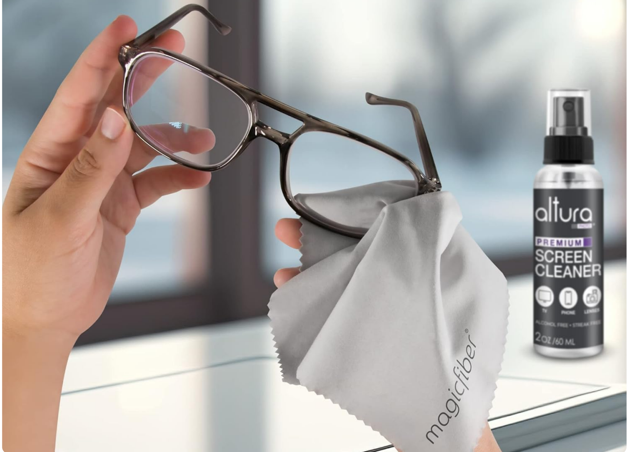
Image: Shows the product being used to clean eyeglasses, highlighting its versatility.