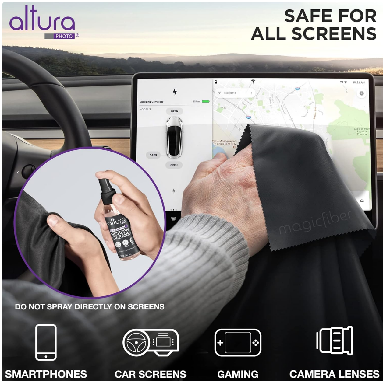
Image: Demonstrates cleaning a car screen, emphasizing the product's safety for various screens including smartphones, gaming devices, and camera lenses.