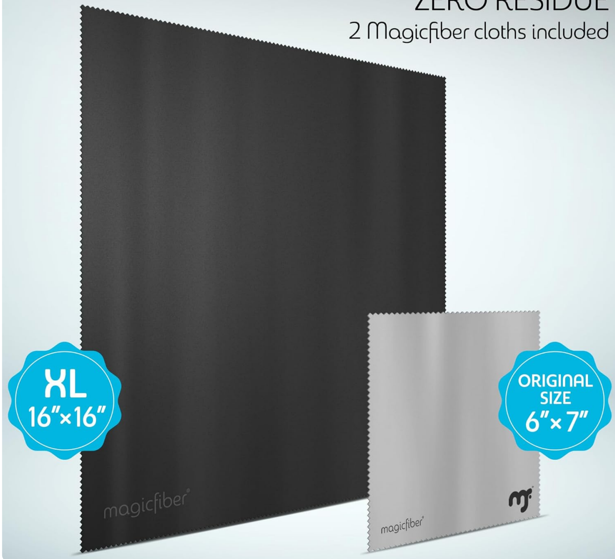
Image: Two MagicFiber cloths, highlighting their different sizes: an extra-large 16x16 inch black cloth and an original 6x7 inch grey cloth.