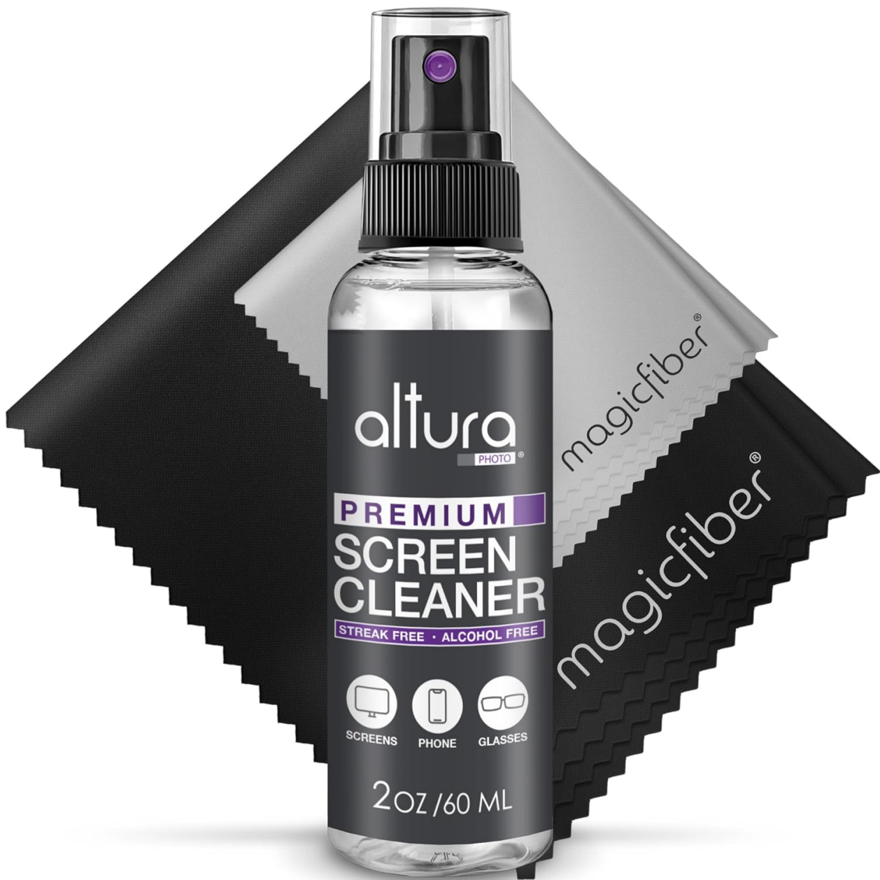
Image: The Altura Photo Screen Cleaner Spray bottle with two MagicFiber microfiber cleaning cloths, one black and one grey.