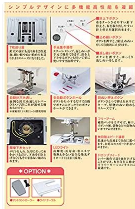
Image: Close-up views of the SINGER SN777's advanced features, including the needle up/down button, automatic buttonhole, 7-point feed dog, automatic needle threader, leveling presser foot button, horizontal bobbin case, LED light, free arm, stepless speed adjustment, and drop feed mechanism.