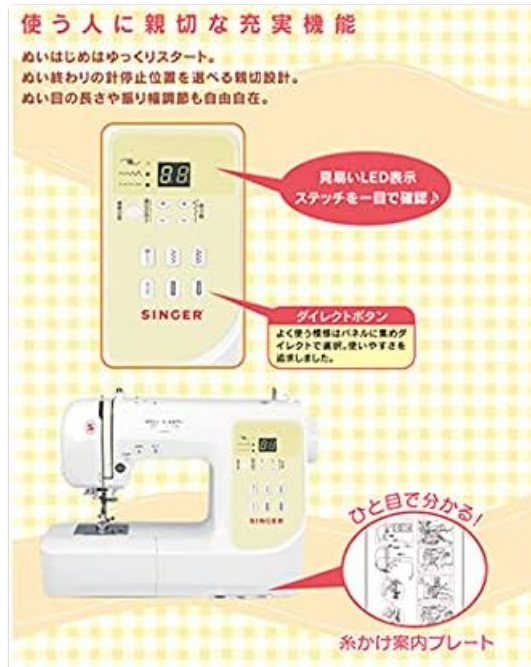
Image: Detailed view of the SINGER SN777 control panel with LED display and direct buttons, alongside a visual guide for threading.