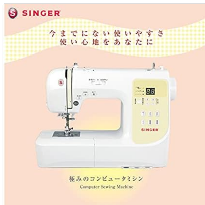
Image: The SINGER SN777, highlighting its ultimate computerized sewing machine capabilities and unprecedented ease of use.