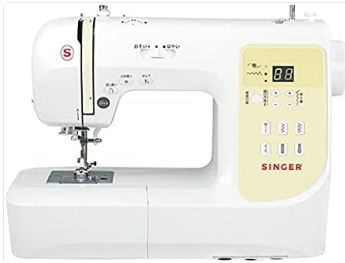
Image: Front view of the SINGER SN777 Computerized Sewing Machine, showcasing its compact design and control panel.