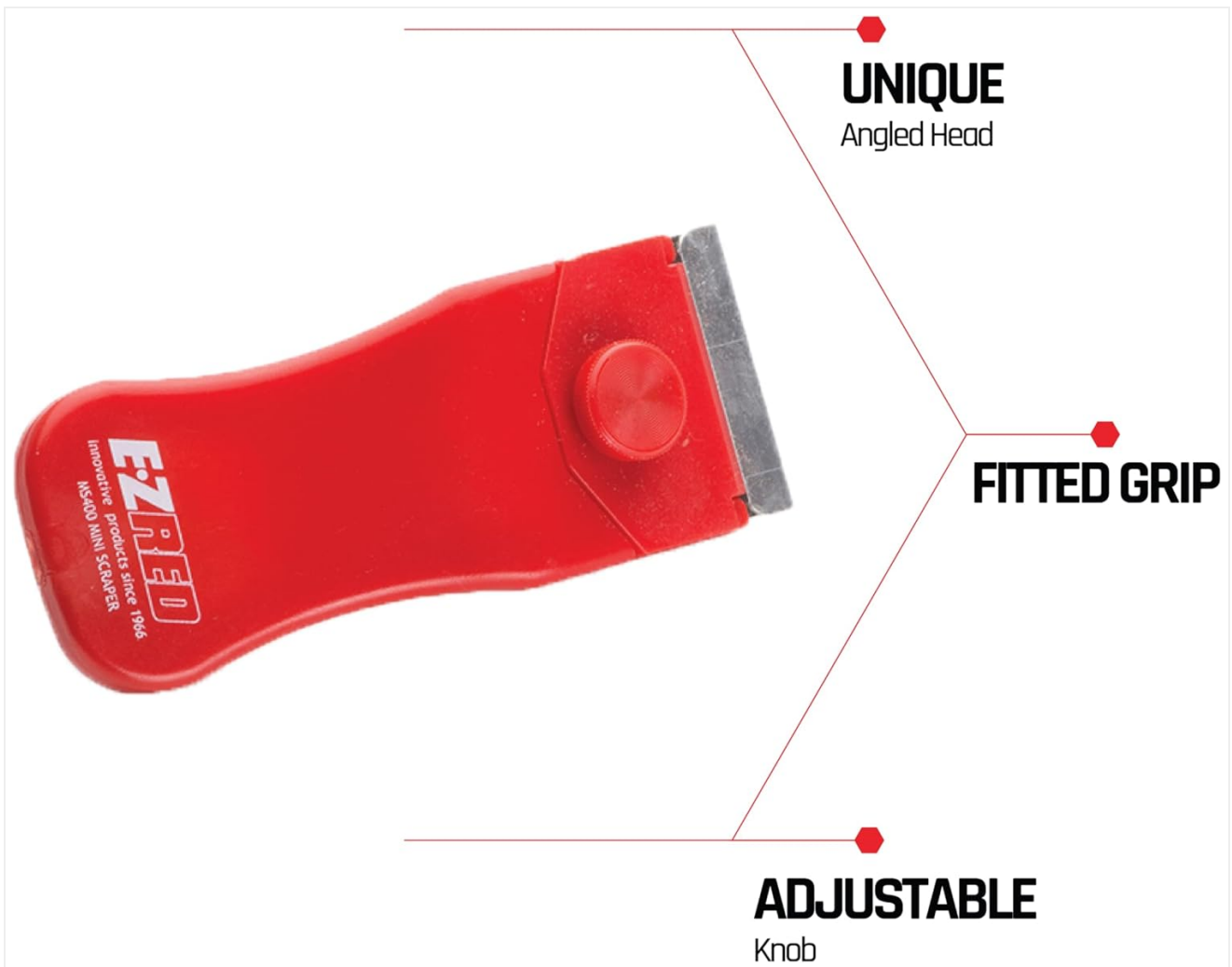
Figure 3: Detailed view of the MS400 Scraper, showing its unique angled head, fitted grip, and adjustable knob for blade security.