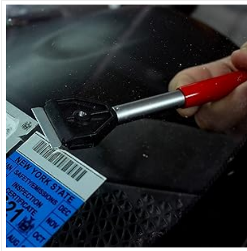
Figure 5: Close-up view illustrating the blade and the adjustable knob mechanism for blade replacement.