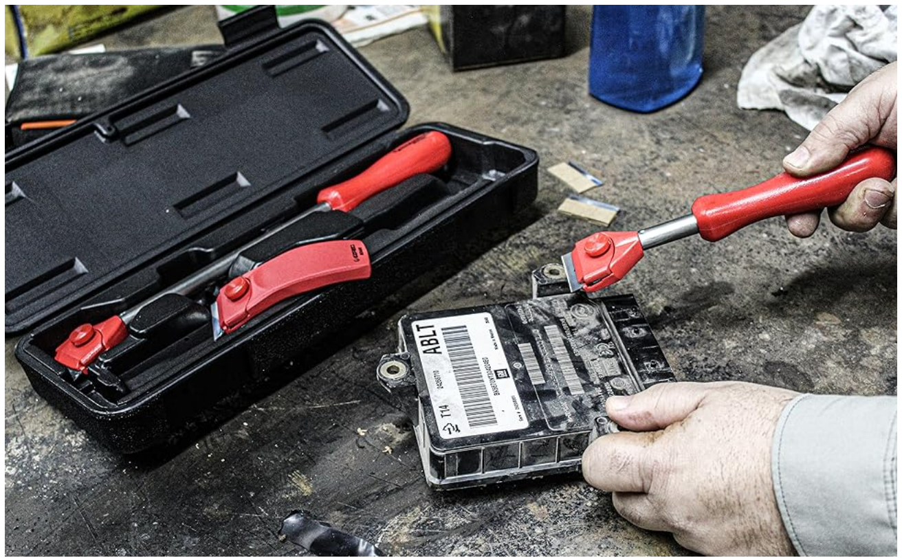
Figure 4: Example of the MS400 Scraper in use, demonstrating its application for removing adhesive materials.