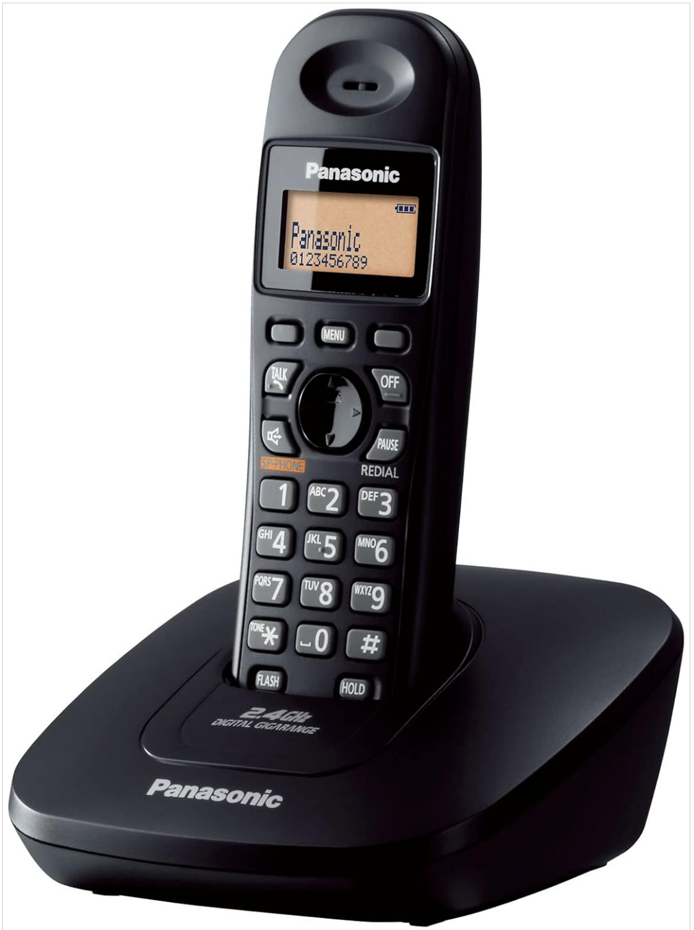
Image: The Panasonic KX-TG3611BX cordless telephone, showing the handset docked in its black base unit. The handset features a digital display and a standard telephone keypad.