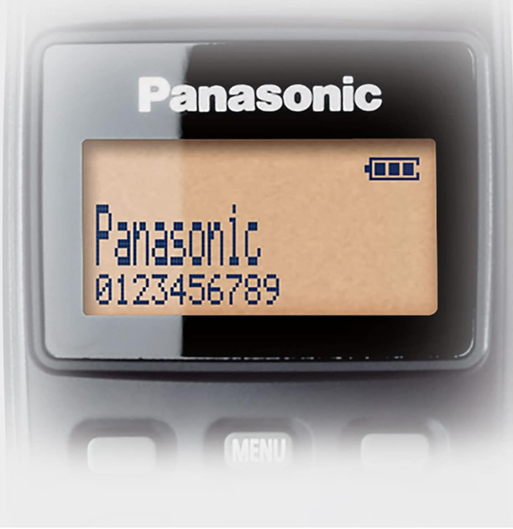
Image: A close-up view of the Panasonic handset's 1.3-inch amber backlit LCD screen, displaying 'Panasonic' and a phone number, illustrating its clear visibility.

شاشة LCD مقاس 1.3 بوصة بخلفية برتقالية على الوحدة المحمولة