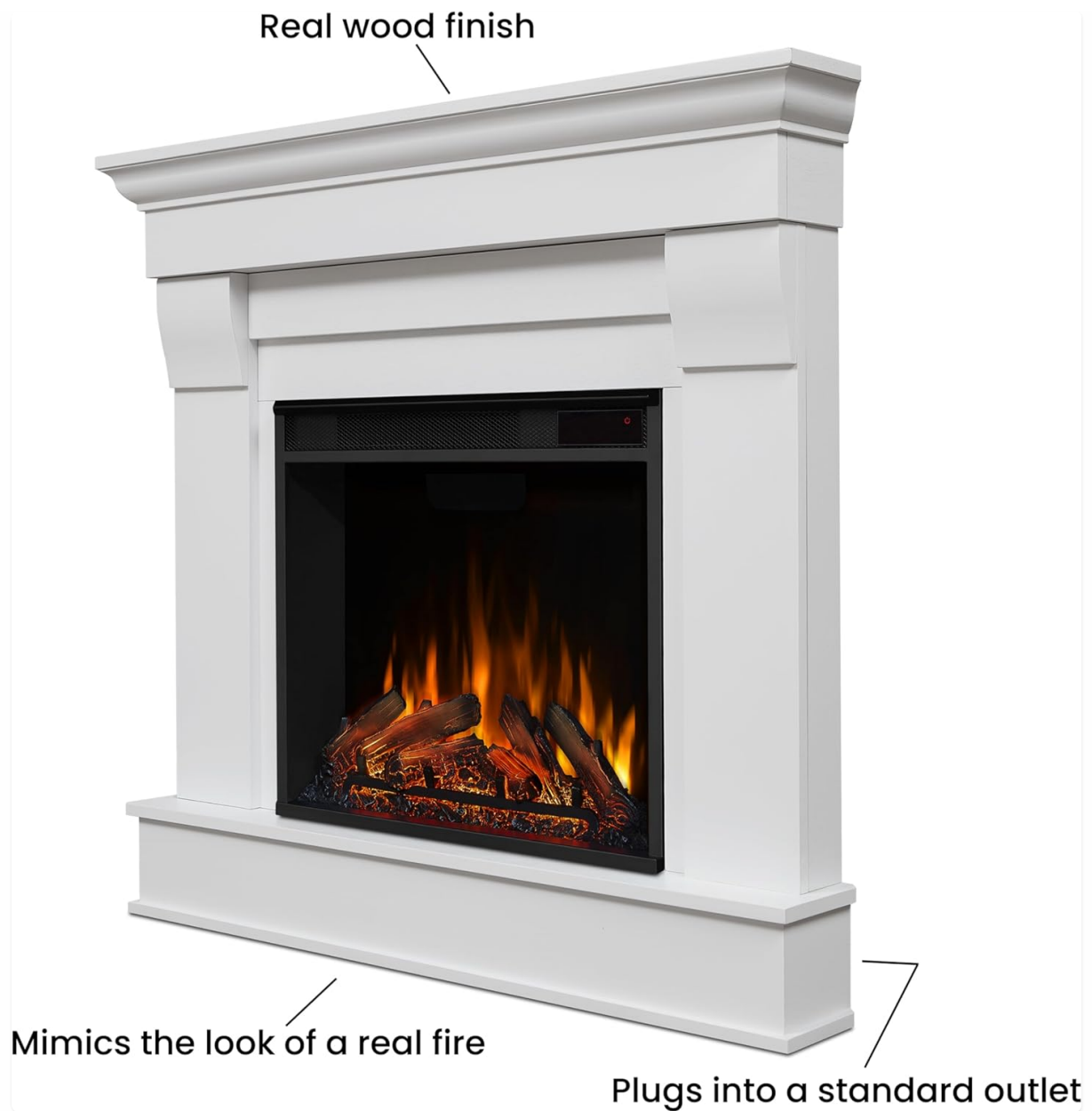
Image: A side view of the white Real Flame Chateau Electric Fireplace, emphasizing its real wood finish and the convenient standard outlet plug.