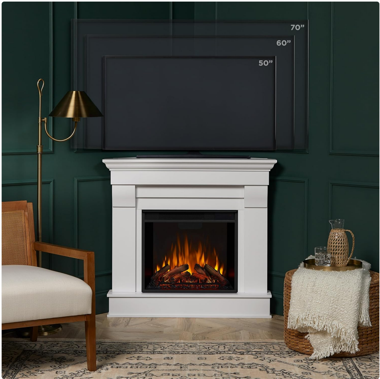
Image: The white Real Flame Chateau Electric Fireplace integrated into a living room corner, demonstrating its aesthetic appeal and functionality with a television mounted above.