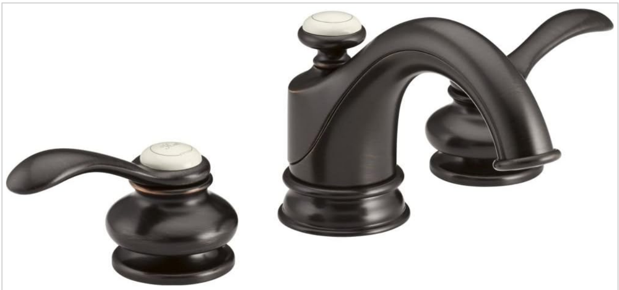
Figure 1: Overview of the Kohler K-12265-4-2BZ Fairfax Widespread Bathroom Sink Faucet in Oil-Rubbed Bronze.