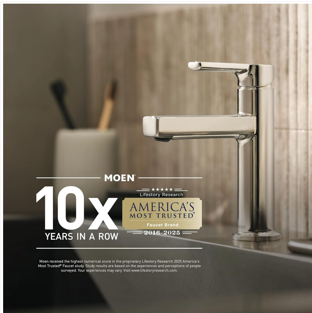
Figure 2: Detailed view of the Moen 52008 handle for installation reference.

Once the old handle is removed, follow the specific instructions provided with your faucet's valve assembly for installing the new Moen 52008 lever handle. Ensure all connections are secure and hand-tightened before turning the water supply back on.