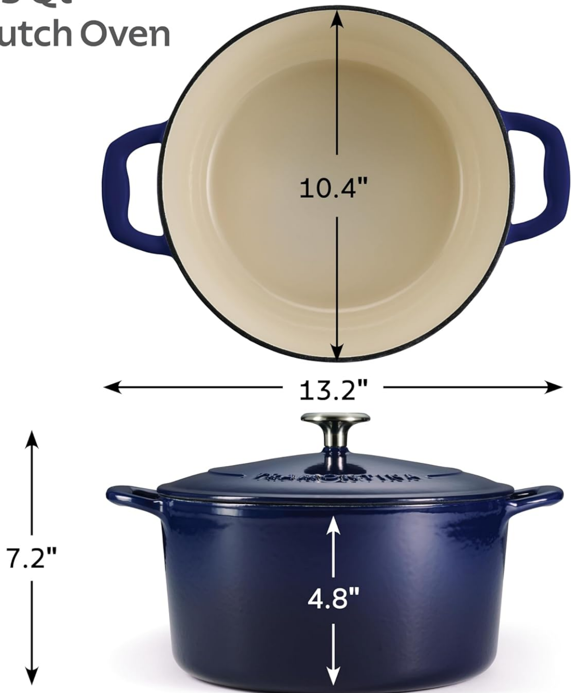
Image: A technical drawing illustrating the key dimensions of the 5.5-Quart Dutch Oven, including width, height, and interior diameter.