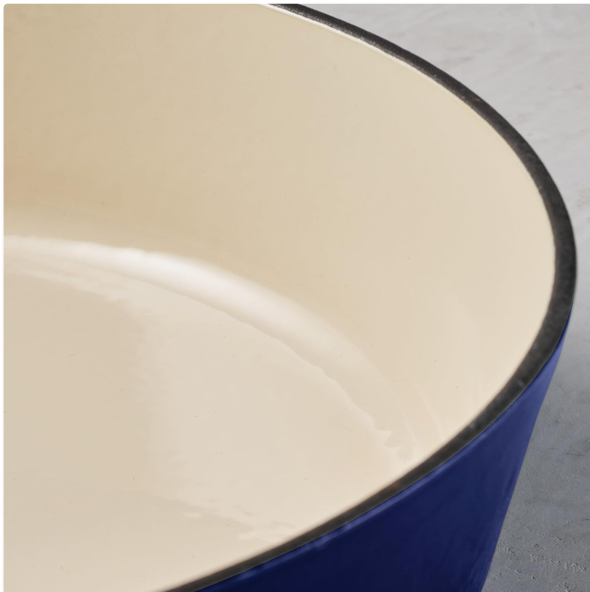
Image: A close-up view of the smooth, off-white porcelain enamel interior, highlighting its easy-to-clean surface.

a few minutes, then gently scrub and rinse.