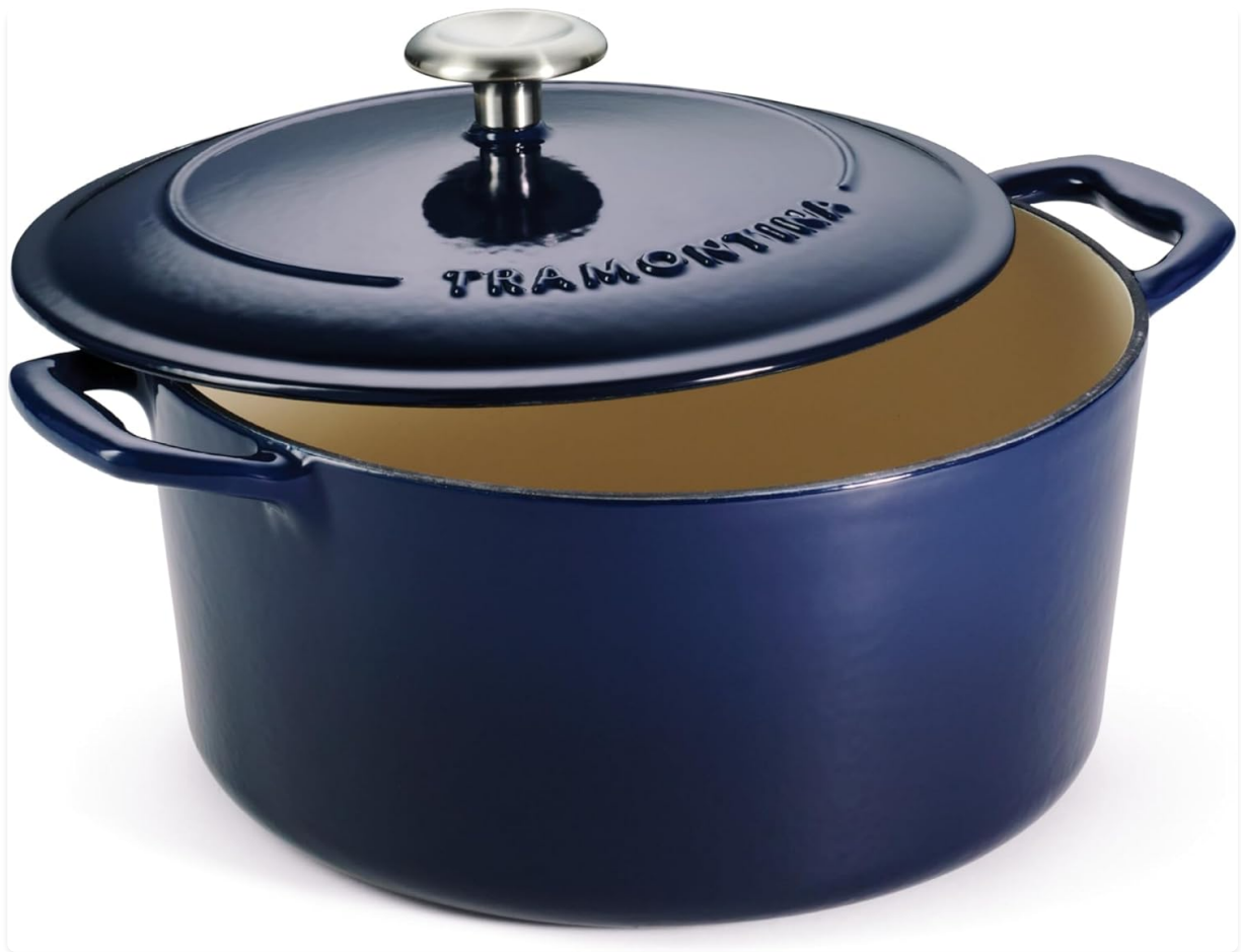
Image: The Tramontina Bestow 5.5-Quart Enameled Cast Iron Dutch Oven in blue, shown with its lid slightly open, revealing the light-colored enamel interior.