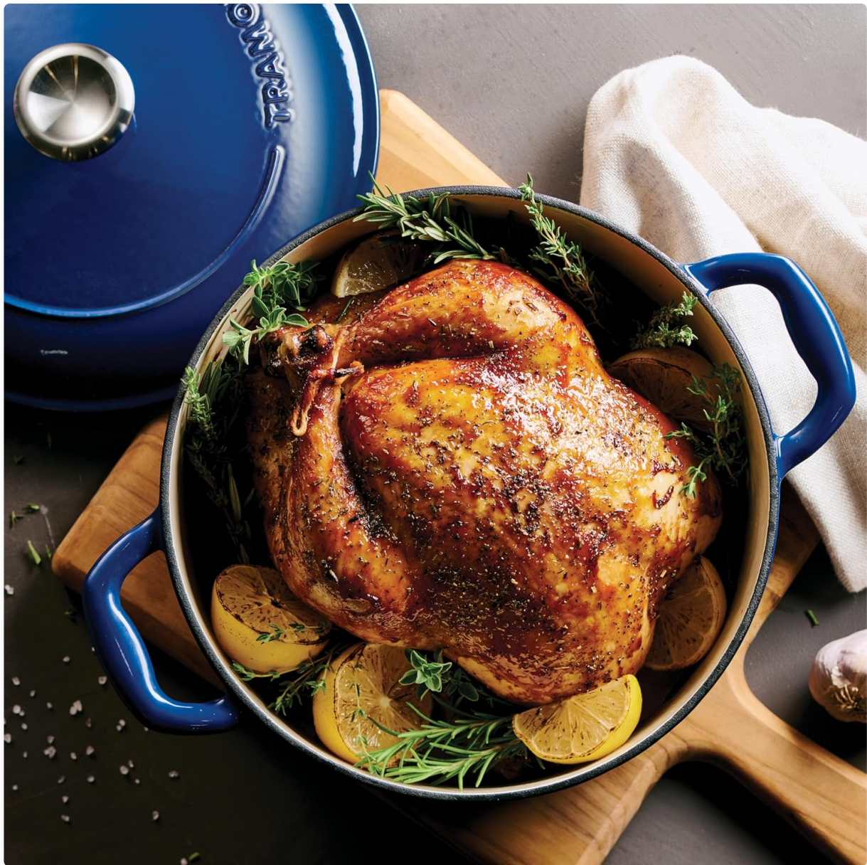
Image: A perfectly roasted chicken, garnished with lemons and herbs, prepared in the blue Tramontina Bestow Dutch Oven.