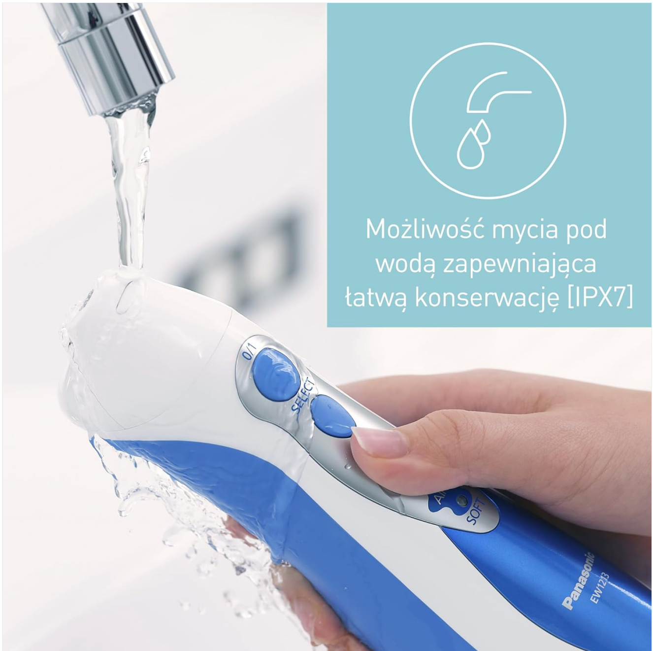
Image: A hand holding the Panasonic Dentacare EW1211W oral irrigator under a running tap, demonstrating its IPX7 waterproof rating and ease of cleaning.