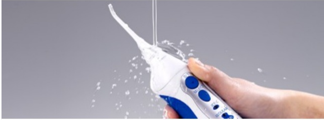
Image: A hand cleaning the detachable nozzle of the Panasonic Dentacare EW1211W oral irrigator, emphasizing the importance of regular hygiene.