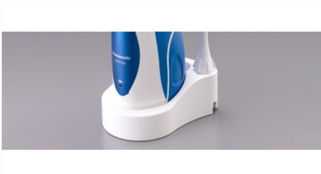
Image: The Panasonic Dentacare EW1211W oral irrigator securely placed on its compact charging base.