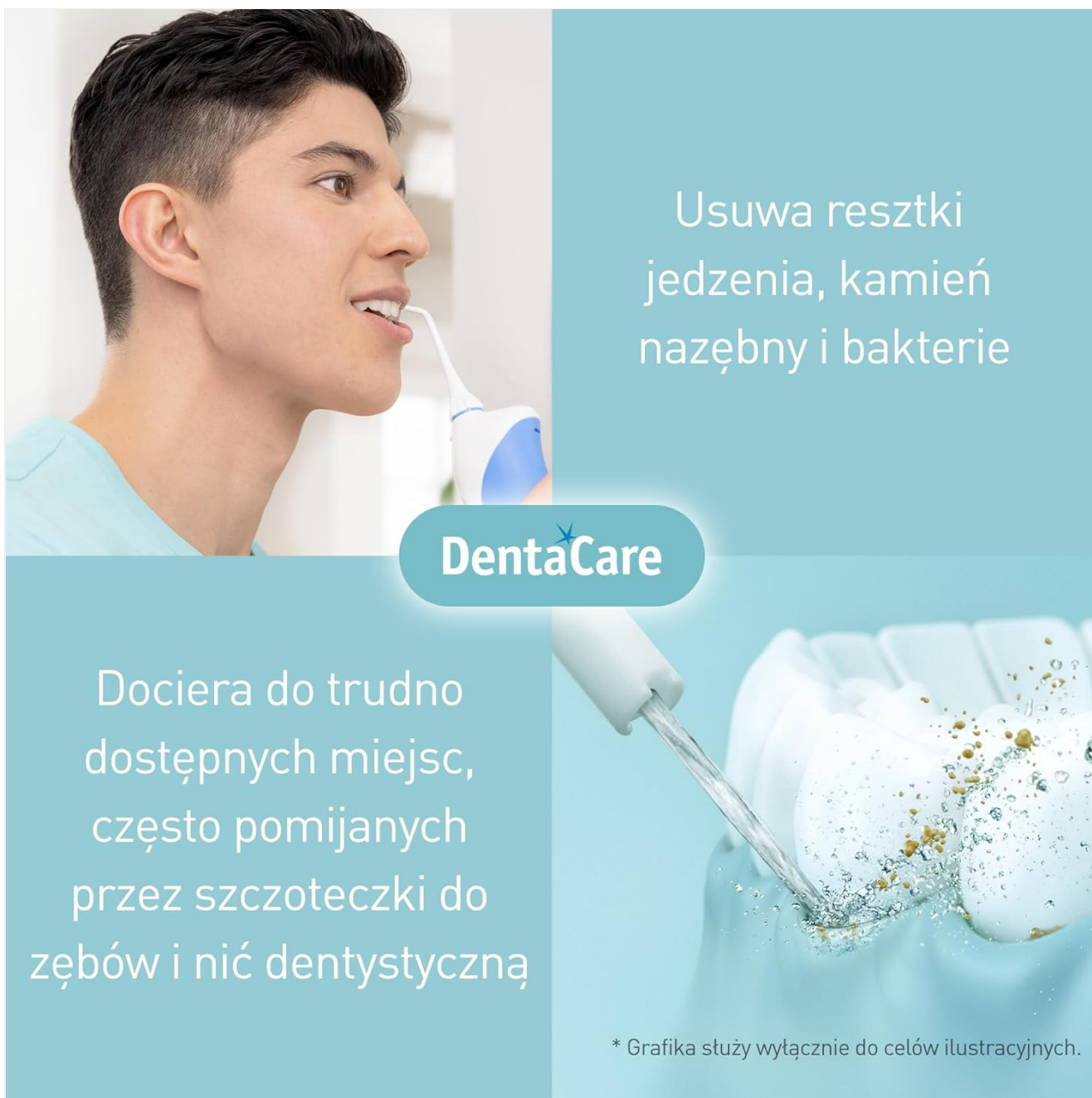
Image: A person demonstrating the use of the Panasonic Dentacare EW1211W oral irrigator, showing how the water jet effectively cleans between teeth and along the gumline.