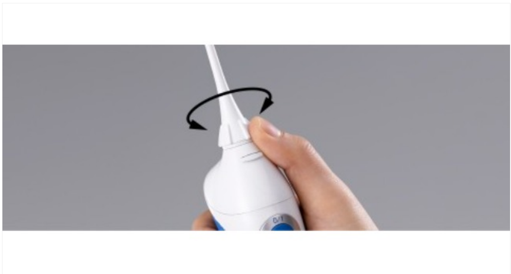
Image: A hand rotating the nozzle of the Panasonic Dentacare EW1211W oral irrigator, illustrating its adjustable design for reaching all areas of the mouth.