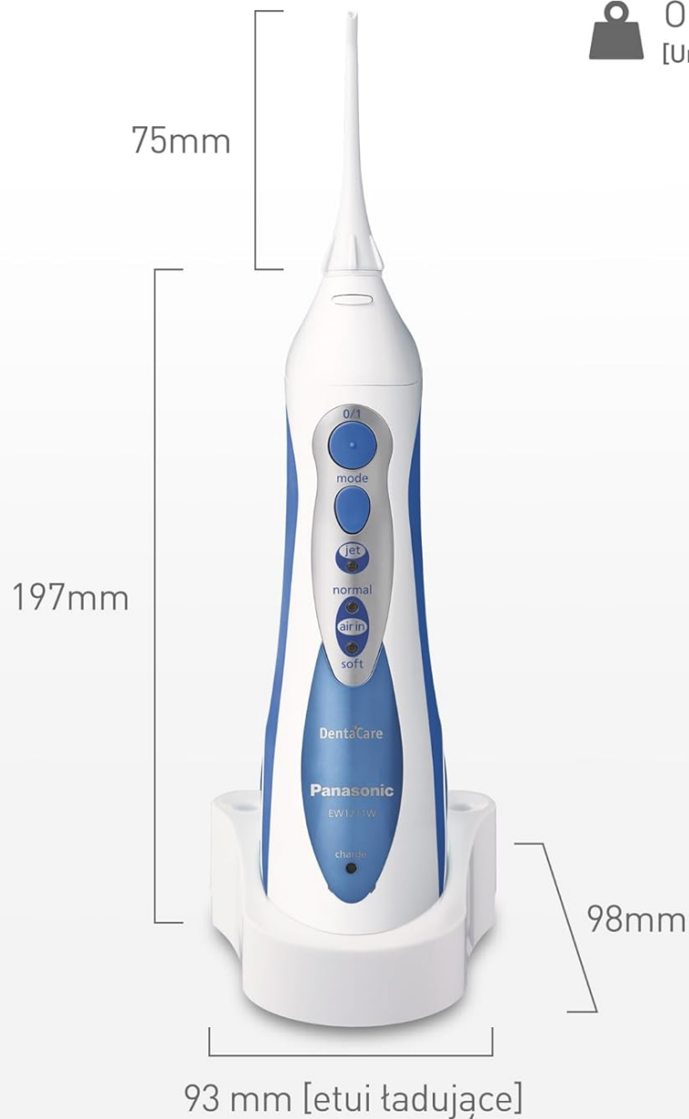
Image: Technical drawing showing the dimensions of the Panasonic Dentacare EW1211W oral irrigator and its charging base, including height, width, and weight.