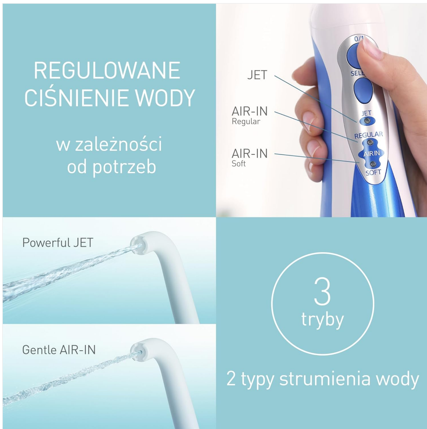
Image: A detailed view of the irrigator's control panel, highlighting the buttons for selecting Jet, Air-In Regular, and Air-In Soft modes, along with illustrations of the powerful jet and gentle air-in streams.

Image: Visual representations of the irrigator's effectiveness in cleaning interdental spaces, flushing gum pockets, cleaning around orthodontic appliances, and gently massaging the gums.