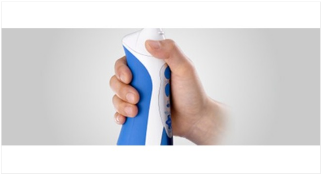
Image: A hand demonstrating the proper way to hold the Panasonic Dentacare EW1211W oral irrigator for comfortable and effective use.