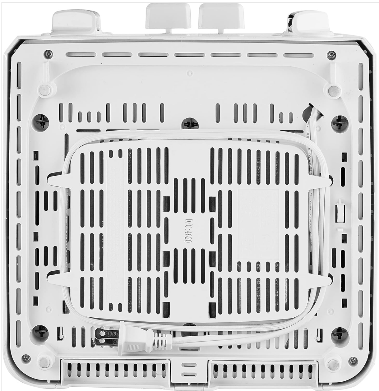
Figure 4: Underside of the toaster, illustrating the integrated cord wrap for tidy storage.