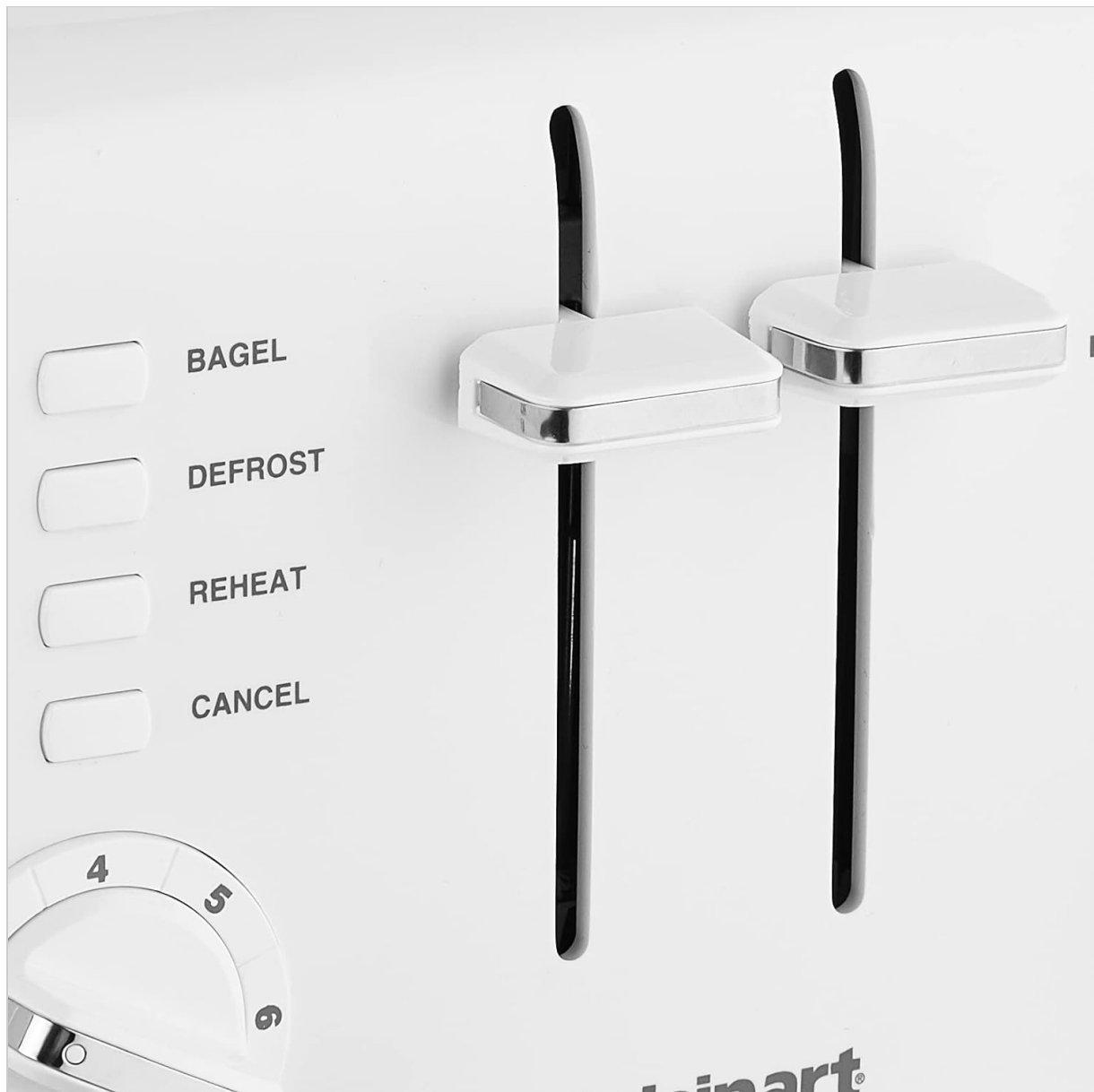
Figure 2: Detailed view of a control panel, illustrating the shade dial and function buttons for precise toasting control.