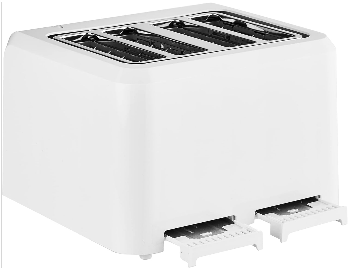
Figure 3: Rear view of the toaster, showing the location of the two removable crumb trays for easy cleaning.