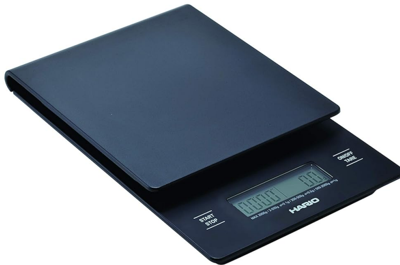
Figure 1: Top-down view of the HARIO V60 Drip Coffee Scale and Timer. The display shows weight and time, with touch-sensitive buttons for operation.