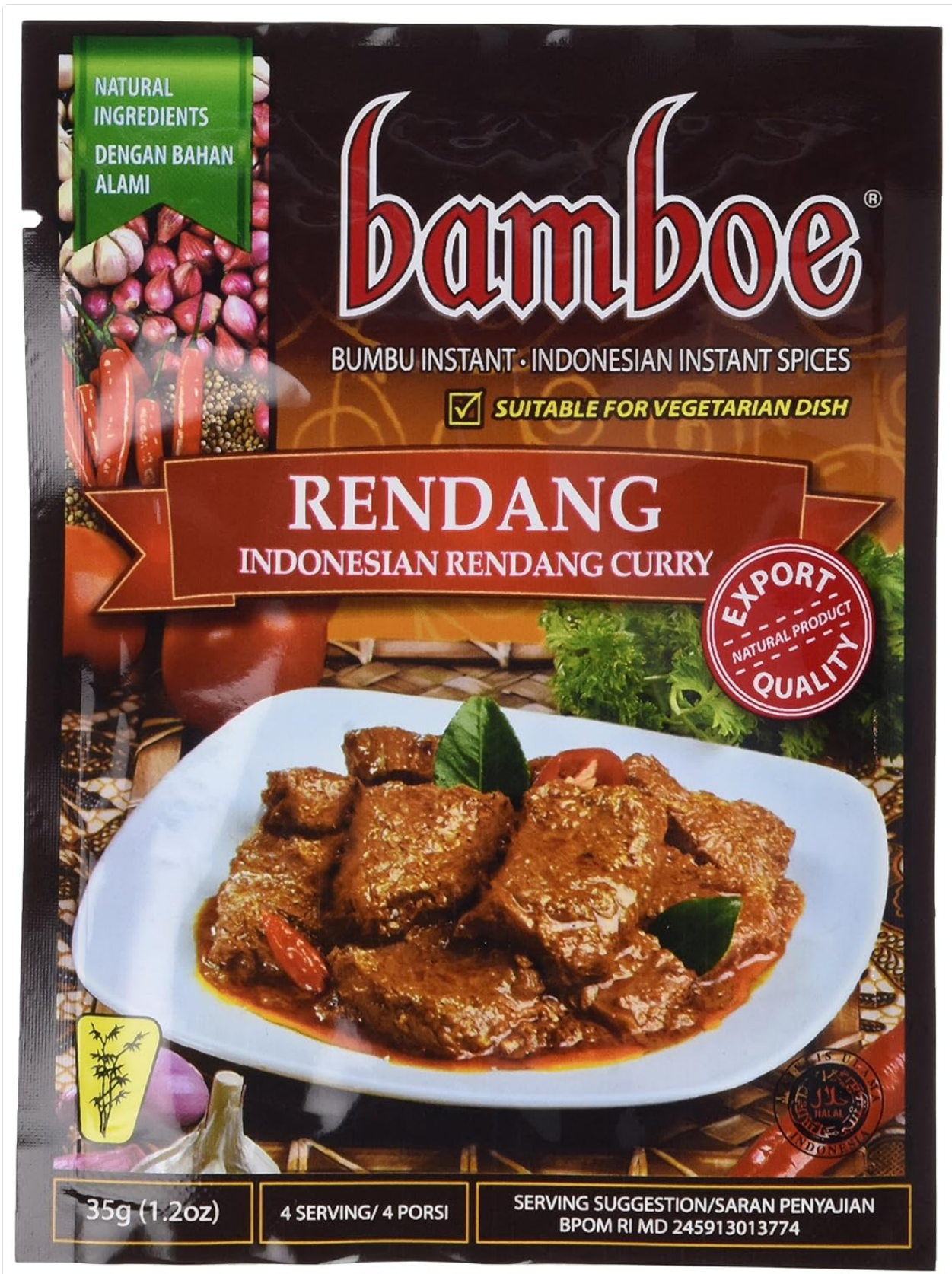
Image 1.1: Front packaging of Bamboe Rendang Indonesian Dry Curry Paste. The image displays the brand logo, product name, and a serving suggestion of cooked rendang meat.