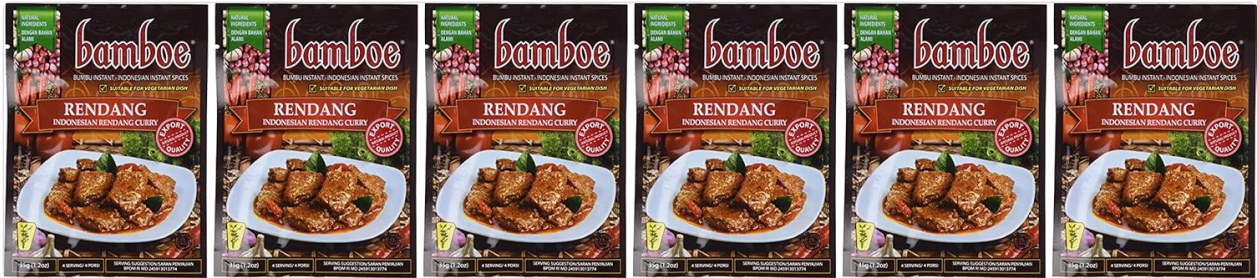
Image 2.1: A multi-pack of six Bamboe Rendang Indonesian Dry Curry Paste sachets, illustrating the convenient packaging.