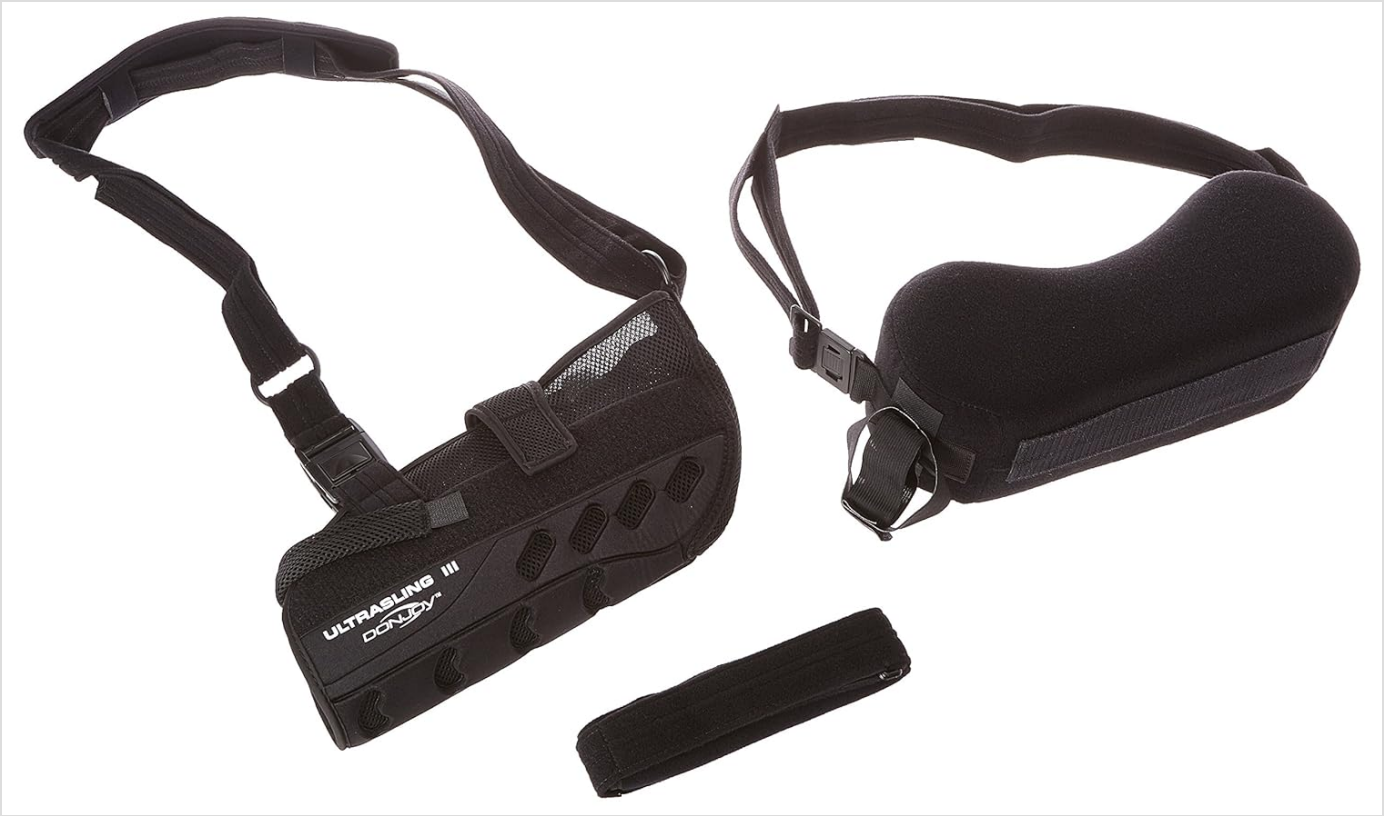
Image 1: Components of the DonJoy Ultrasling III Arm Sling, including the main sling, the abduction pillow, and a small exercise ball.

To ensure proper fit and effectiveness, select the correct size of the Ultrasling III. Measure from the elbow crease to the base of the index finger. The sling is designed to fit both left and right arms.