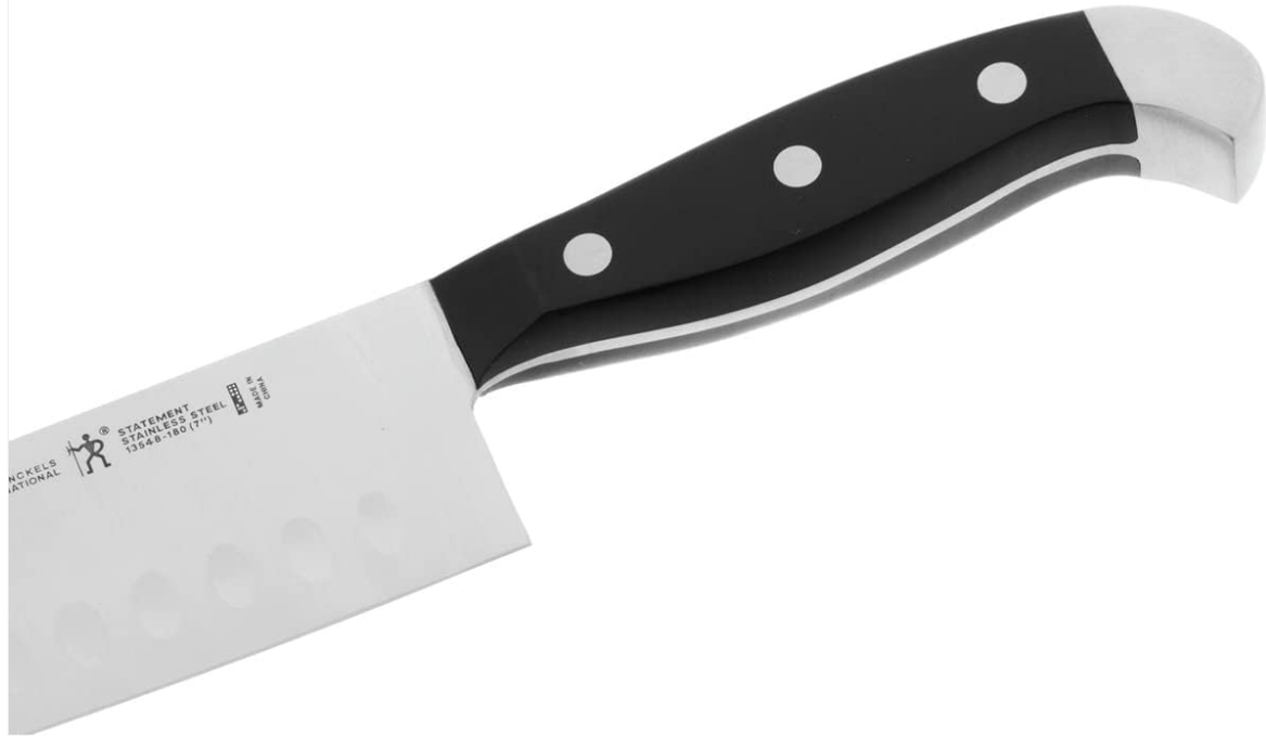
Image: The 7-inch Hollow Edge Santoku Knife, designed to prevent food from sticking.