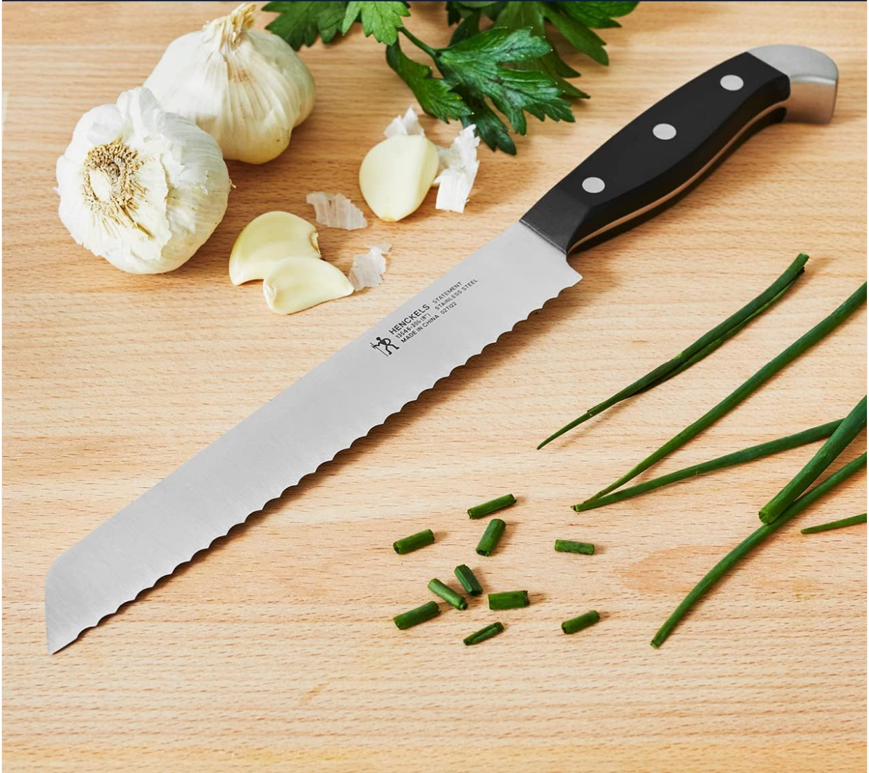
Image: The 8-inch Bread Knife with its serrated edge, ideal for slicing bread.