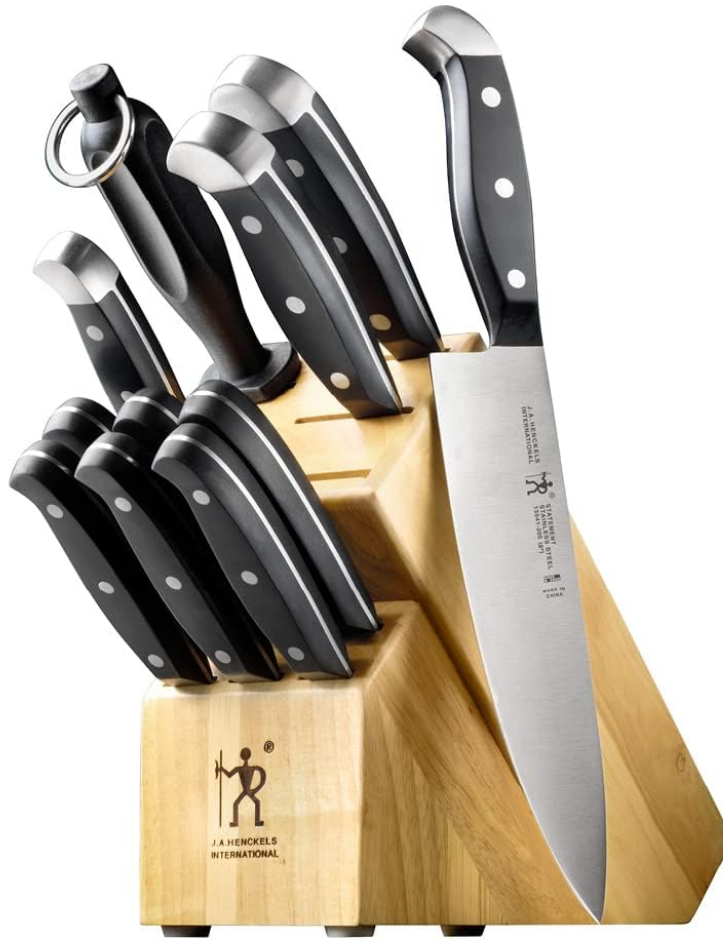
Image: A close-up view of the HENCKELS knife set securely placed in its wooden block.

This 12-piece knife block set is stocked with all the tools you need to easily tackle all your kitchen tasks