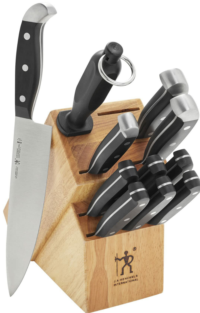
Image: The complete HENCKELS Statement 12-Piece Knife Set housed in its natural wood block.