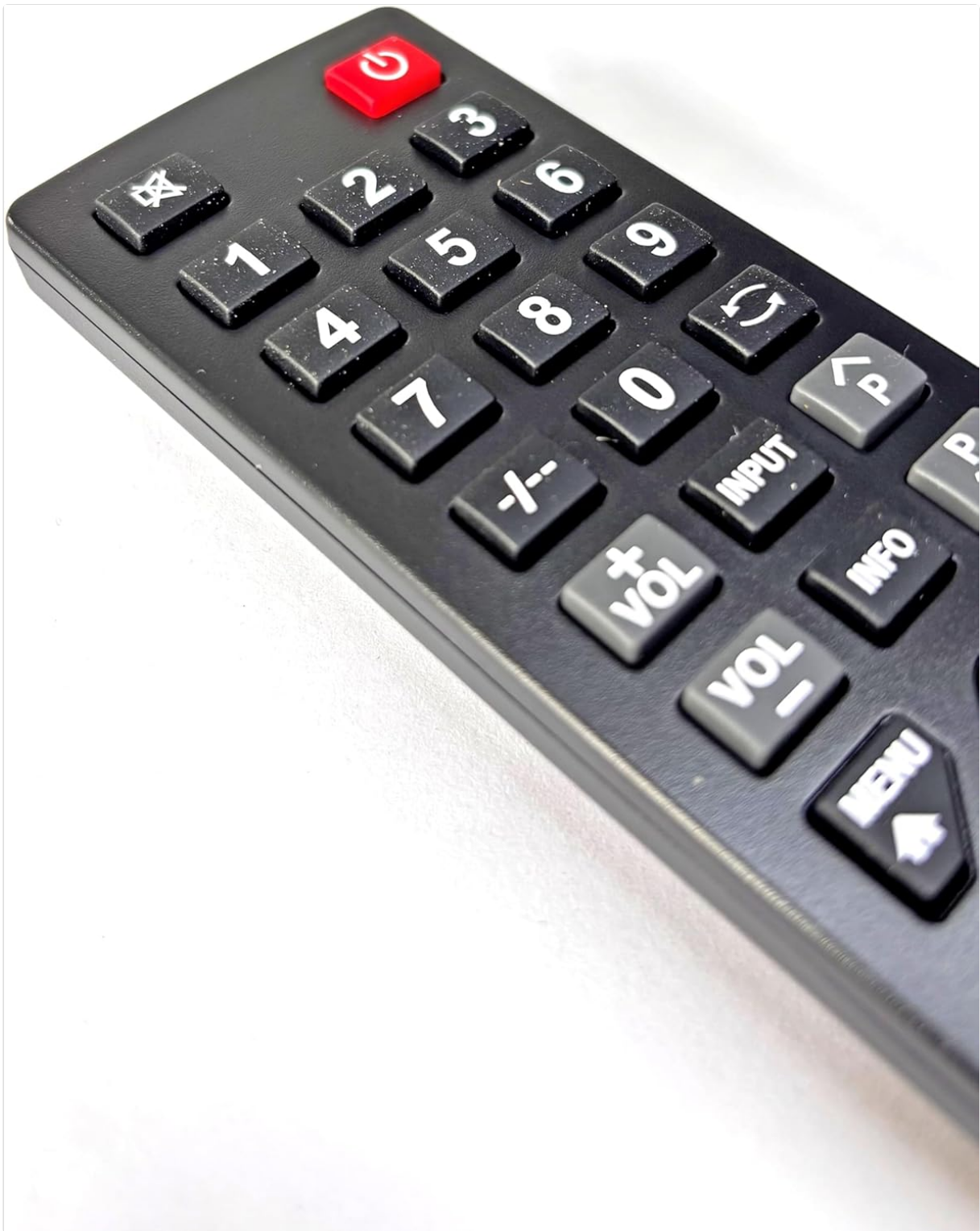
Image: Close-up of the upper part of the Classic remote control, highlighting the power button, number pad, and volume controls.