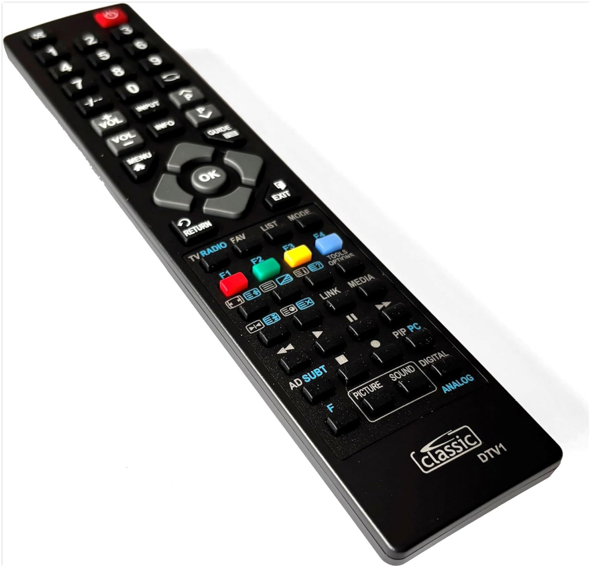
Image: Angled view of the Classic remote control, displaying a wider range of function buttons for various television operations.

Note on Button Layout: As this is a replacement remote, the position of some buttons may differ from your original remote. Some keys might have dual functions if the original remote had fewer buttons. Refer to your television's user manual for specific function details if needed.