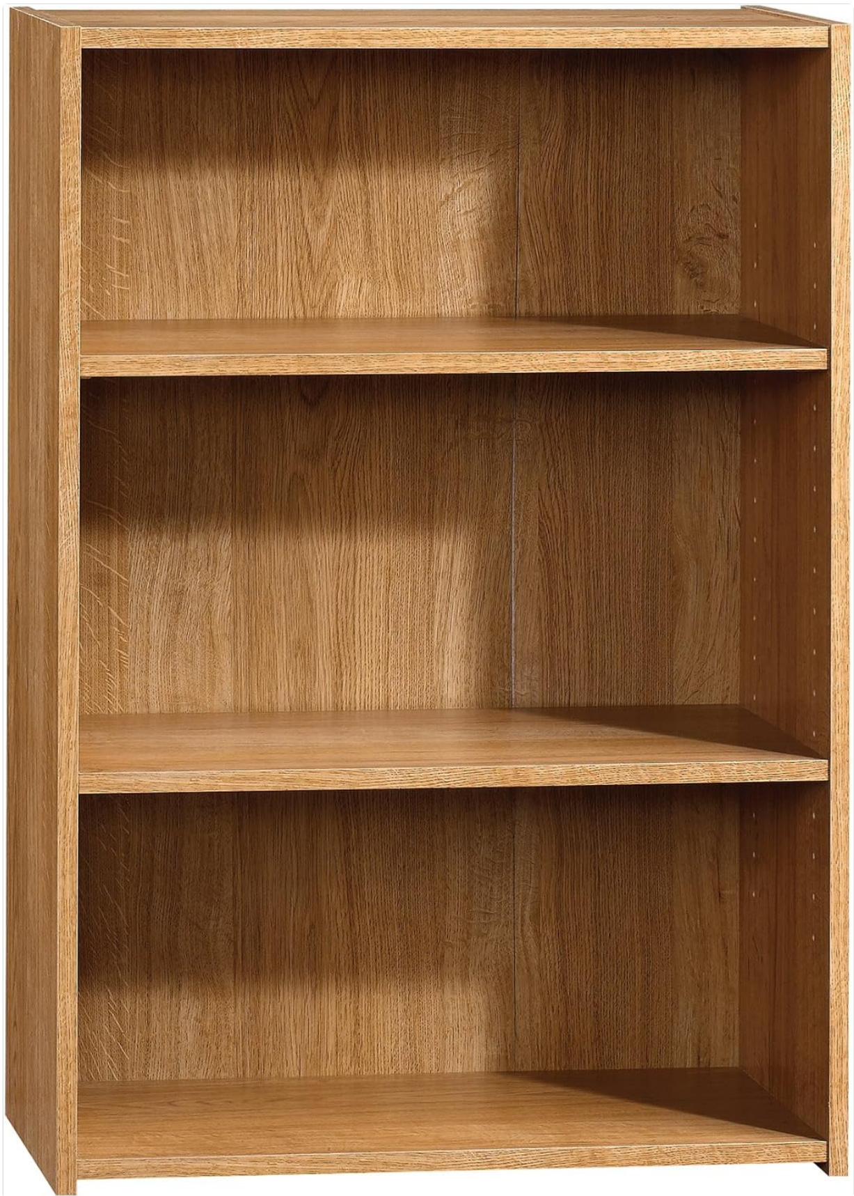
Figure 1: Assembled Sauder Beginnings 3-Shelf Bookcase in Highland Oak finish.