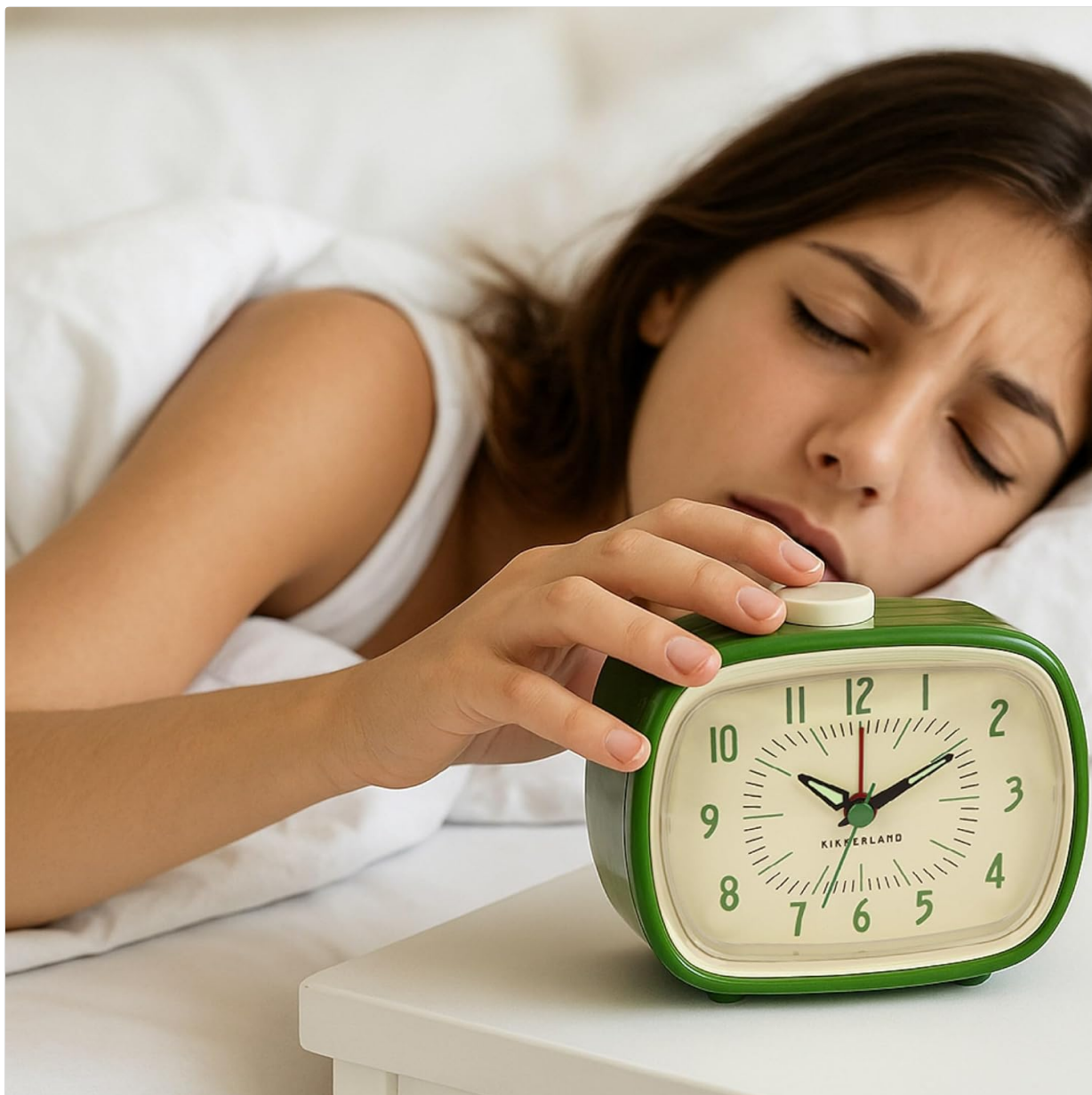
Image: A hand pressing the top button of the green alarm clock, demonstrating how to activate or deactivate the alarm.