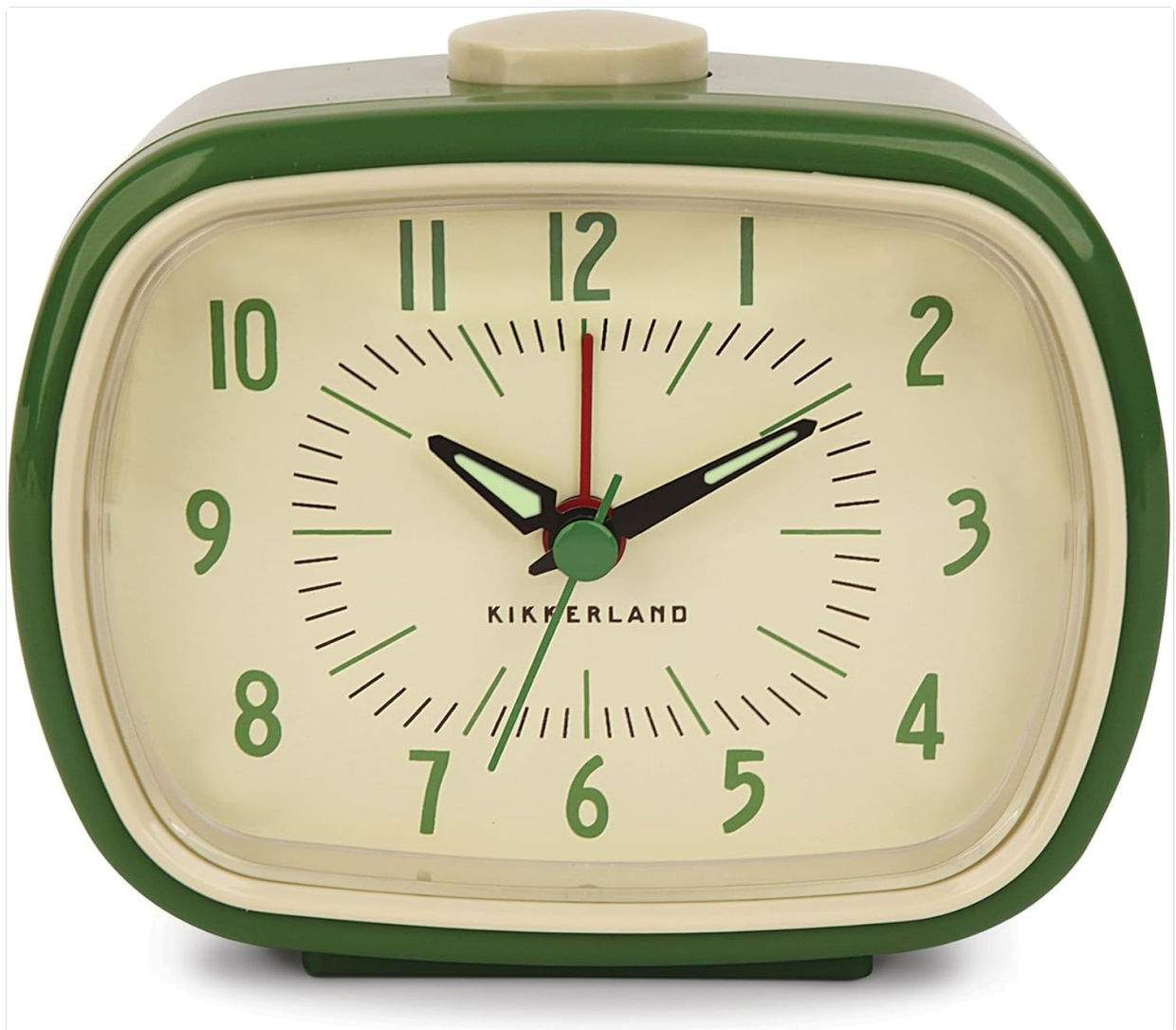
Image: Front view of the green Kikkerland Retro Alarm Clock, displaying the analog clock face with numbers and hands.