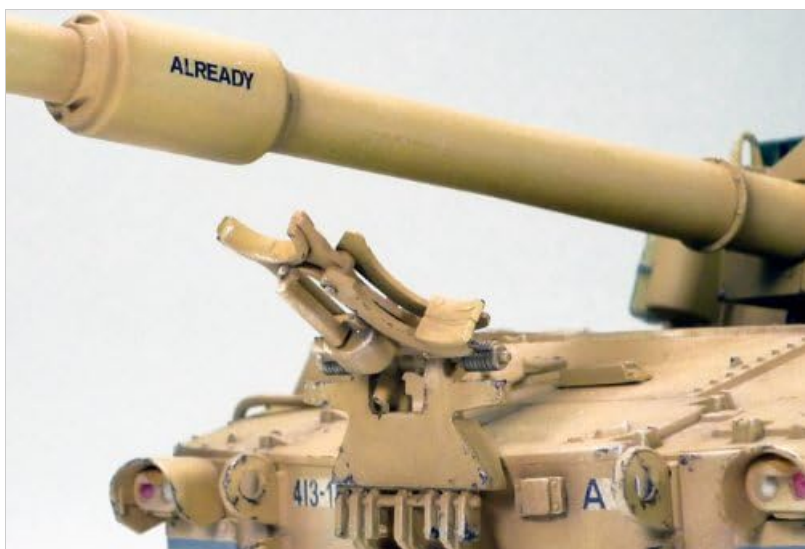
Image: A direct front view of the main gun barrel, showing markings or text applied to it.