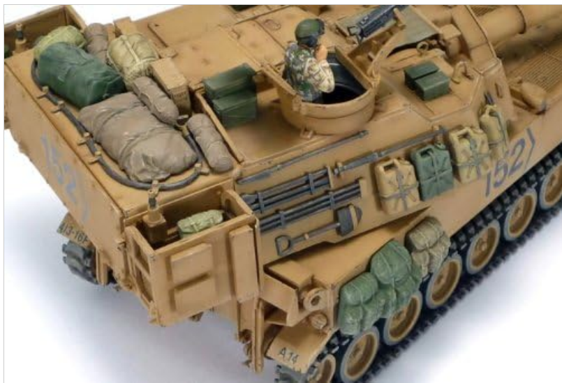
Image: An aerial view of the rear of the model, displaying additional equipment and stowage attached to the hull.