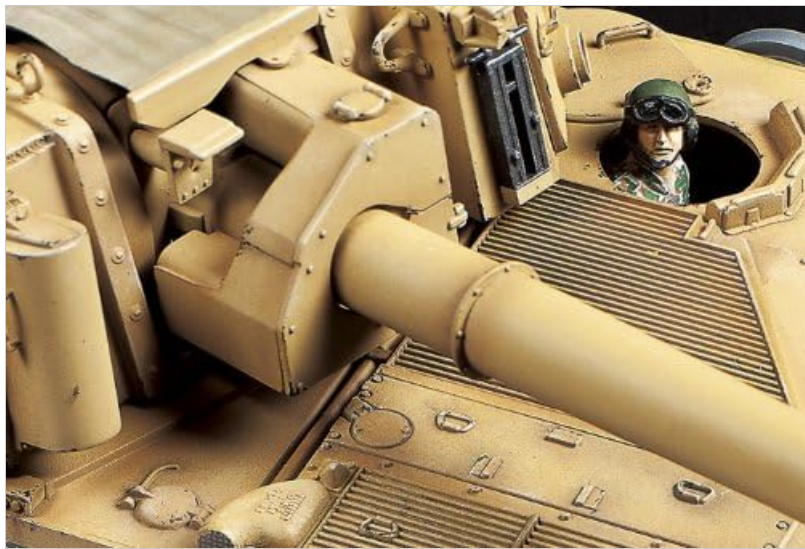
Image: A close-up shot of the main gun barrel and the front section of the turret, highlighting texture and detail.