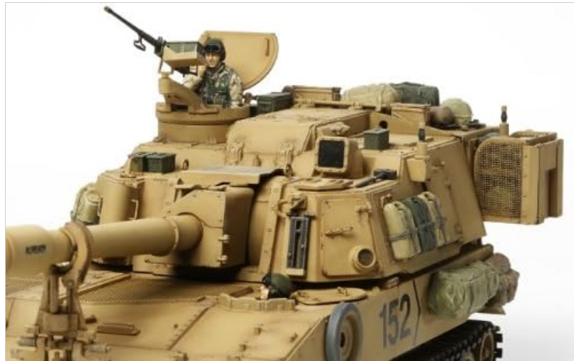
Image: An assembled Tamiya M109A6 Paladin model, showcasing the overall structure and details from a front-right angle.