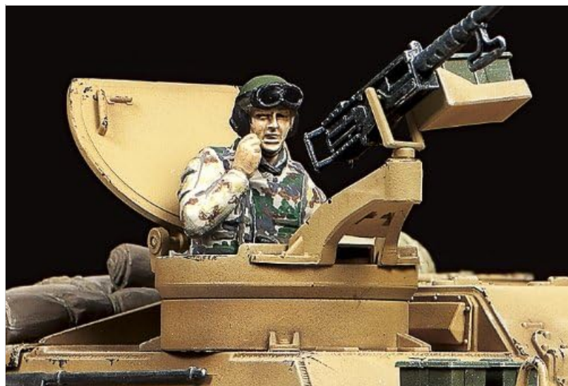
Image: A detailed view of the commander's hatch area, including a crew figure in the open hatch.