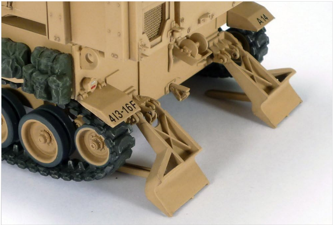
Image: The rear section of the model, focusing on the spades used for stabilizing the artillery piece during firing.