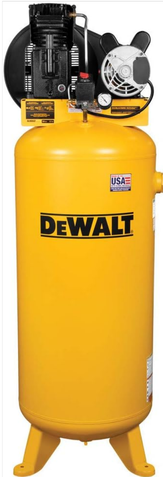
Figure 3.1: Full view of the DeWalt DXCMLA3706056 60-Gallon Stationary Air Compressor. This image shows the overall design, including