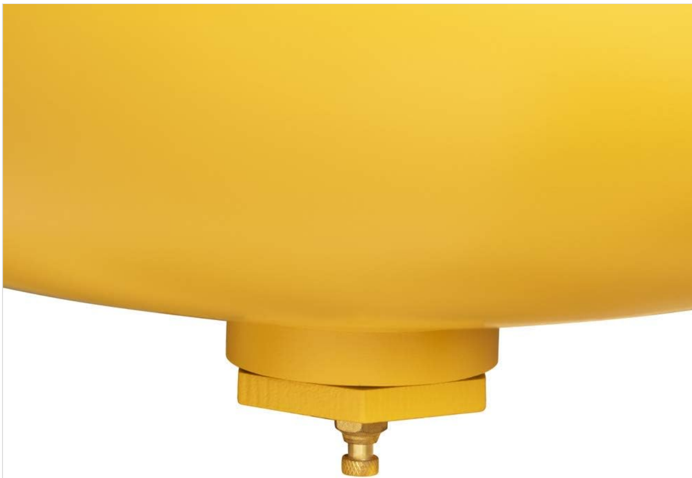
Figure 5.2: Close-up of the tank drain valve located at the bottom of the air tank. This valve is used to release condensed moisture from the tank.