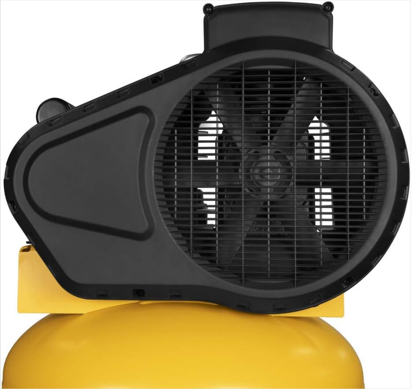
Figure 5.1: View of the motor's cooling fan. Proper airflow around this component is essential for preventing overheating during operation.