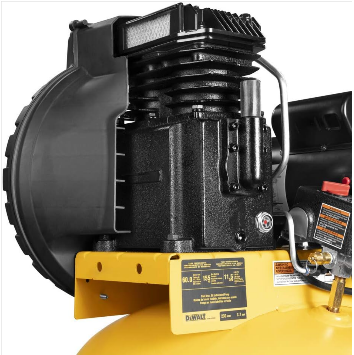
Figure 3.2: Close-up view of the compressor's pump assembly. This image highlights the cast iron pump, motor, and the protective shroud, along with a label indicating performance specifications.

the yellow tank, black pump assembly, and motor.