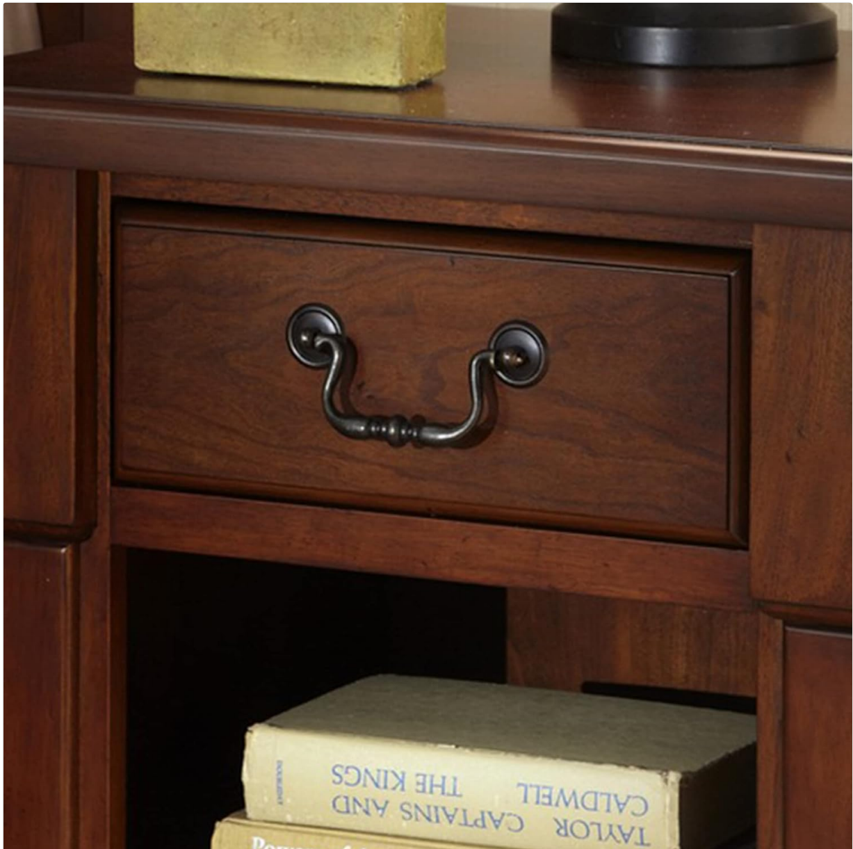
Figure 5.1: A close-up view of the nightstand's single drawer, featuring an antique brass pull handle.

The Homestyles Aspen Nightstand is designed for convenient storage and display next to your bed or other furniture.