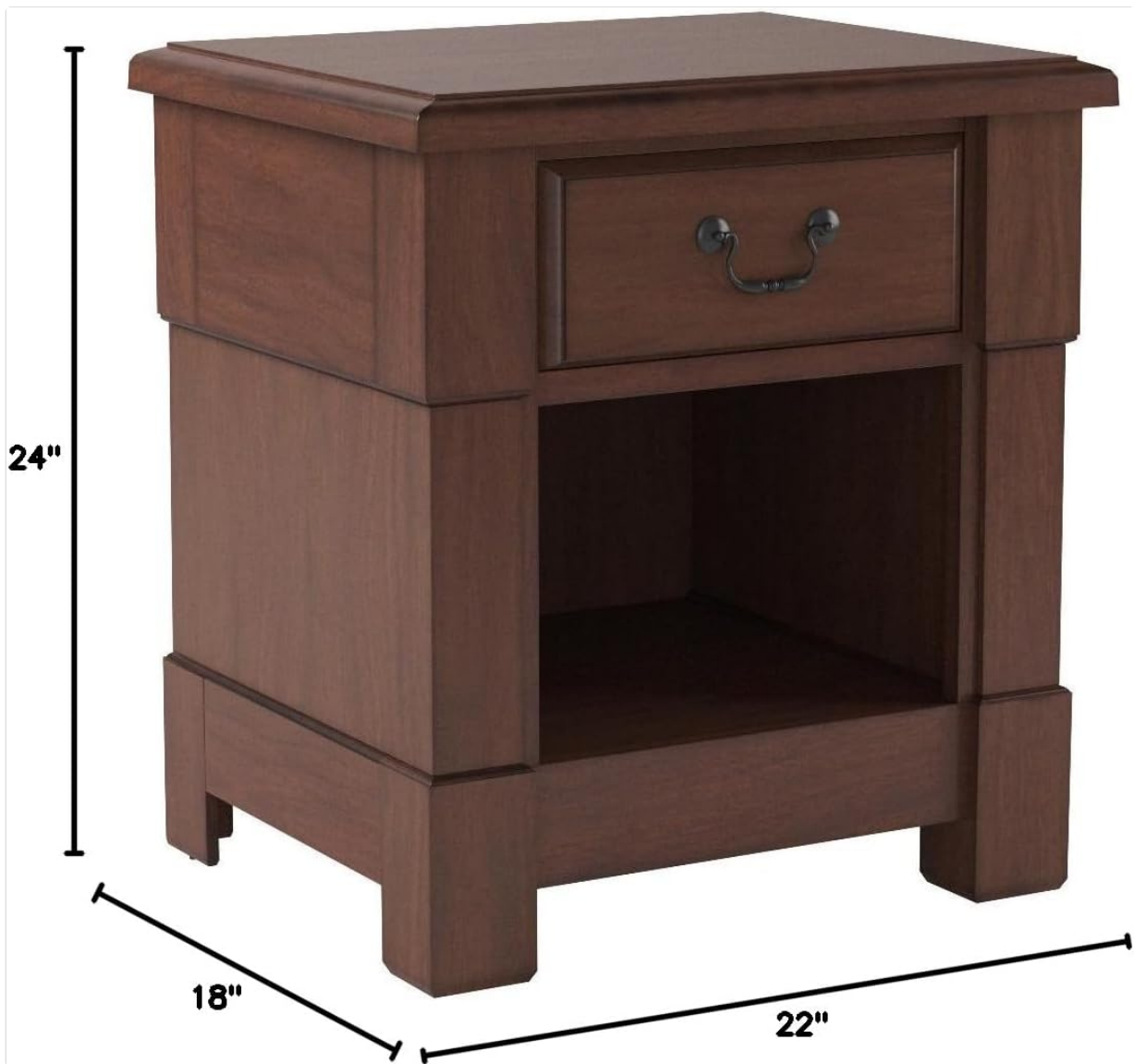
Figure 4.2: Diagram illustrating the dimensions of the Aspen Nightstand: 22 inches wide, 18 inches deep, and 24 inches high.