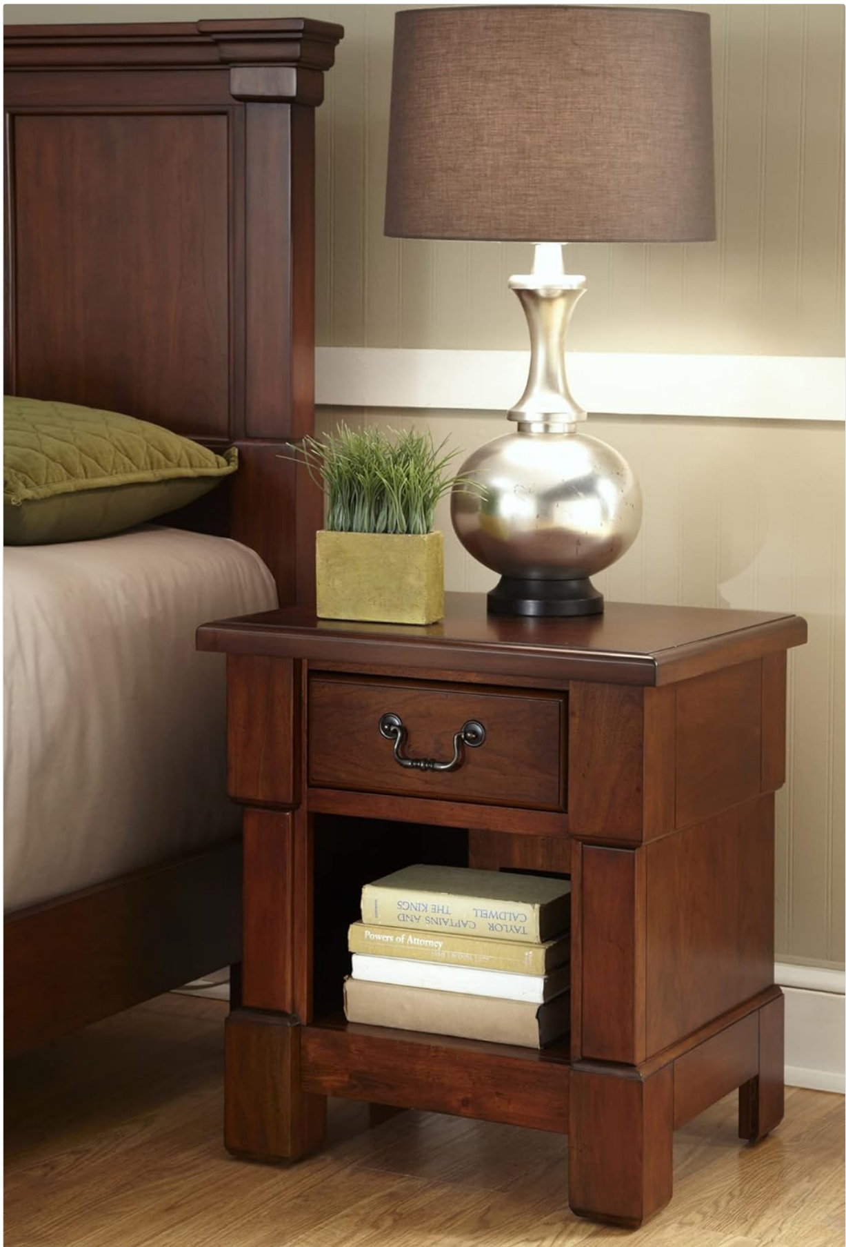
Figure 4.1: Assembled Homestyles Aspen Nightstand in a bedroom environment, showcasing its cherry finish and classic design.