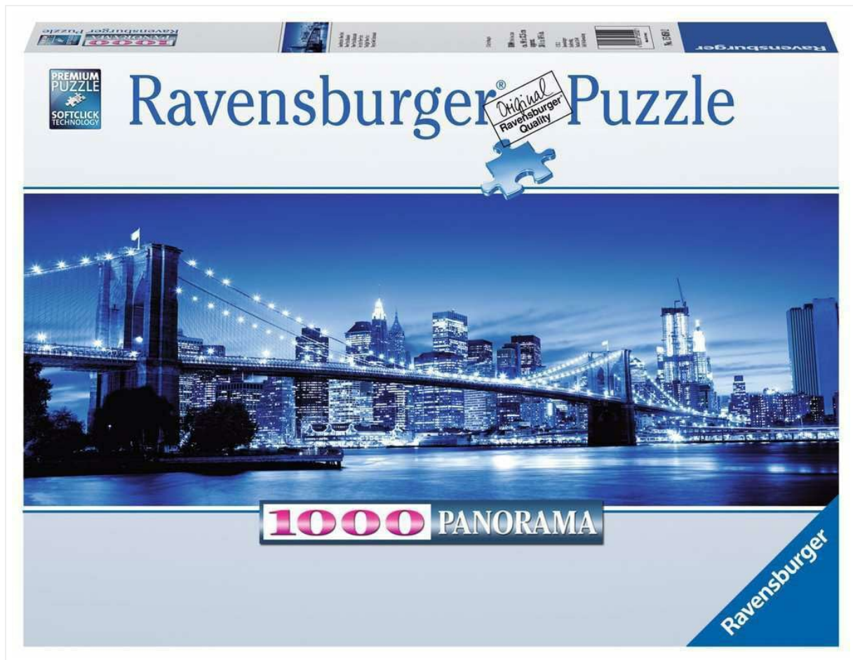
Image: The Ravensburger 1000 Piece Panoramic New York Twilight Puzzle box, showcasing the vibrant image of the New York skyline at twilight with the Brooklyn Bridge.