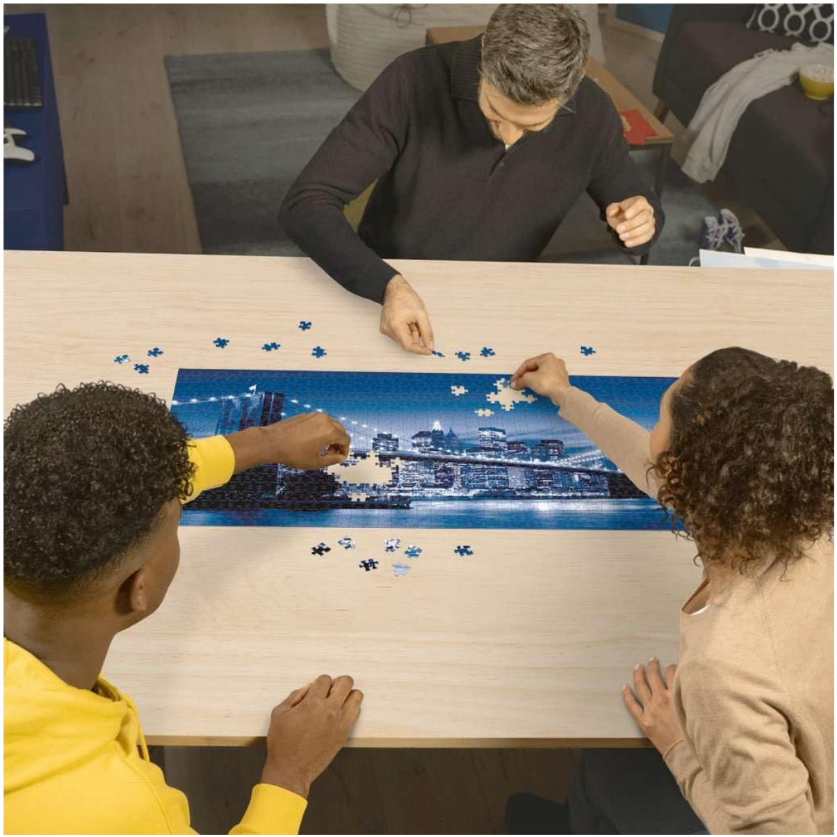
Image: Three individuals are shown actively assembling the Ravensburger New York Twilight puzzle on a large wooden table, demonstrating the collaborative and engaging nature of the activity.