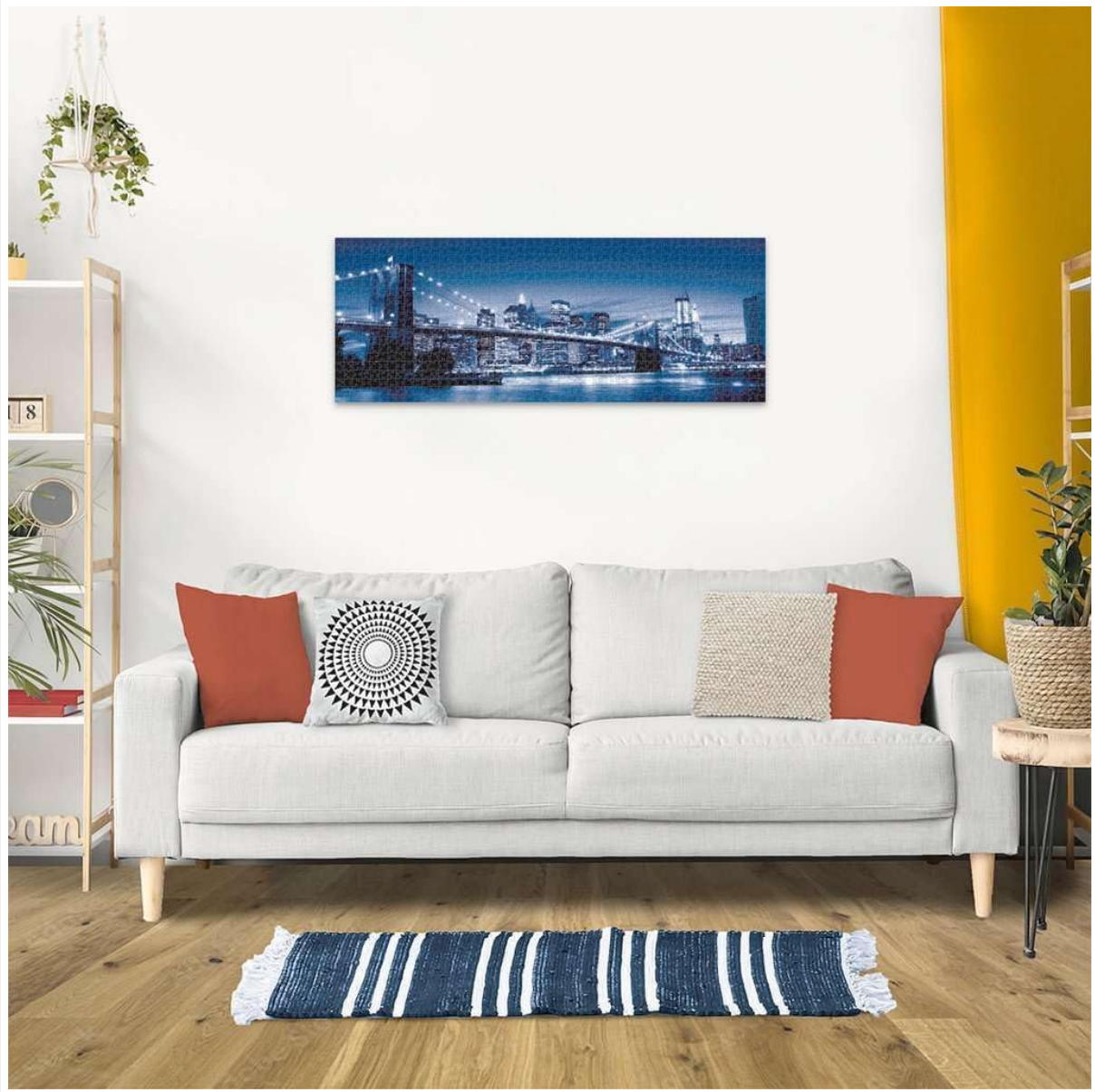
Image: A completed Ravensburger panoramic puzzle, featuring the New York Twilight scene, is elegantly displayed on a white wall above a sofa in a modern living room setting.