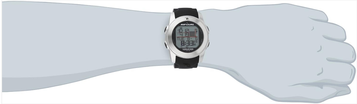
Image: The Rip Curl Pipeline World Tide Surf Watch A1083 worn on a wrist, demonstrating its size and fit. The black silicone band is visible.

The Rip Curl A1083 watch is water resistant to 200 meters (660 feet). This makes it suitable for recreational scuba diving, swimming, and surfing. Ensure all buttons are not pressed while the watch is submerged to prevent water ingress.