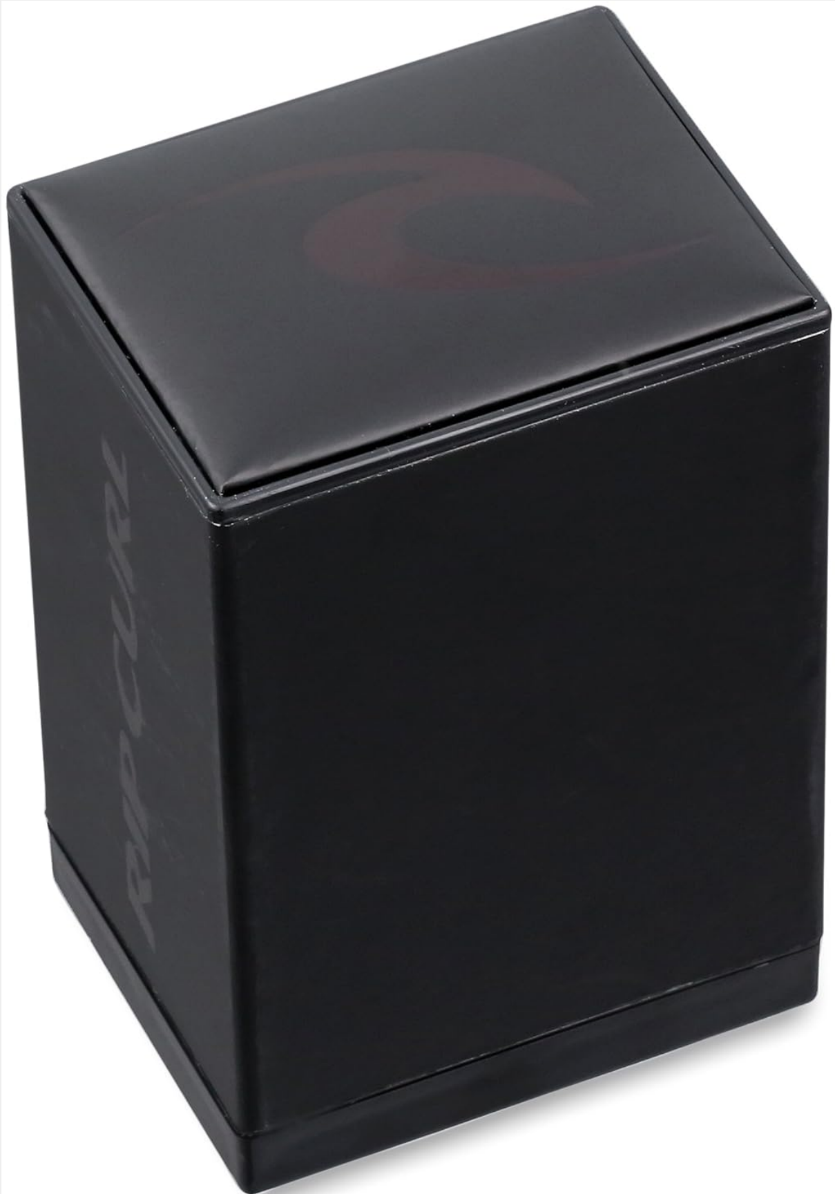
Image: A black square packaging box with the Rip Curl logo subtly embossed on its surface, representing the product's retail packaging.