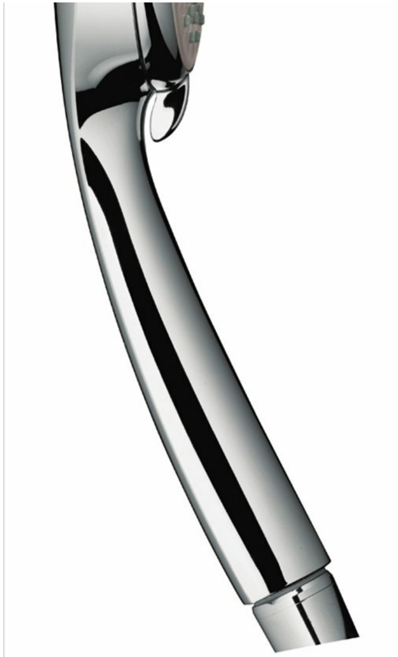
Image 1.1: The Hansgrohe Monsoon Eco Hand Shower, model 28351000, in chrome finish.