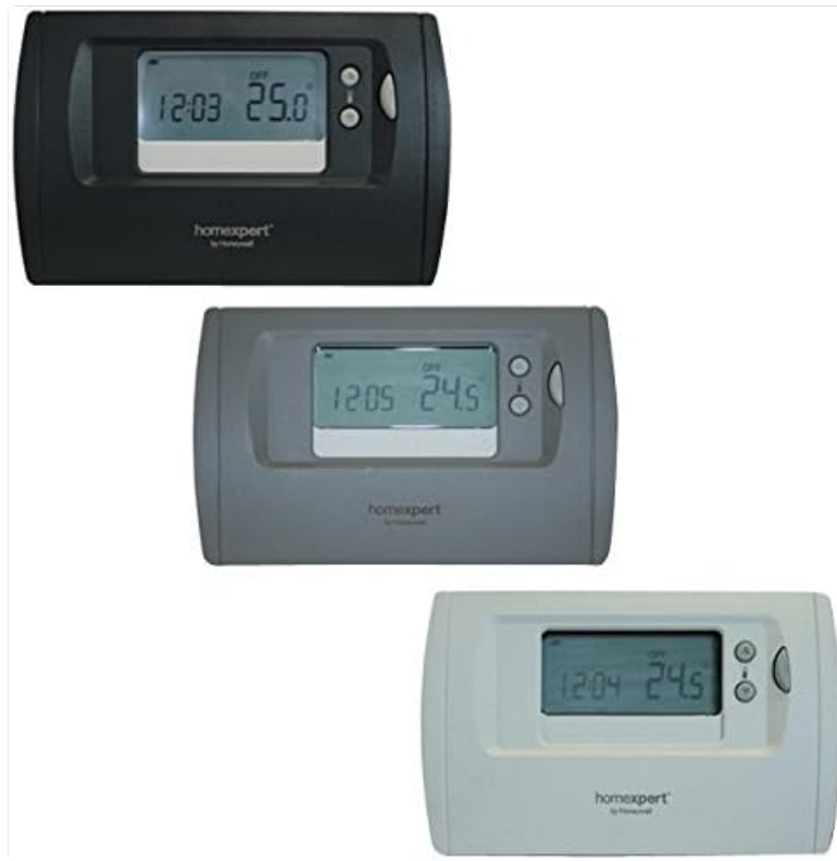
Image: Three Honeywell Homexpert Thermostats, each featuring a different colored front cover (black, grey, and white/cream). This demonstrates the customizable aesthetic options.