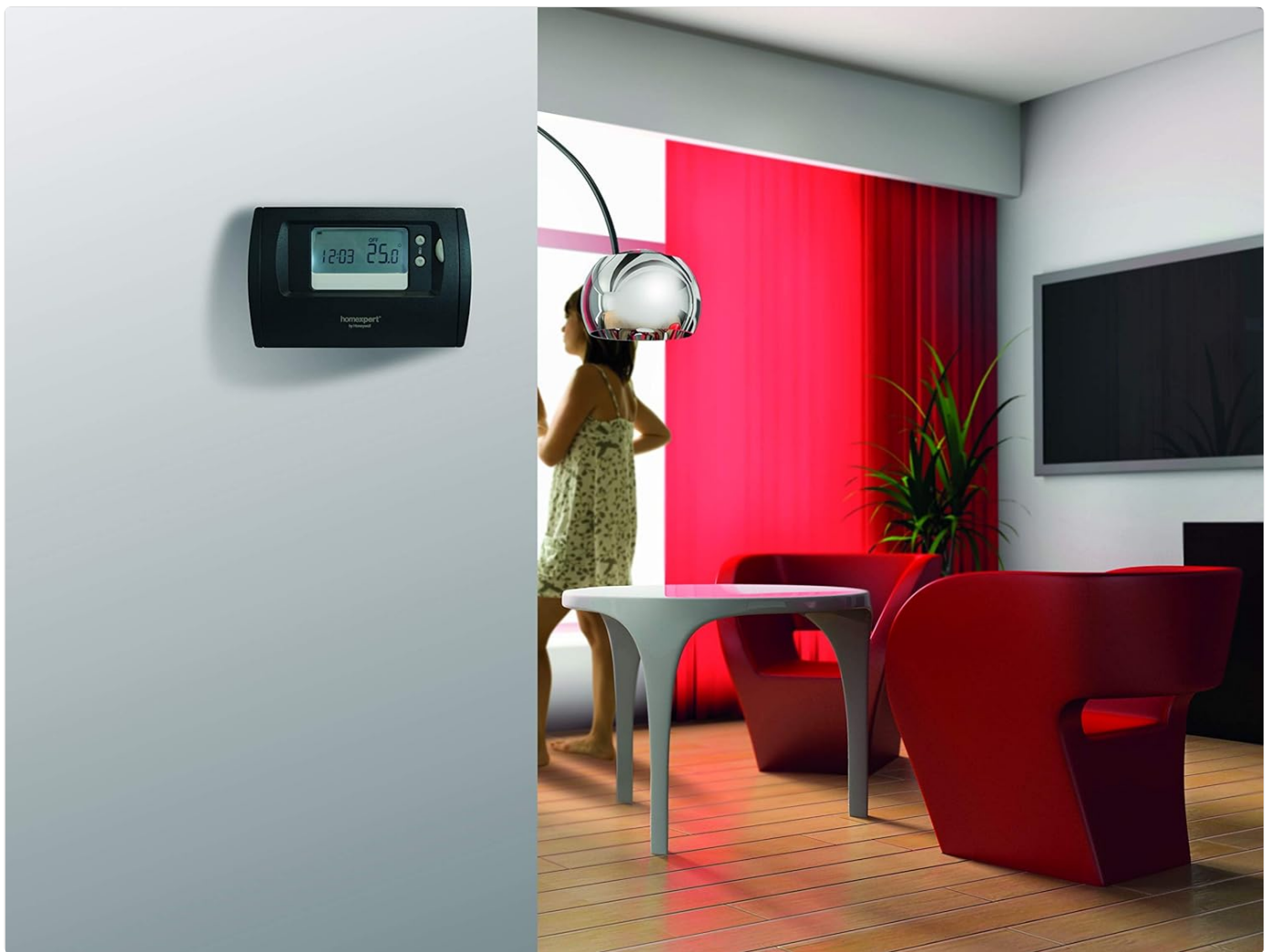
Image: Honeywell Homexpert Thermostat mounted on a wall in a modern living room setting. This illustrates a typical installation environment.