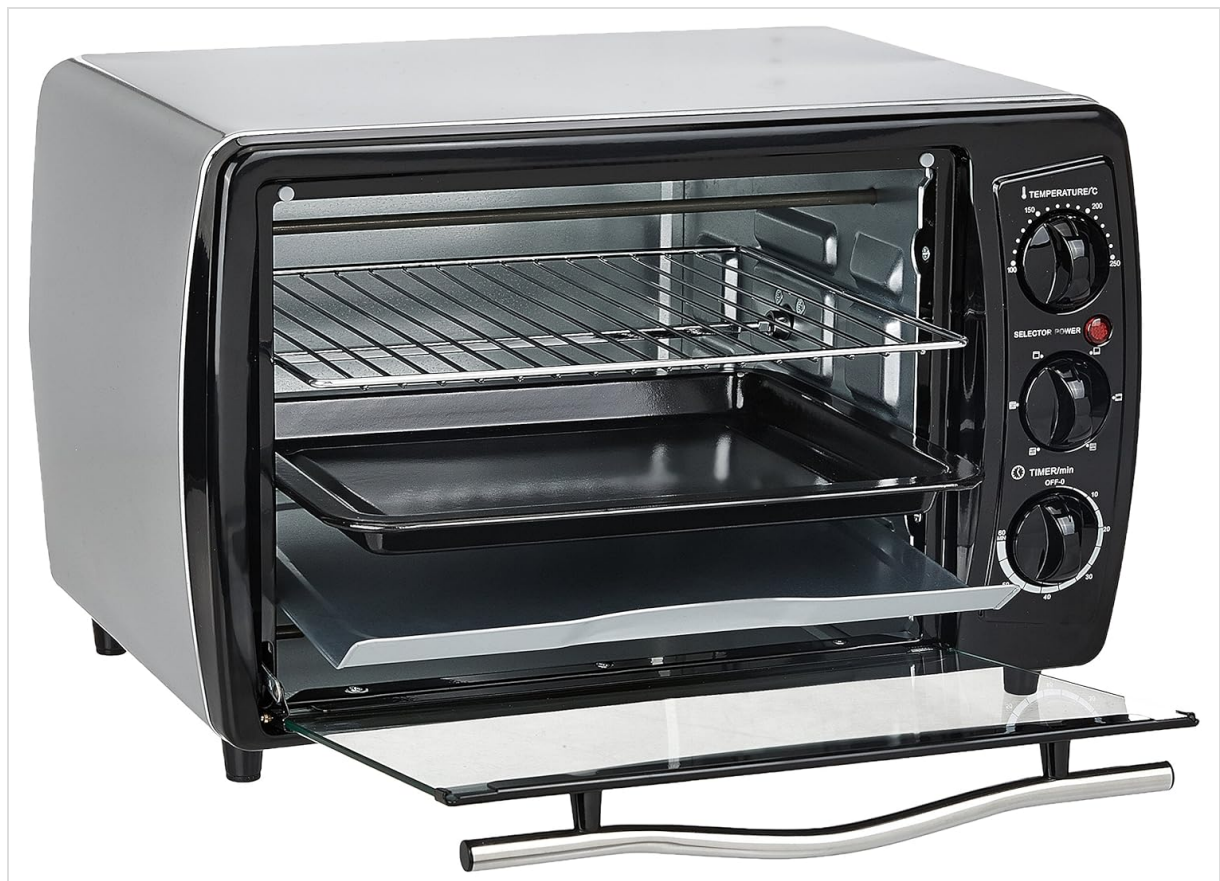
Figure 2: Interior view of the Prestige POTG 19 PCR Oven Toaster Grill with the door open, displaying the baking tray, grill rack, and crumb