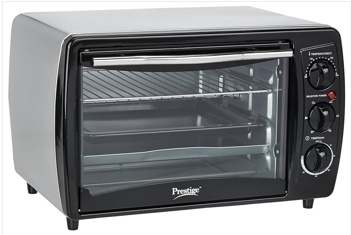
Figure 1: Front view of the Prestige POTG 19 PCR Oven Toaster Grill with the door closed, showing the main unit and control panel.