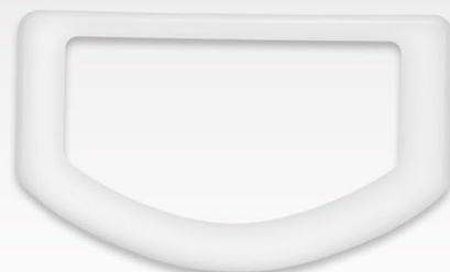
1 CARPET GLIDER

All components included with your Power Fresh Steam Mop.