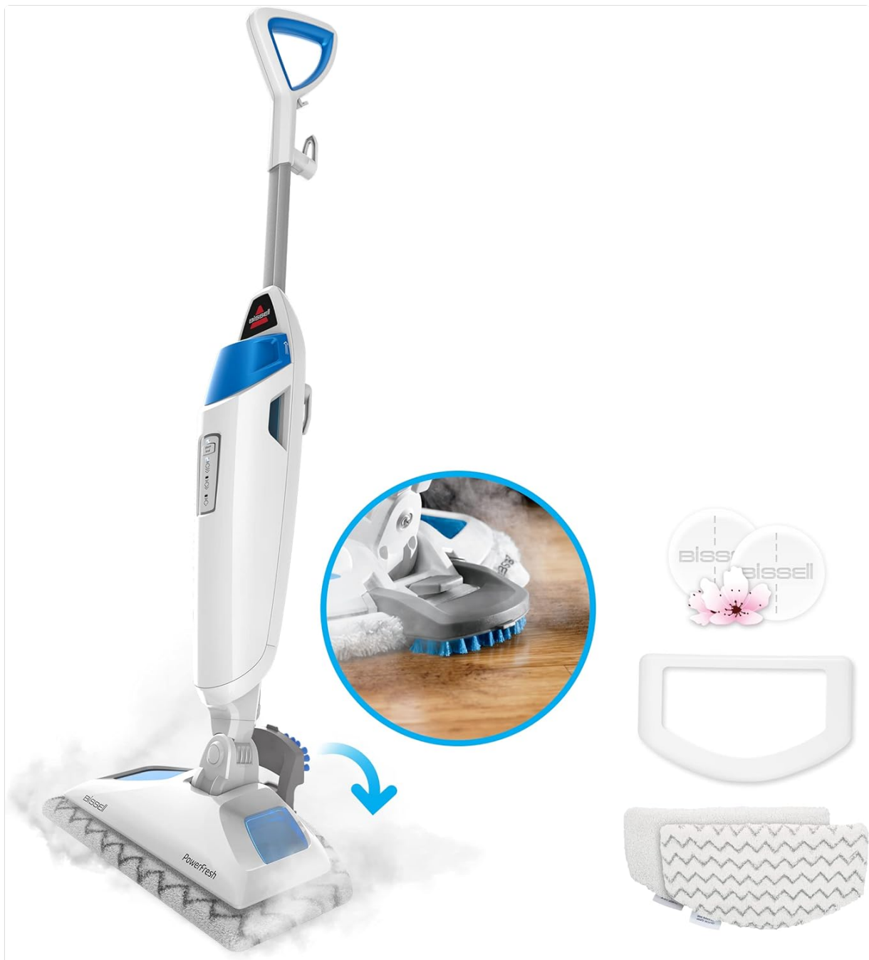
The Bissell Power Fresh Steam Mop, ready for use.