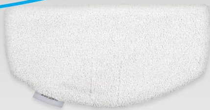
1 SOFT PAD