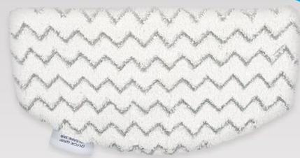
1 SCRUBBY PAD