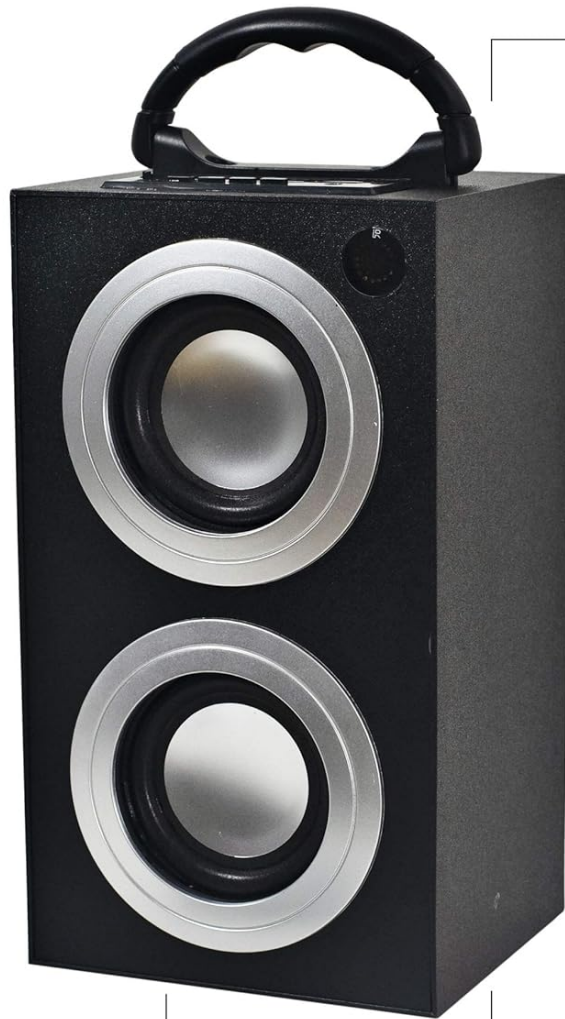
Figure 3: Front Panel Features. This diagram highlights key components such as the mini-tower speakers, LED display, digital volume control, and indicates the built-in rechargeable battery and FM stereo radio capabilities.