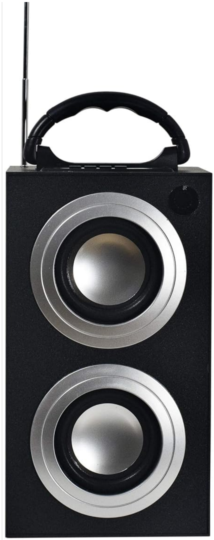
Figure 4: Top Panel and Antenna. This image shows the top of the unit with the extendable rod antenna fully raised, used for FM radio reception.