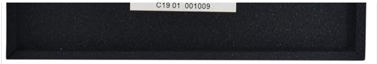
Figure 5: Bottom Panel Information. The bottom of the unit displays the product label, which includes the model number (CR4189), power specifications, and regulatory compliance details.