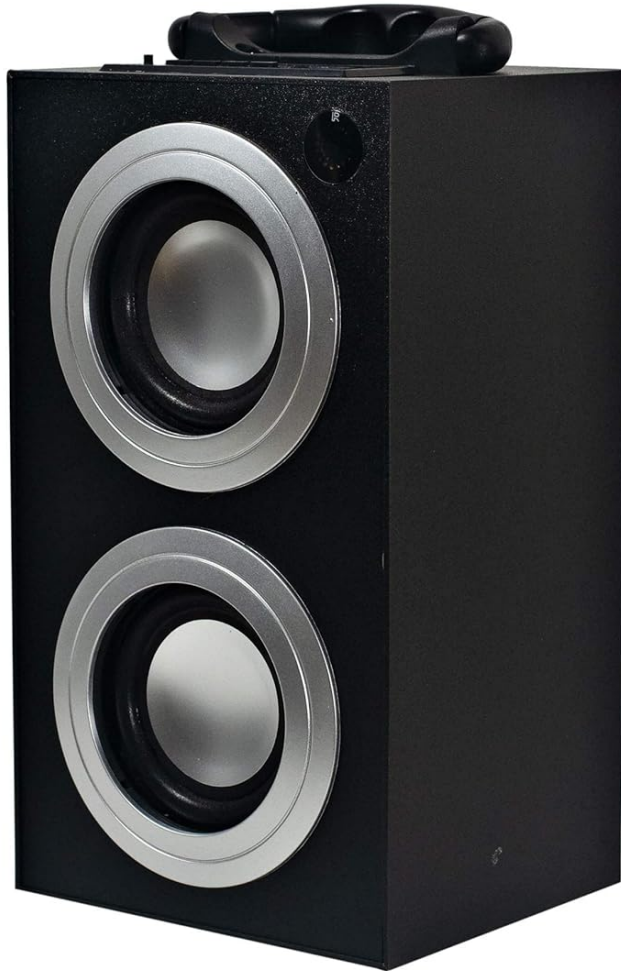
Figure 6: Product Dimensions. This image illustrates the approximate height, width, and depth of the unit.