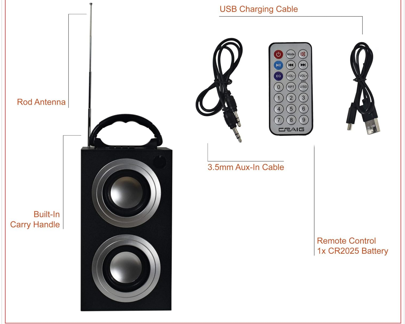
Figure 1: Included Accessories. This image displays the main unit alongside its USB charging cable, 3.5mm auxiliary input cable, and the remote control.