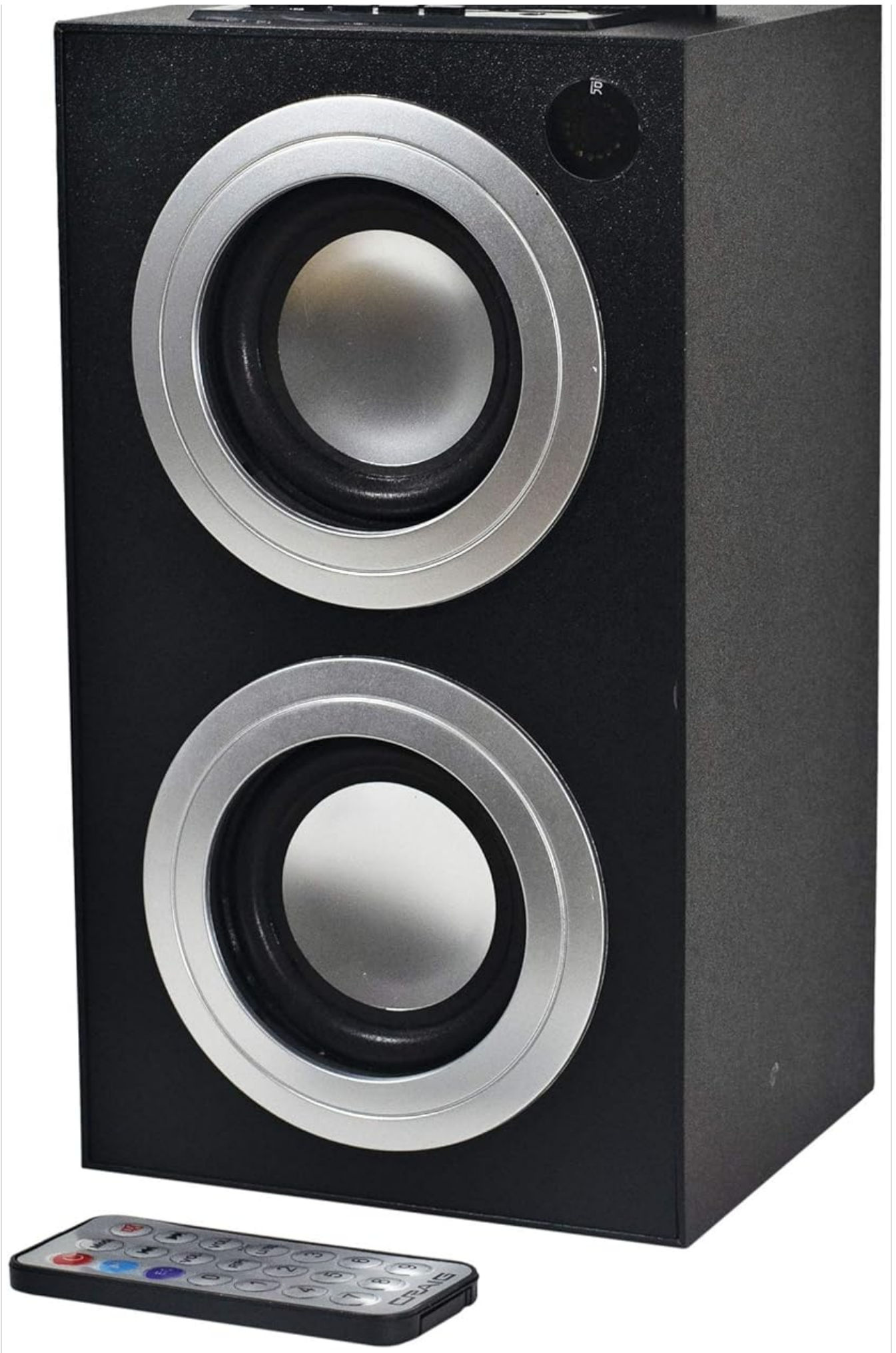
Figure 2: Overall Product View. This image shows the Craig CR4189 unit from the front, with the remote control placed in front of it.