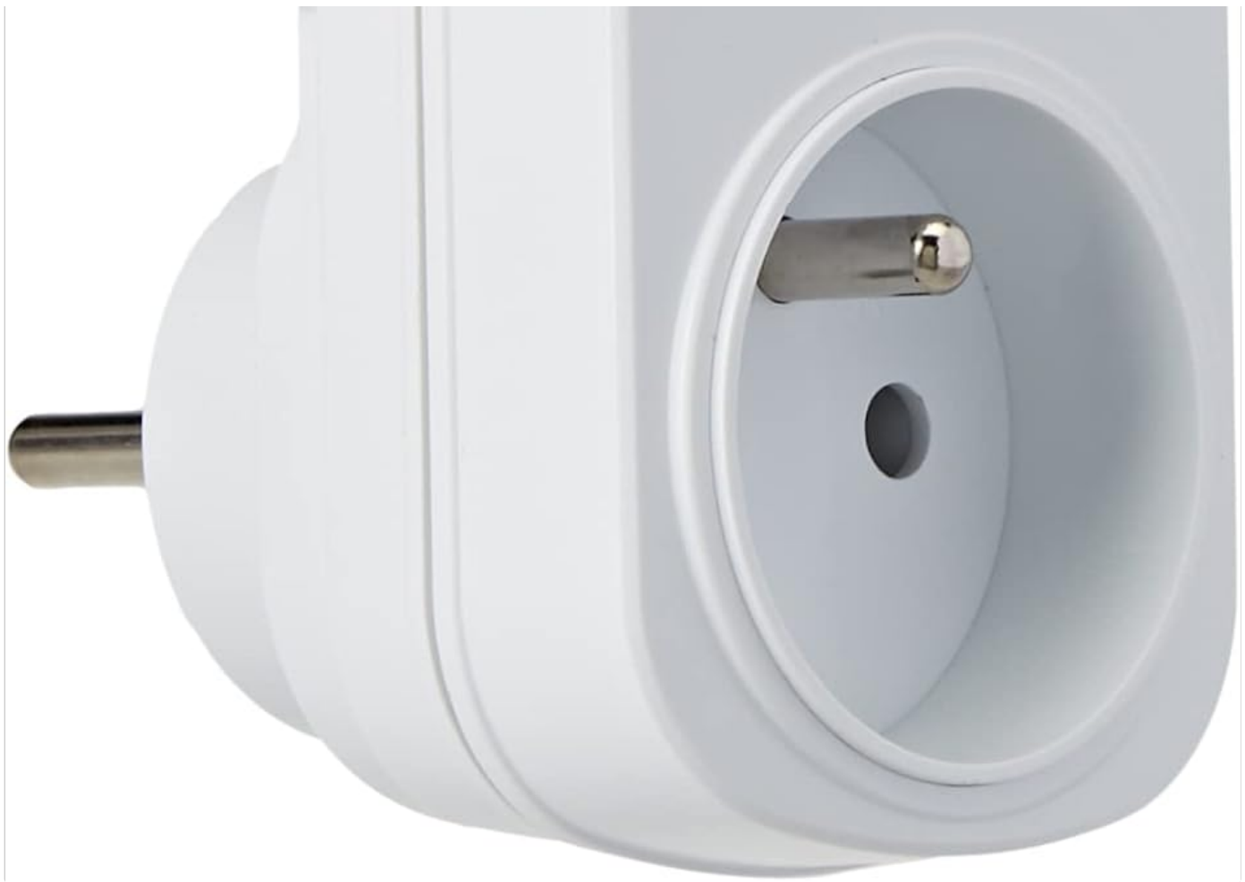
Image: Side view of a single Chacon receiver plug, showing its compact design.