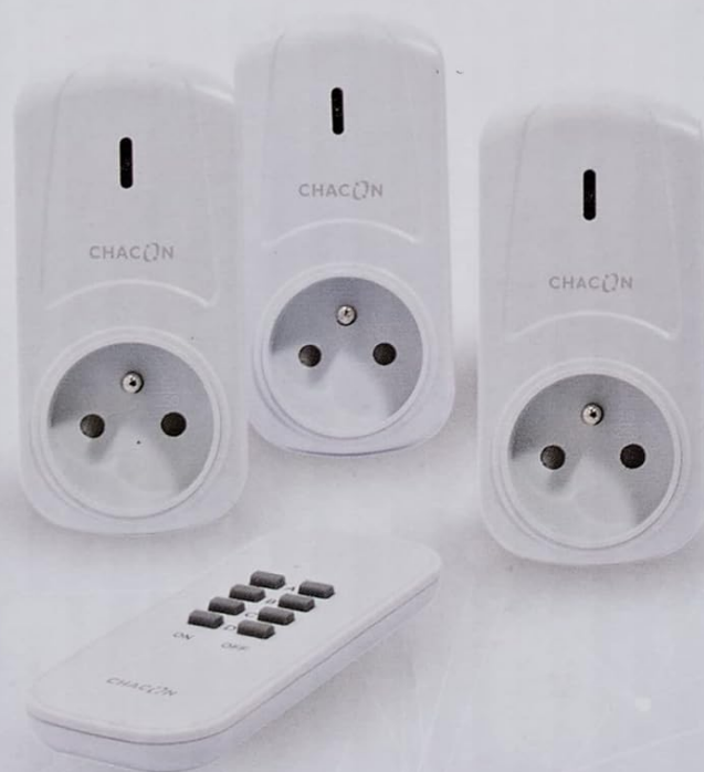
Image: Overview of the Chacon 54660 set, showing three receiver plugs and one remote control.