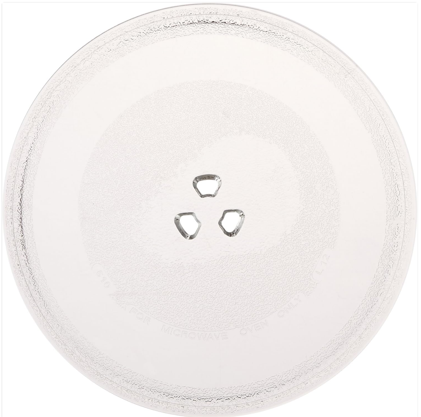
Figure 3.1: The ewave 10-inch Microwave Glass Plate/Tray. This image shows the clear glass construction and the three central indentations designed to fit onto the microwave's turntable coupler, ensuring proper rotation.