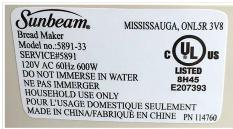
Image 4: Another example of a Sunbeam bread maker label, indicating "Model no.: 5891-33" and "SERVICE#5891". This label also provides electrical details and care instructions in multiple languages.