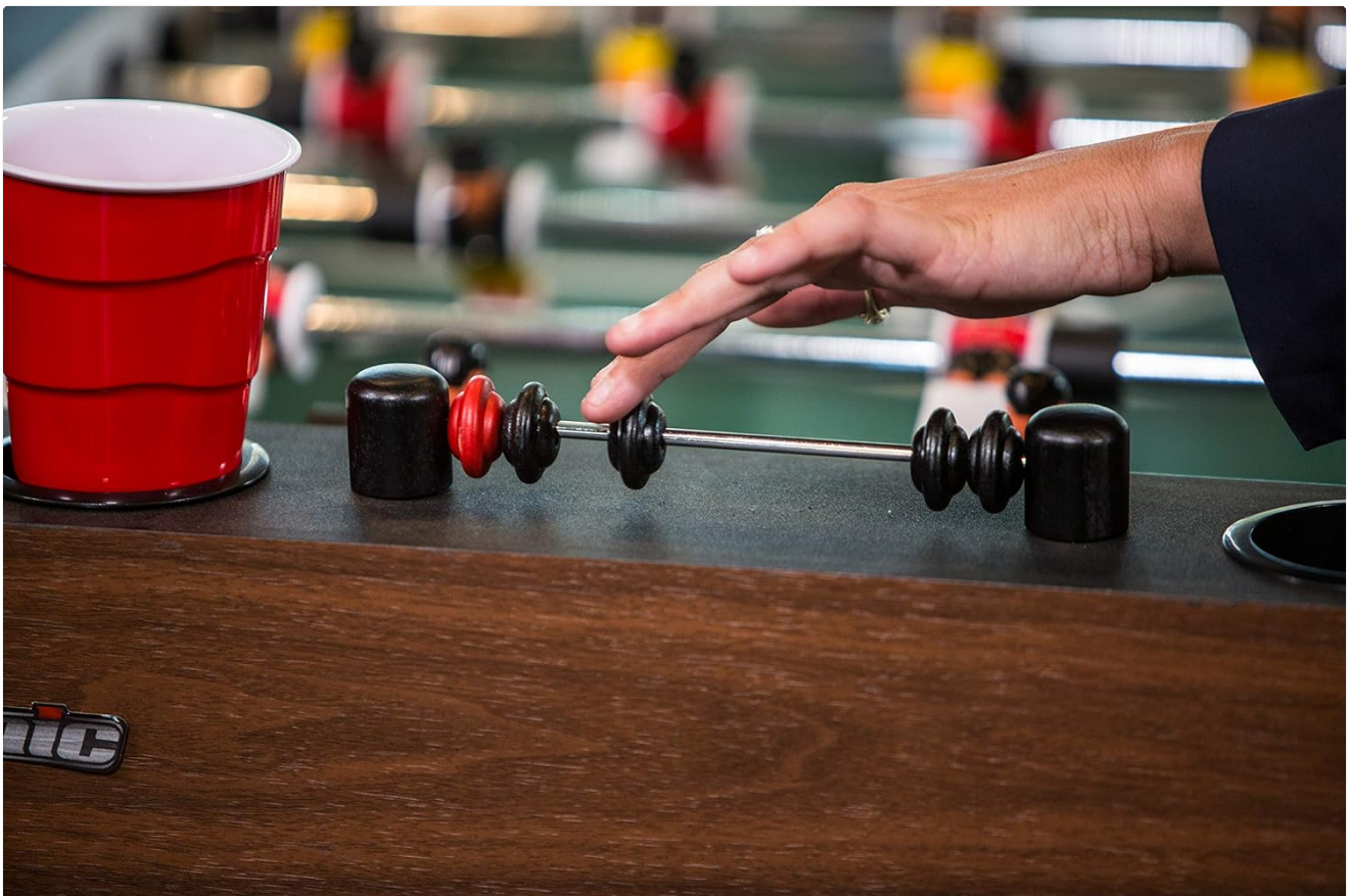
Figure 5.1: Abacus scoring unit in use.