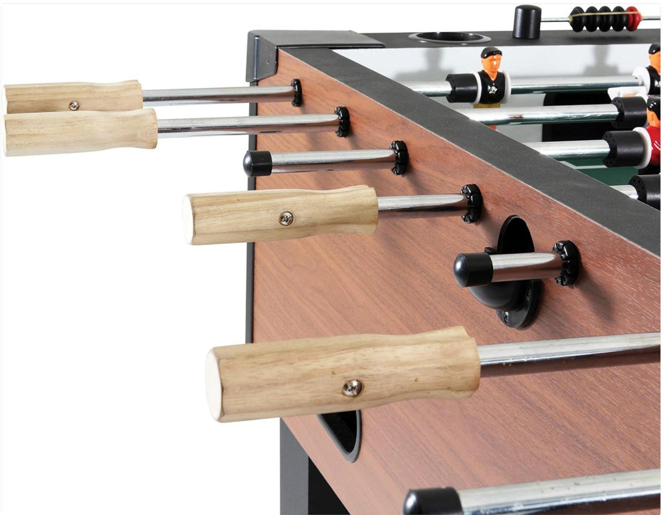
Figure 8.1: Product Dimensions.