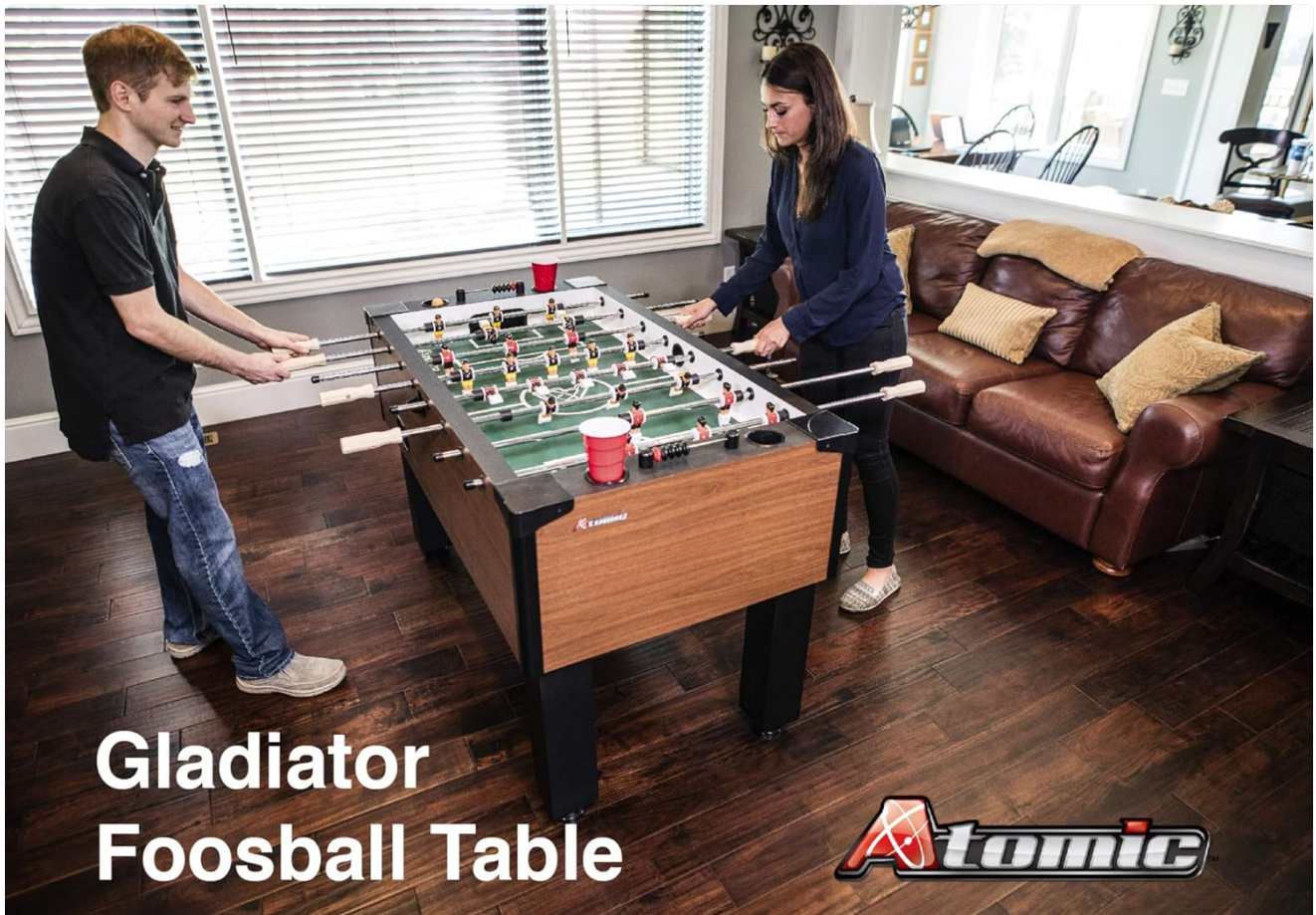
Figure 1.1: The Atomic Gladiator Foosball Table in use.

The Atomic Gladiator Foosball Table is designed for recreational play, featuring a durable construction and integrated conveniences. This manual provides essential information for the safe assembly, operation, and maintenance of your foosball table.