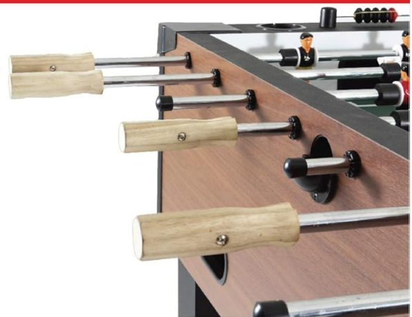
Figure 3.1: Foosball players and rods, part of the package contents.