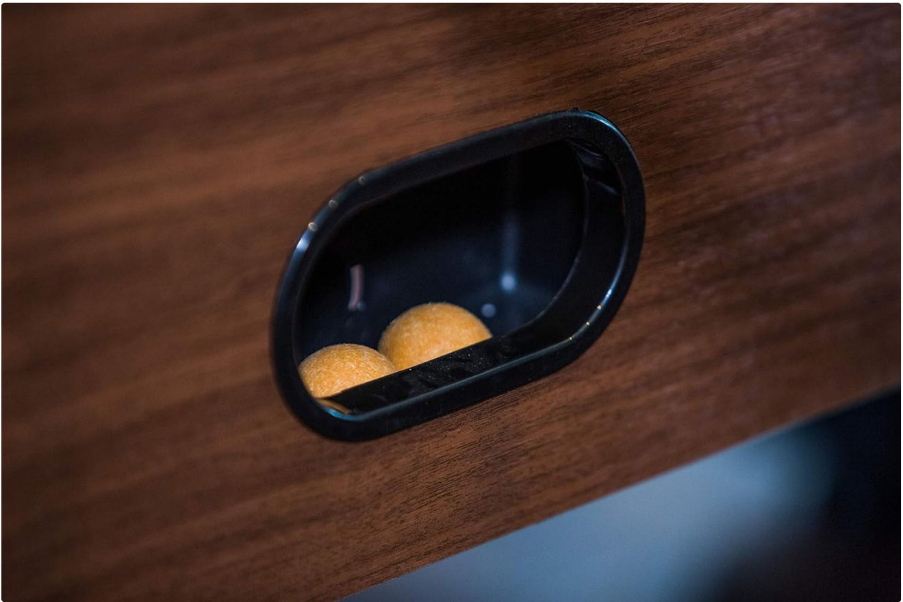
Figure 5.2: Internal ball return system.