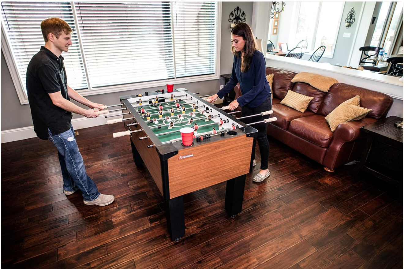
Figure 4.2: Wooden handles for player control.

10. Final Inspection and Leveling: Once fully assembled, carefully flip the table upright with assistance. Adjust the leg levelers until the playing surface is perfectly flat and stable.