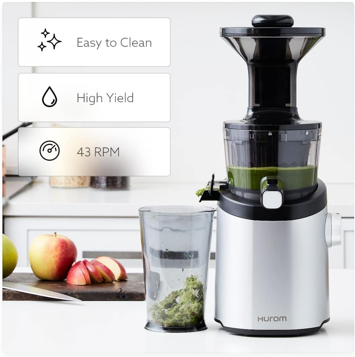
Image: The Hurom H101 juicer actively extracting green juice, highlighting its key features: Easy to Clean, High Yield, and 43 RPM slow squeeze technology.