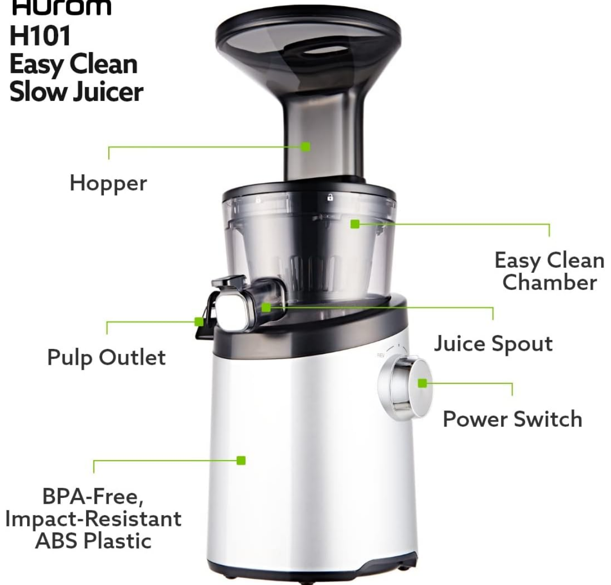
Image: A detailed diagram labeling the main components of the Hurom H101 juicer: Hopper, Easy Clean Chamber, Pulp Outlet, Juice Spout, and Power Switch.