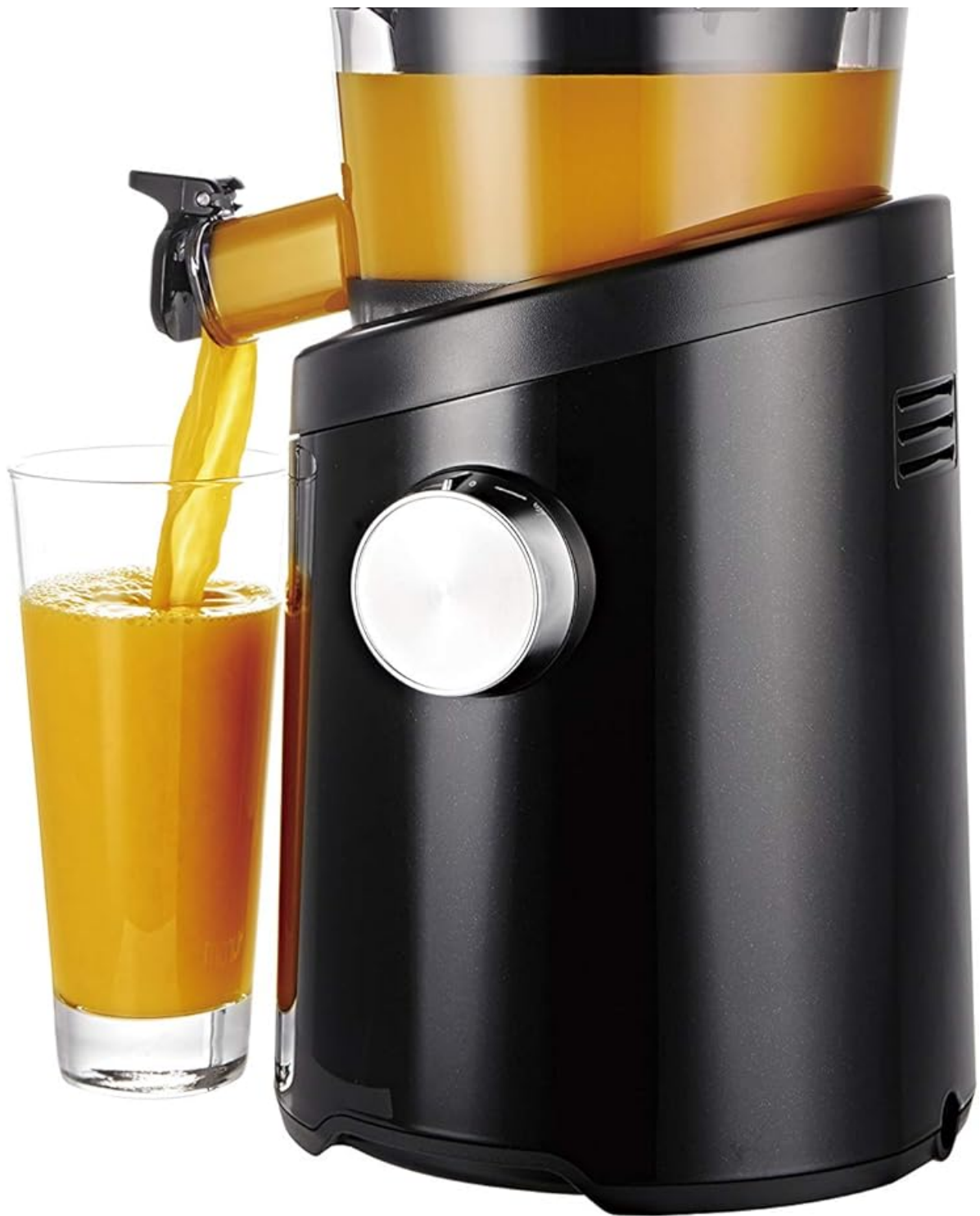
Image: The Hurom H101 Easy Clean Slow Juicer in Pearl Black, showcasing its sleek design.