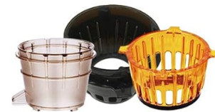
Fine, Coarse, and Ice Cream Strainer

Image: An illustration showing all items included in the Hurom H101 packaging: Instruction Manual, Recipe Book, Large & Small Cleaning Brushes, Twin Wing Auger, Juice & Pulp Container, Hopper & Chamber, Juicer Body, Pusher, Drying Rack, and Fine, Coarse, and Ice Cream Strainers.