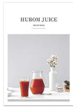
Manual and Recipe Book