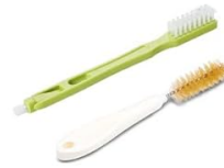
Large & Small Cleaning Brush