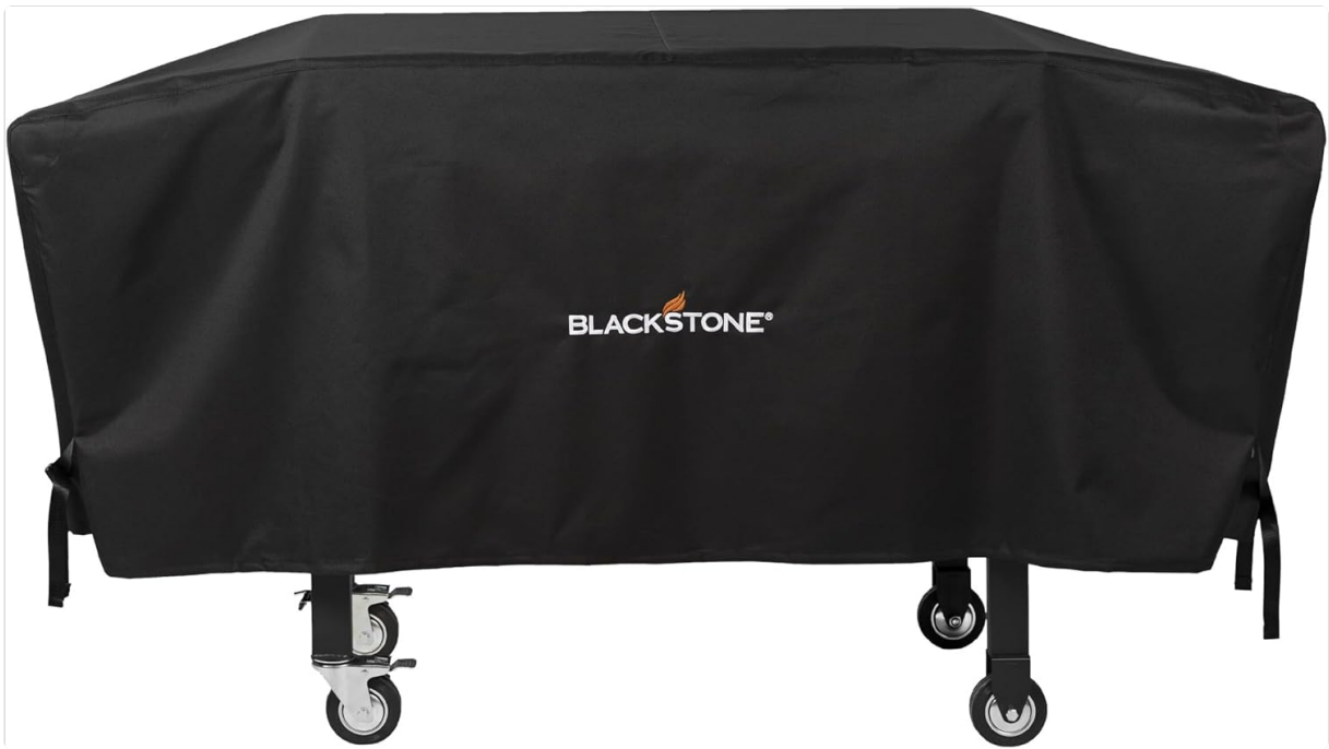
Blackstone 36-inch Griddle Cover installed on a griddle, showcasing its full coverage and the Blackstone logo.