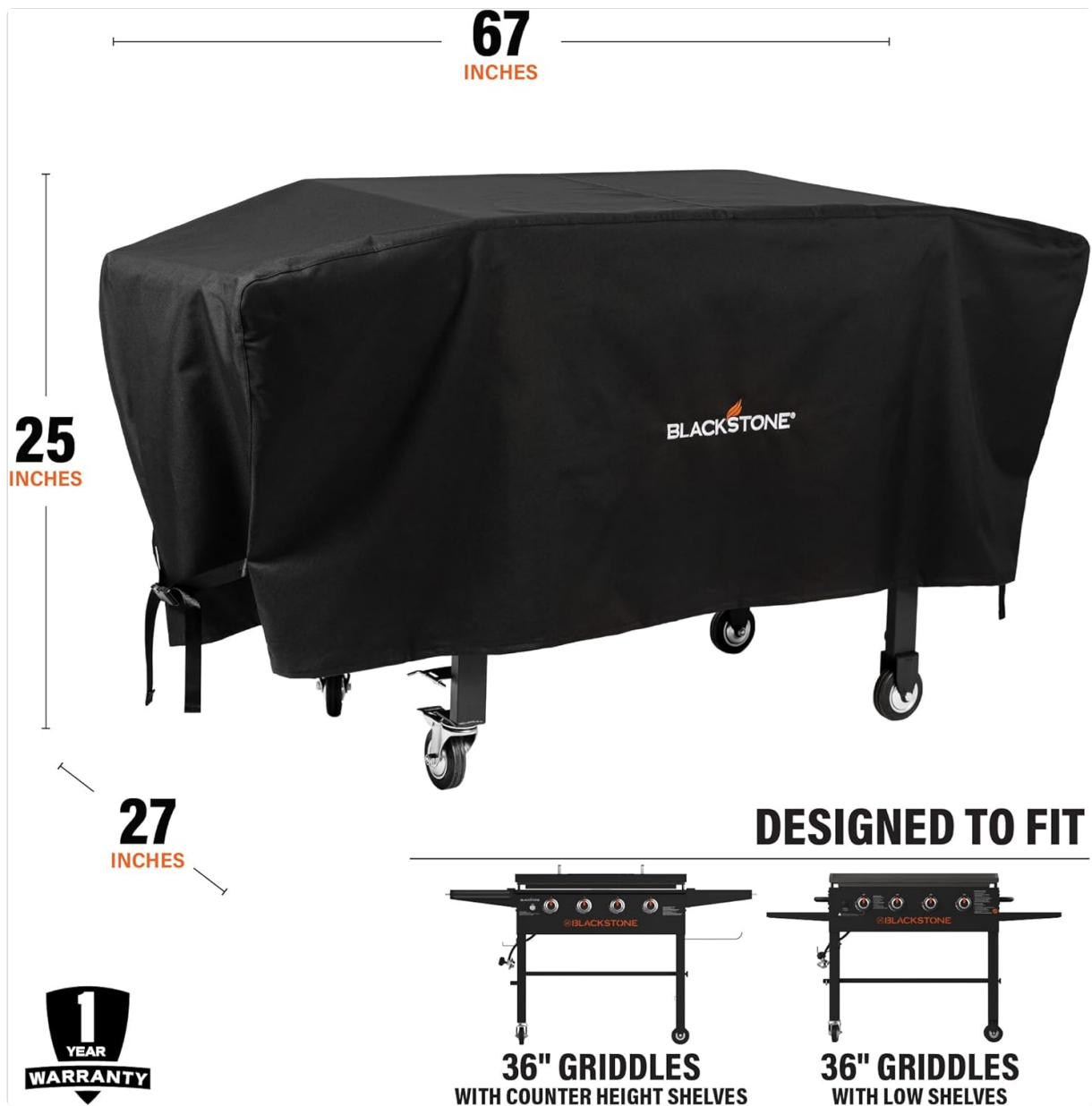
Diagram illustrating the dimensions of the Blackstone 36-inch Griddle Cover, designed to fit 36-inch griddles with counter height or low shelves.