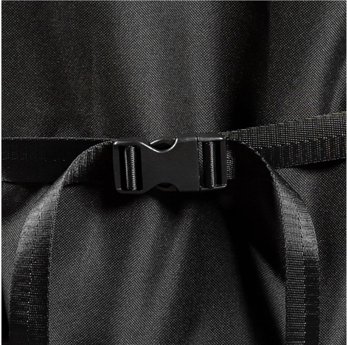
Close-up of the water-resistant 600D polyester fabric of the Blackstone Griddle Cover, showing water beading on the surface.