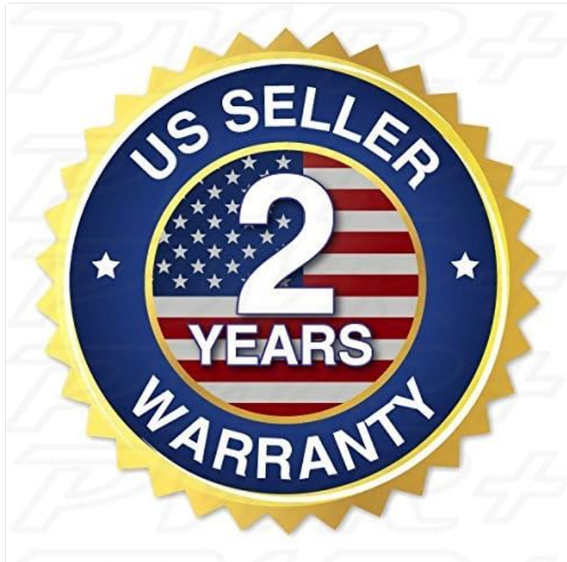
Image: A badge indicating a 2-year warranty from a US seller, representing PWR+'s commitment to product quality and customer satisfaction.