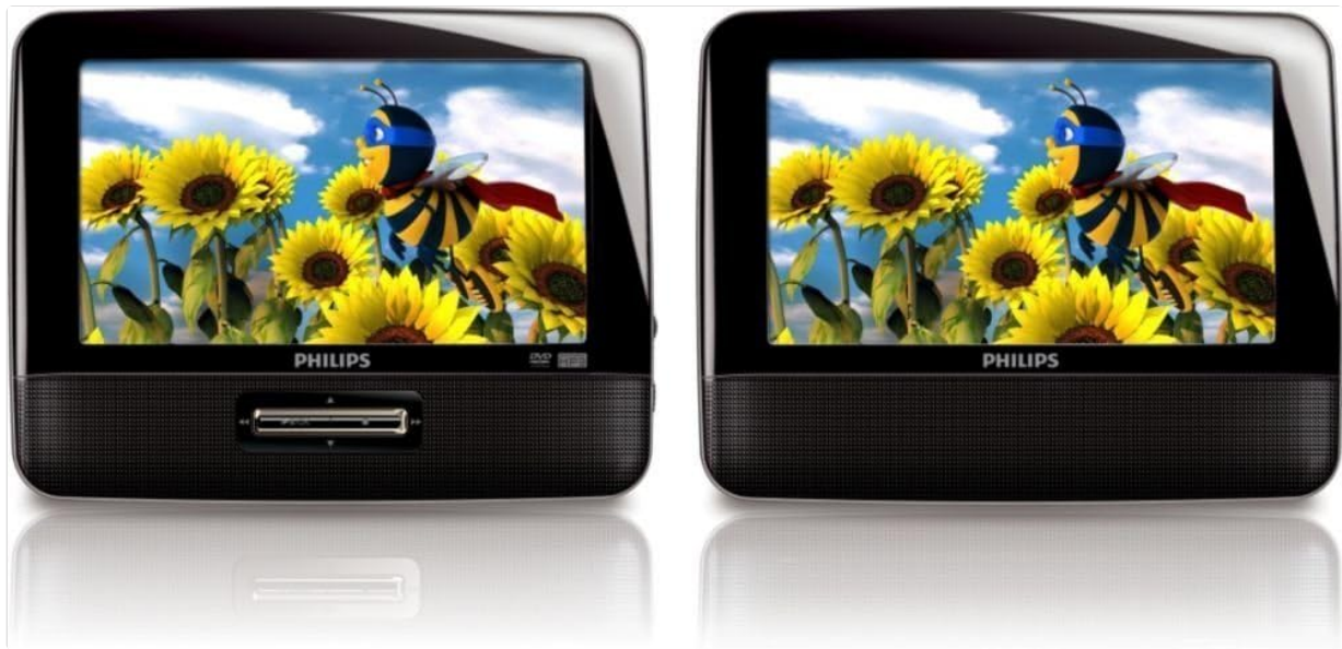
Image: Two portable DVD players displaying synchronized content, demonstrating a typical setup with an AV cable connection.

Your browser does not support the video tag.