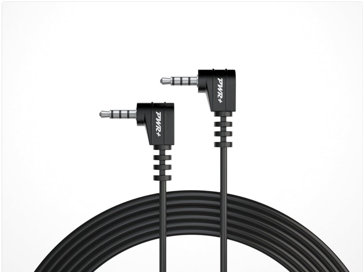
Image: Close-up view of the right-angle 3.5mm male connectors on the PWR+ AV cable.