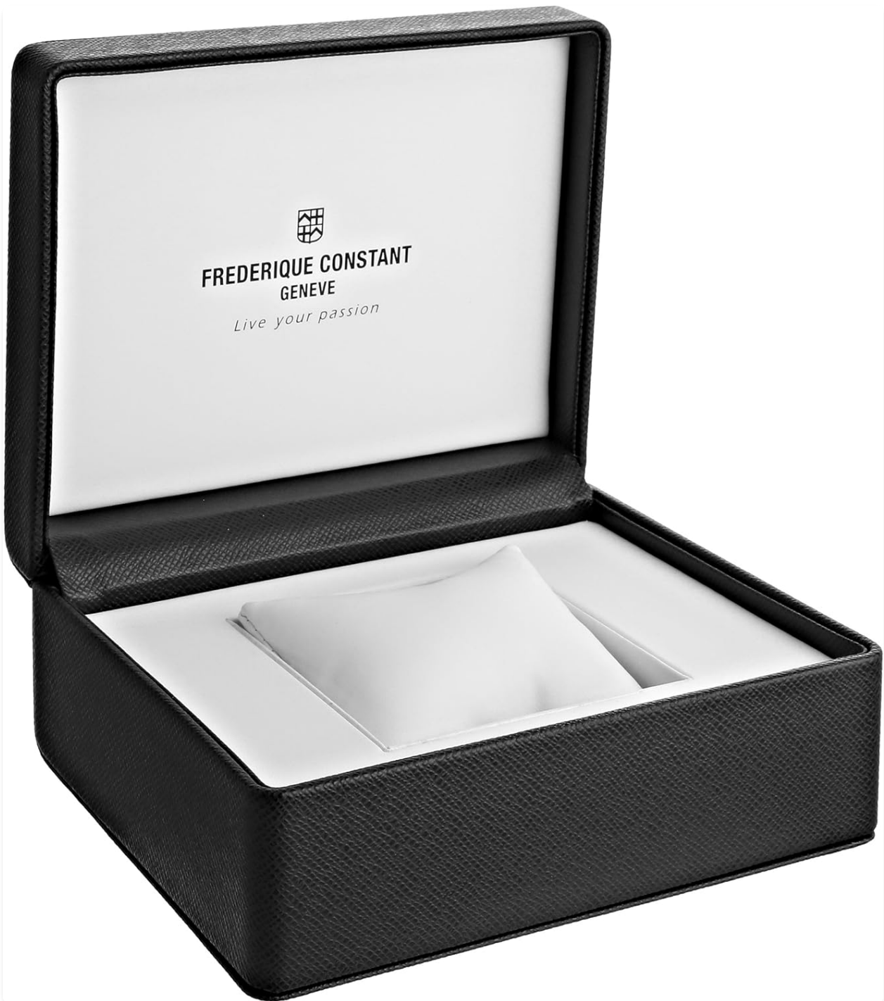
Figure 8.1: The elegant presentation box for the Frederique Constant watch, designed to protect and showcase the timepiece. The box features the brand logo and motto.

For service, repairs, or technical assistance, it is highly recommended to contact an authorized Frederique Constant service center. Using unauthorized service providers may void your warranty.