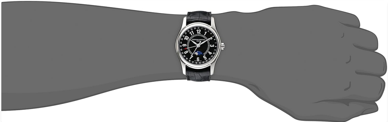
Figure 3.1: The Frederique Constant FC-330B6B6 watch displayed on a wrist, illustrating its size and fit. The watch features a black leather strap and a polished stainless steel case.

To set the various functions of your watch: