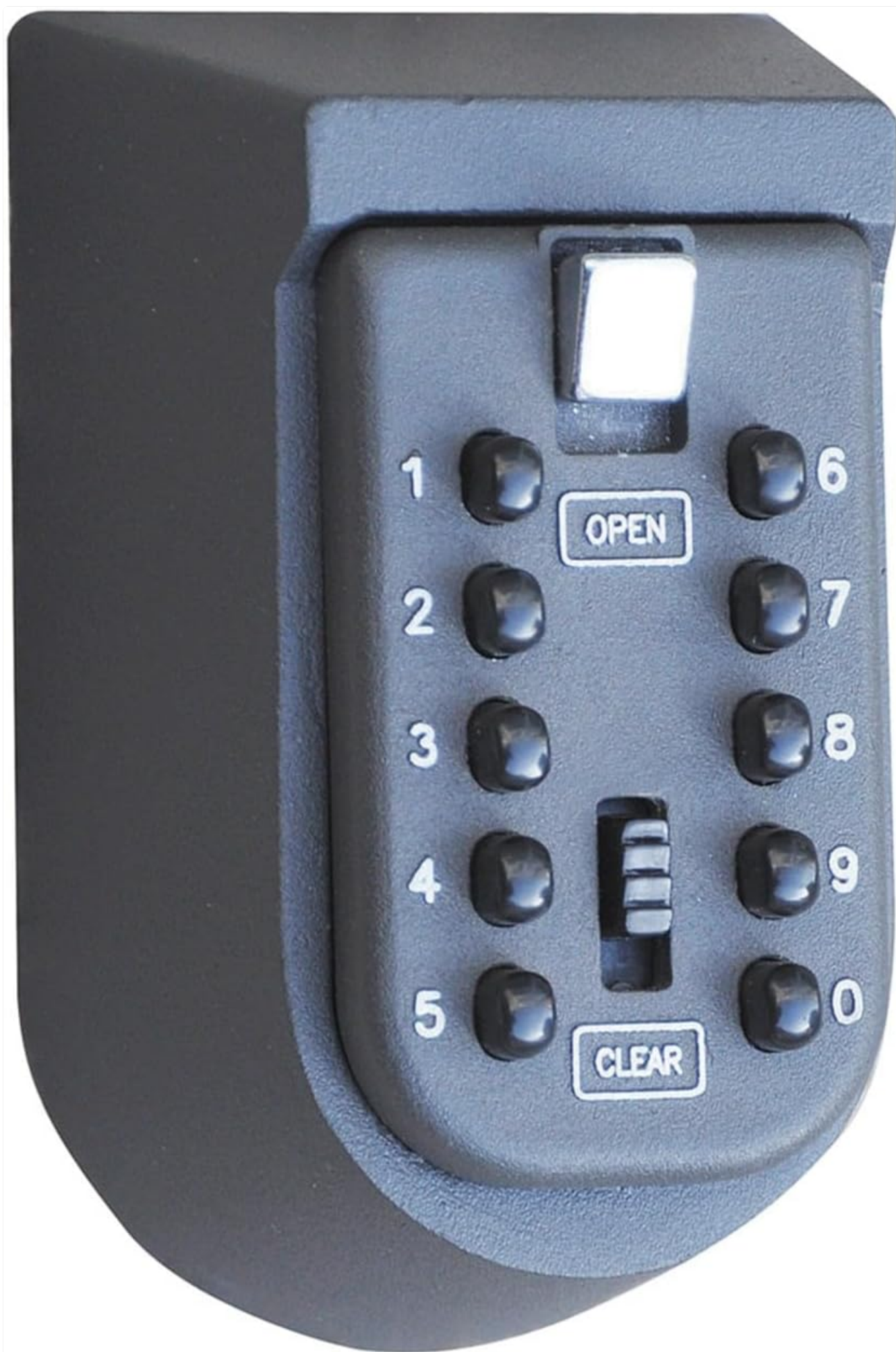
Figure 1: Front view of the AIDAPT Wall Mounted Key Safe, showing the 10-digit keypad and open/clear buttons.