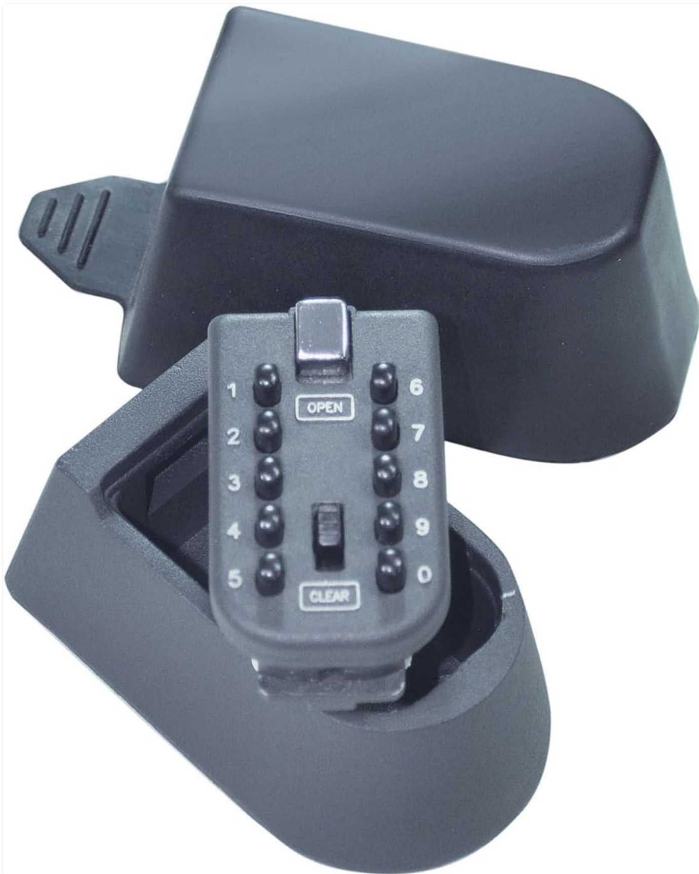
Figure 2: The key safe with its front panel detached, showing the internal mechanism and mounting points.