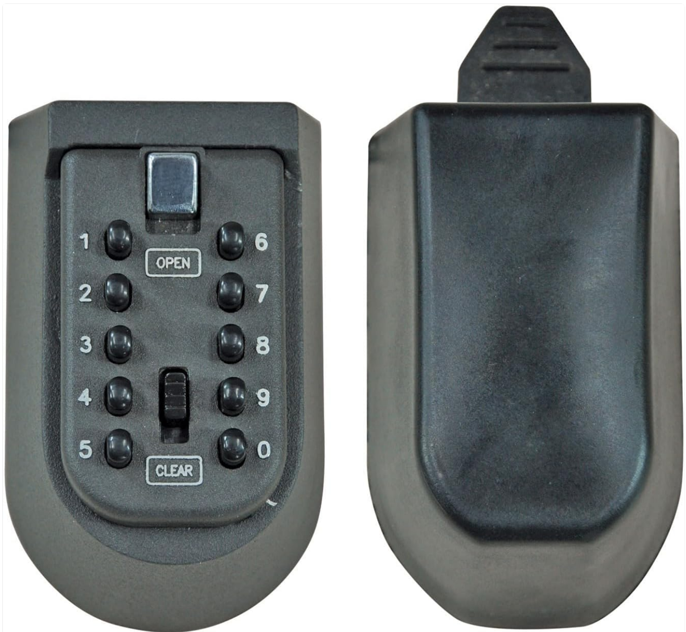
Figure 3: Front and back views of the key safe, highlighting the removable rubber weather cover.