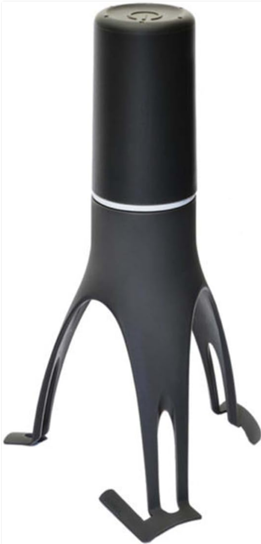
Figure 1: The Stirr Automatic Pan Stirrer.