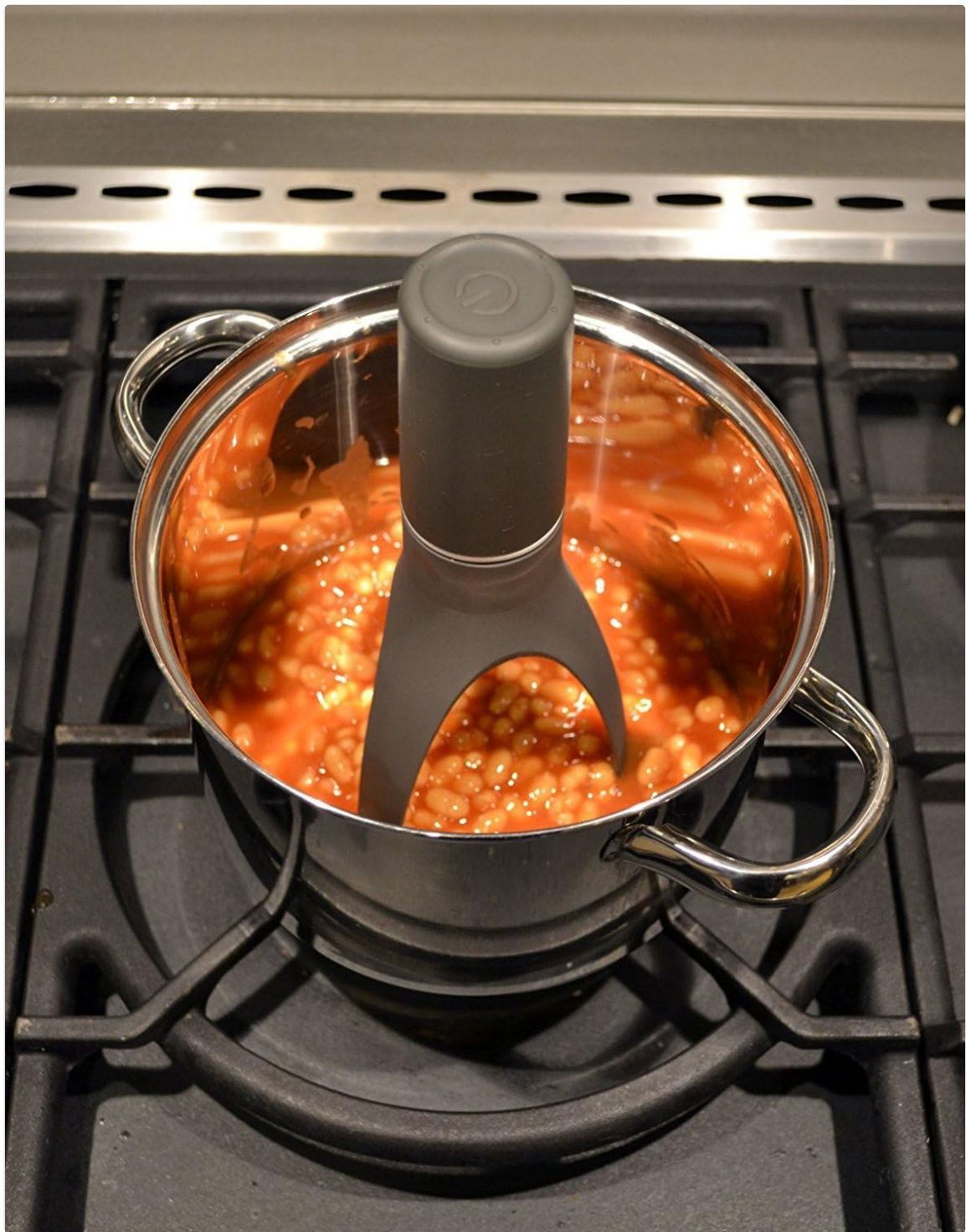
Figure 6: Stir in a pot with beans.