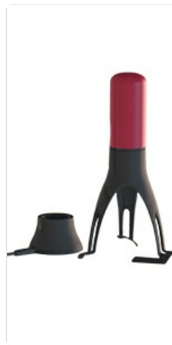
Figure 4: Attaching the nylon legs.