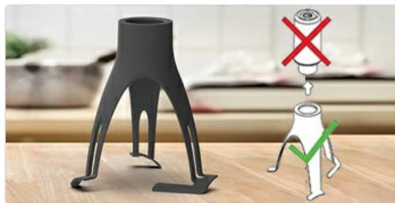
Figure 8: Illustrative movement of the Stirr.