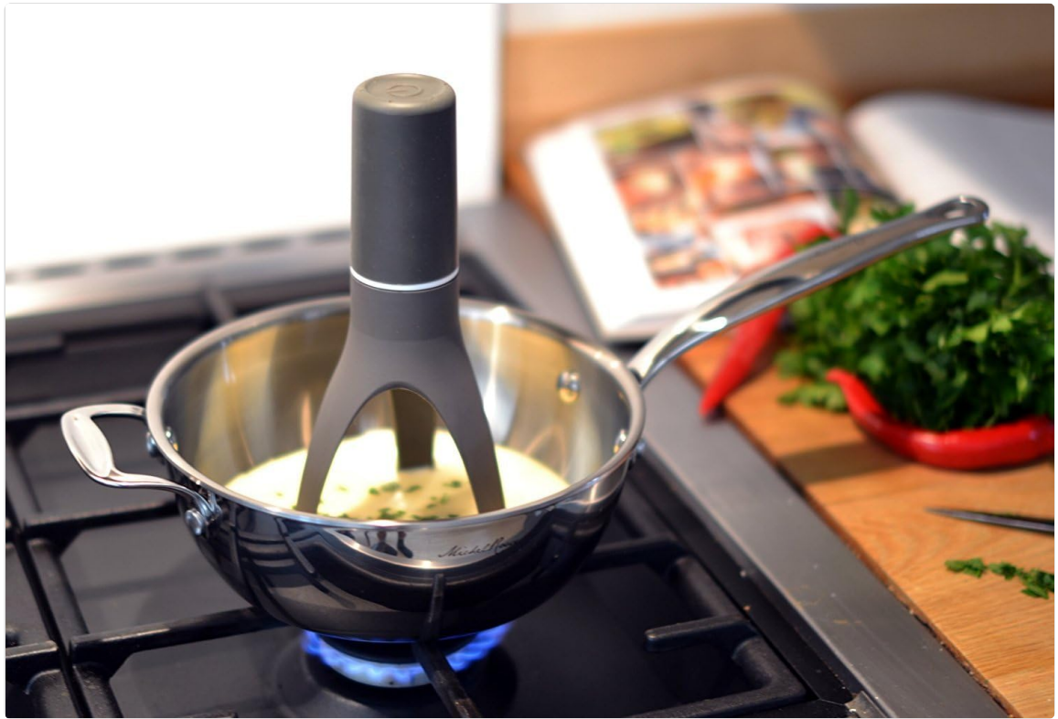
Figure 5: Stirr placed in a pan with sauce.