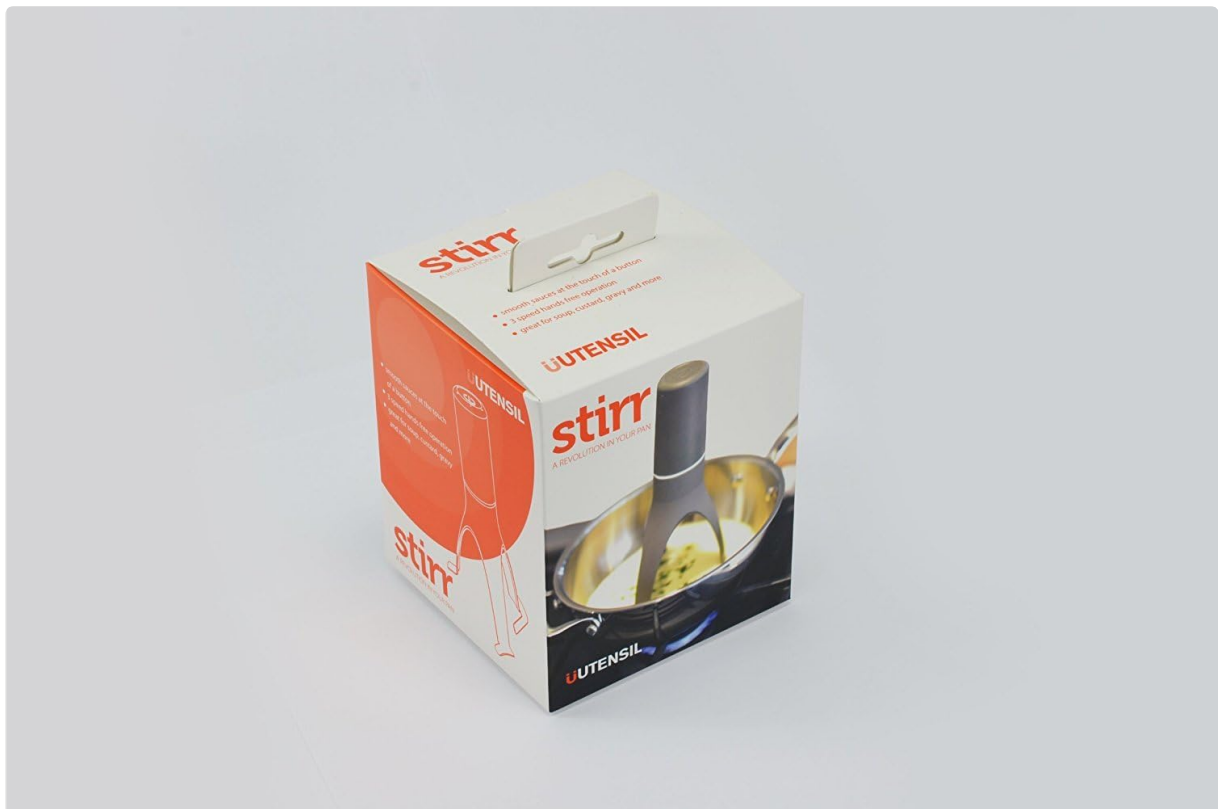
Figure 2: Product packaging, illustrating contents.

Note: 4 x AA batteries are required and are NOT included.