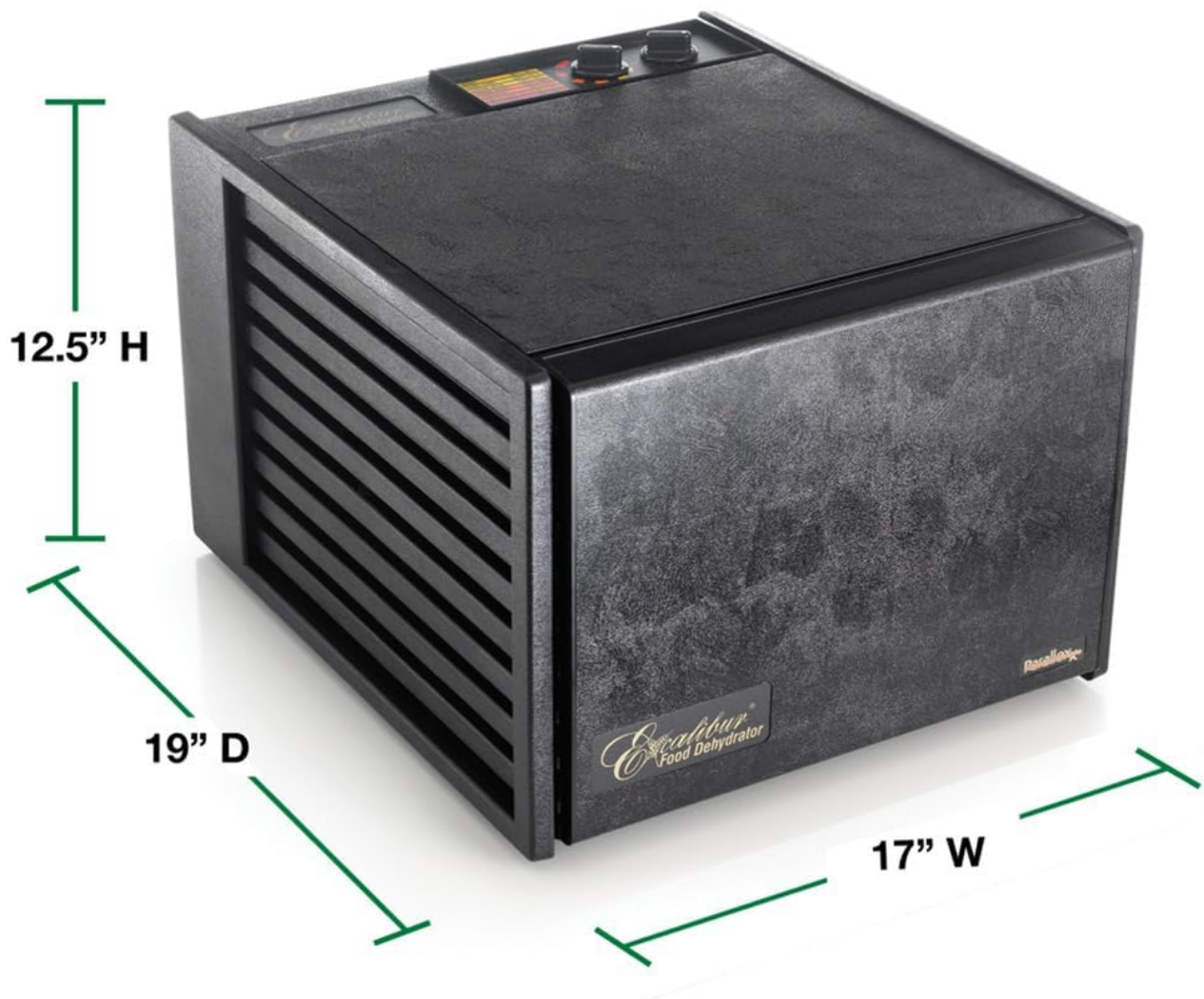
Figure 7: Product dimensions for the Excalibur 9-Tray Food Dehydrator.