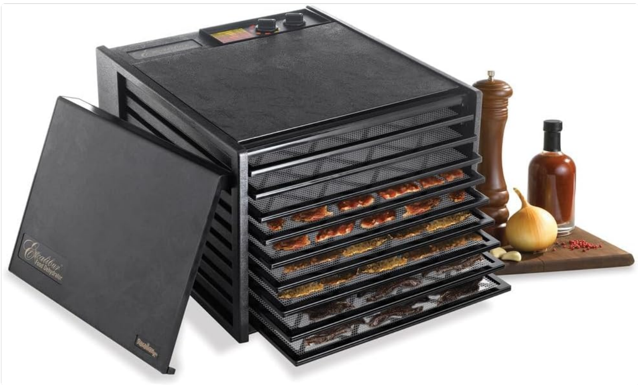
Figure 5: Trays inside the dehydrator loaded with beef jerky, ready for drying.