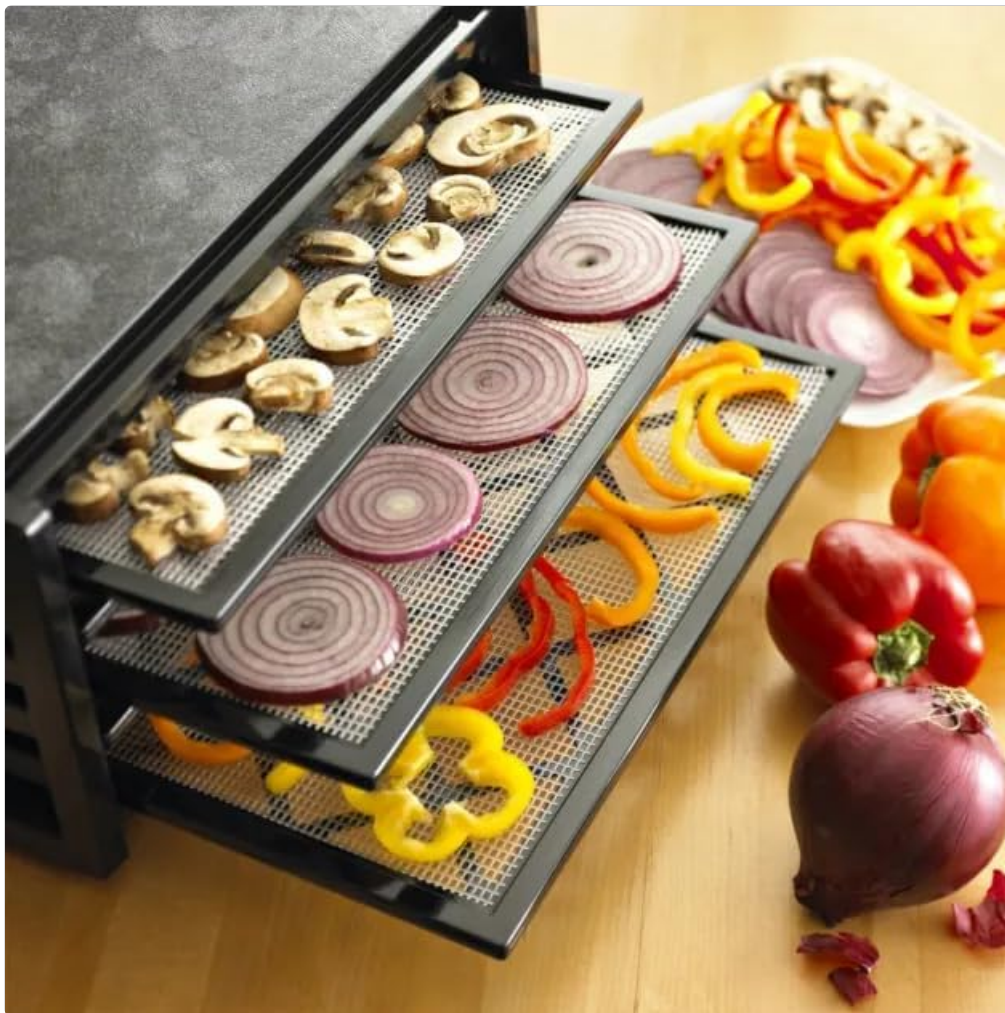
Figure 3: Trays loaded with uniformly sliced vegetables, demonstrating proper food placement for dehydration.