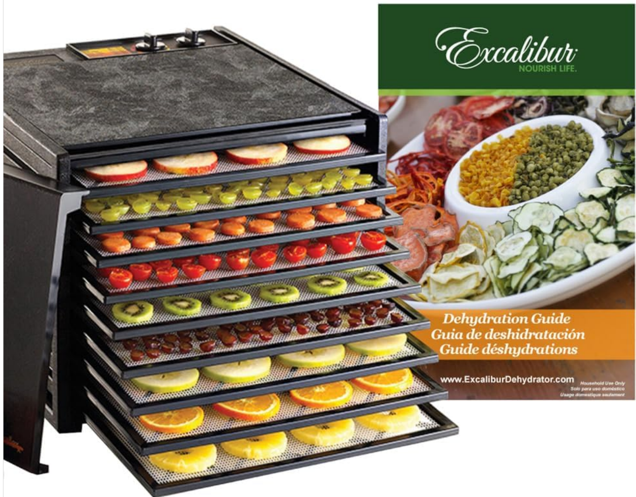
Figure 4: The control panel with the drying guide, indicating optimal temperatures for various food items.

For raw food preservation, maintain temperatures below 115-118°F to preserve enzyme activity and nutrient value. For jerky and meats, a higher temperature of 165°F is recommended for food safety.