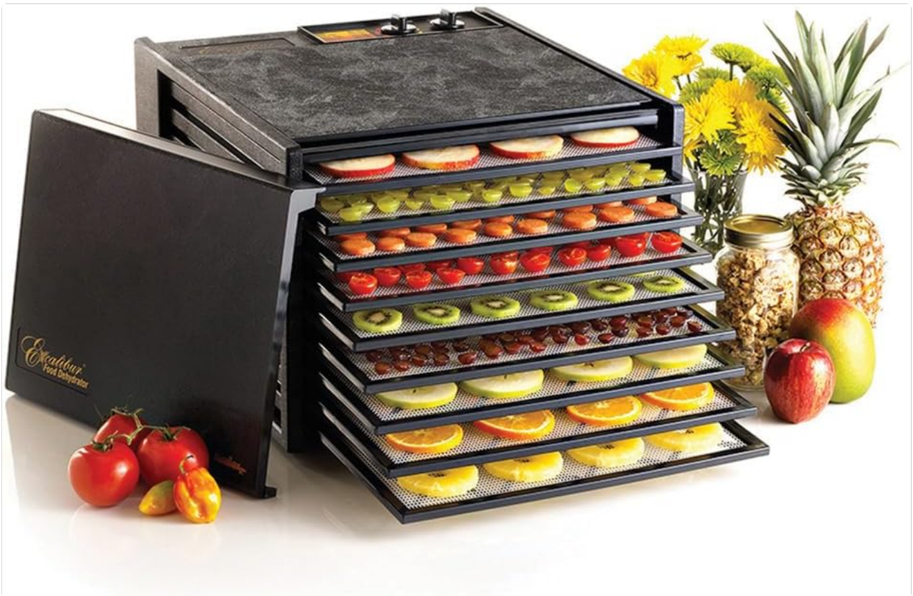
Figure 1: Excalibur 9-Tray Food Dehydrator with a variety of fruits and vegetables being dehydrated.