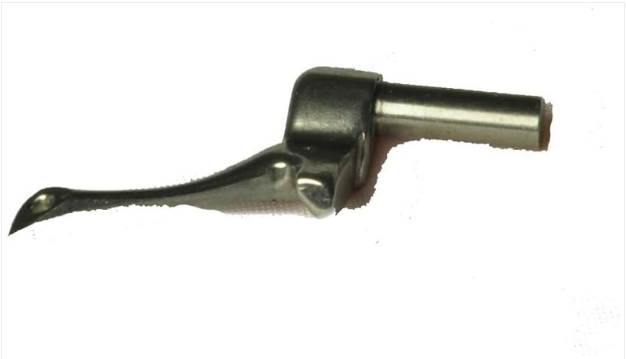
Figure 1: Baby Lock Serger Upper Looper. This image displays the Baby Lock Serger Upper Looper, a metal component designed for precise thread handling in compatible serger machines. It features a curved, pointed end for catching threads and a cylindrical base for attachment.

This manual provides instructions for the Baby Lock Serger Upper Looper, a critical component for achieving precise and consistent stitches on your Baby Lock serger machine. This upper looper is compatible with Baby Lock Serger Models BL402 and BL5370ED. Proper installation and maintenance are essential for optimal serger performance.