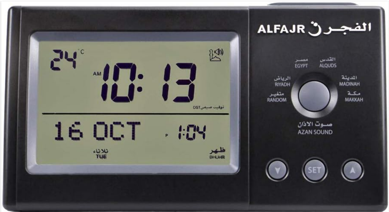
Figure 1: Front view of the ALFAJR CT-11 Azan Clock, displaying time, date, and prayer information.