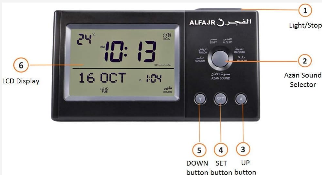
Figure 3: Front controls of the ALFAJR CT-11 Azan Clock. Key controls include Light/Stop (1), Azan Sound Selector (2), UP button (3), SET button (4), DOWN button (5), and LCD Display (6).

Upon first power-on or after a reset, the clock will prompt you to set the basic parameters.