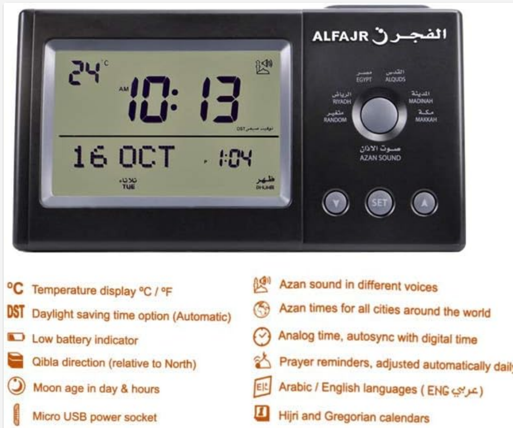
Figure 5: Display features of the ALFAJR CT-11 Azan Clock, including temperature, DST indicator, low battery indicator, Qibla direction, moon age, Micro USB power socket, Azan sound options, prayer reminders, language options, and calendar types.