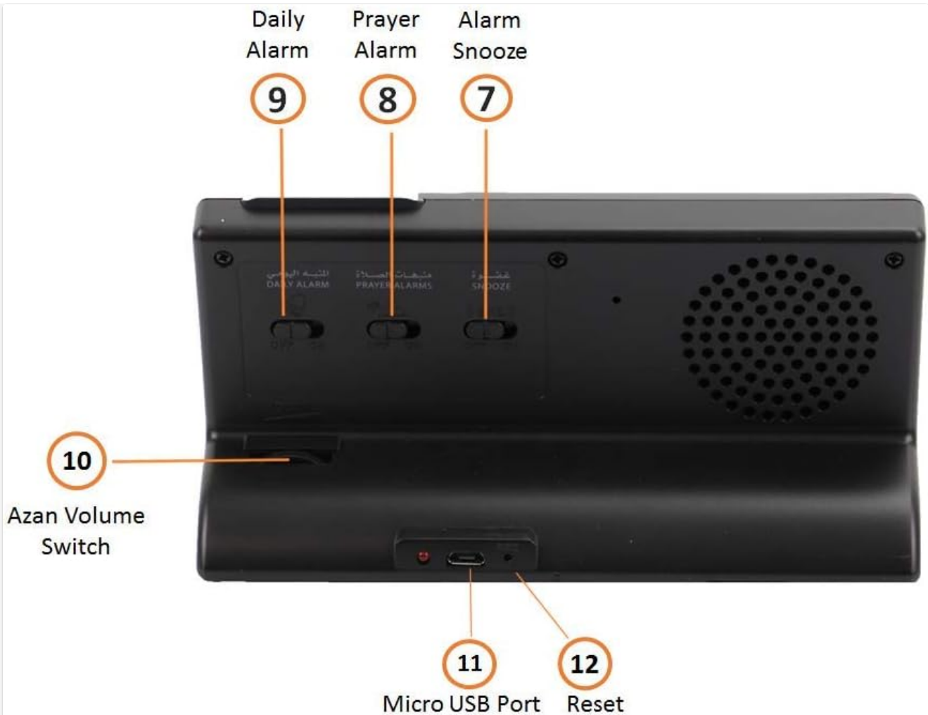
Figure 4: Back controls of the ALFAJR CT-11 Azan Clock. Key controls include Alarm Snooze (7), Prayer Alarm (8), Daily Alarm (9), Azan Volume Switch (10), Micro USB Port (11), and Reset (12).