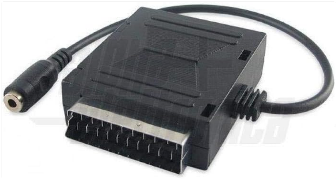
Image 1: The SCART to 3.5mm Stereo Jack Adapter. This image shows the black adapter with a SCART connector on one end and a 3.5mm jack cable on the other.