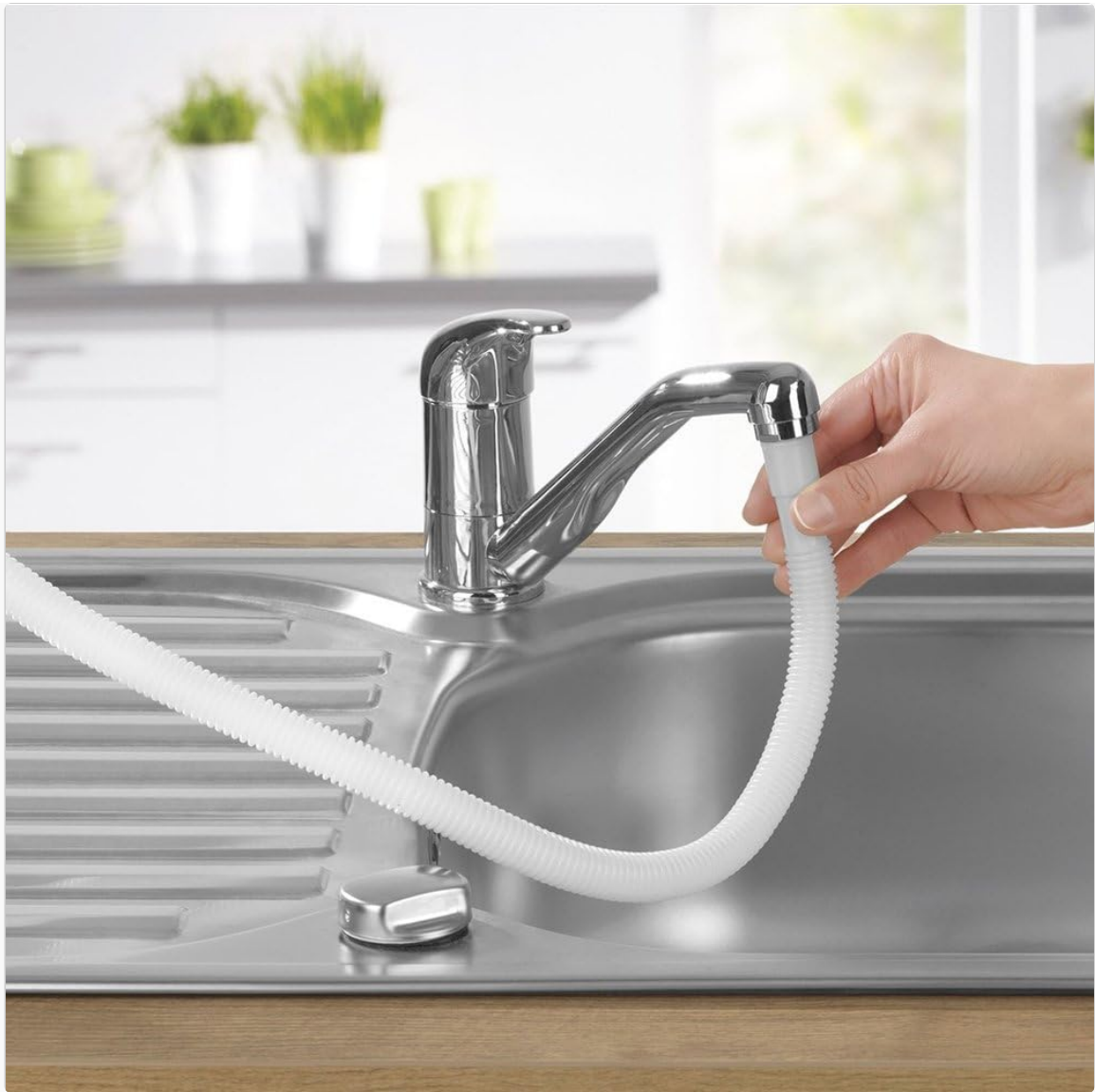
Figure 4.1: Illustration of the drain hose positioned in a sink. The flexible hose allows for convenient water disposal after the wash cycle.