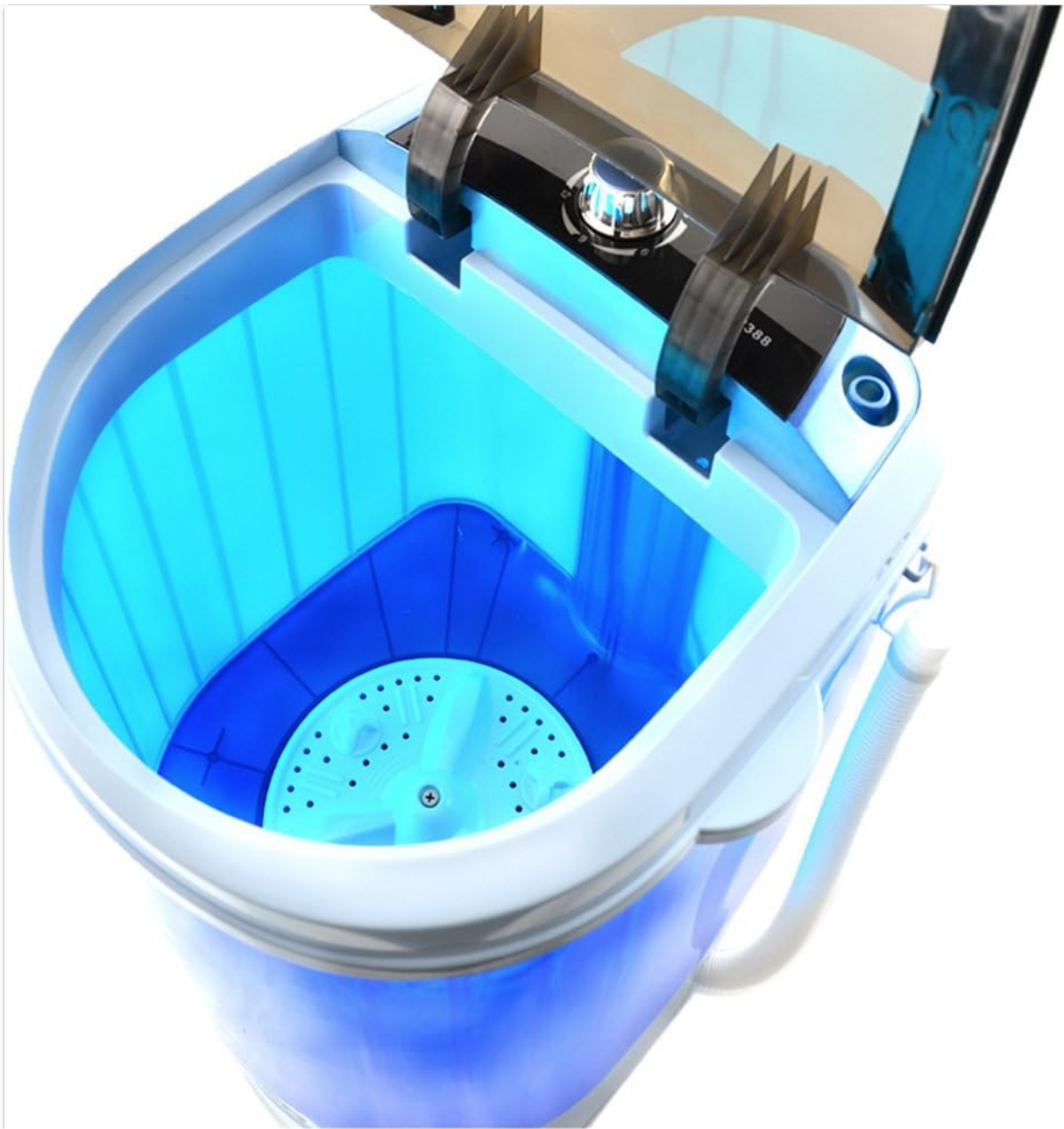
Figure 3.4: Interior view of the Aqua Laser Mini Washing Machine with the lid open. This image shows the washing pulsator at the bottom of the drum and the transparent blue walls.