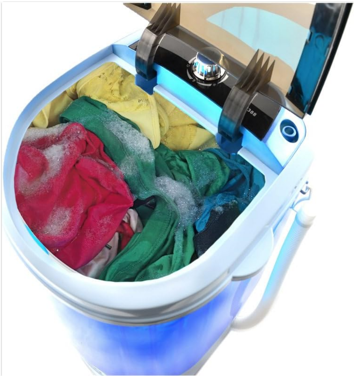
Figure 5.1: The washing machine with its lid open, showing various colored garments inside the drum, ready for washing.