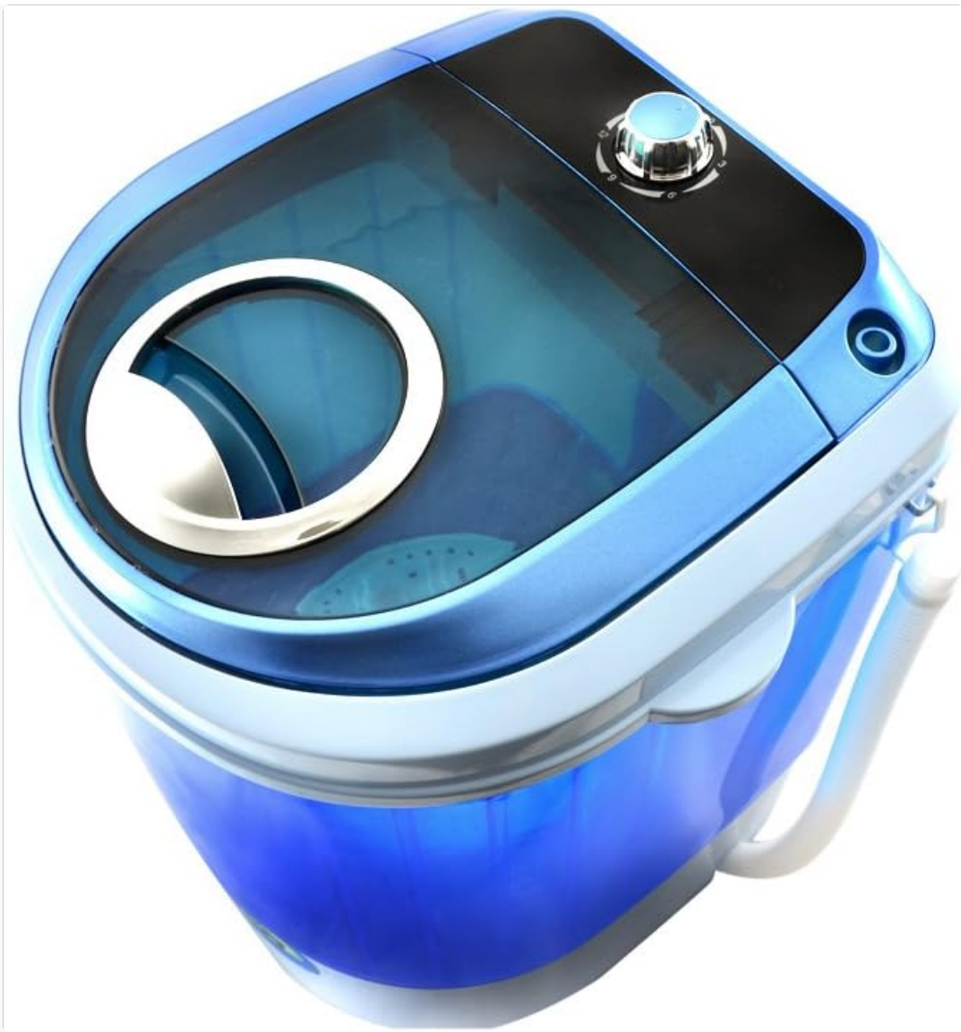
Figure 3.2: Top-down view of the Aqua Laser Mini Washing Machine. This perspective highlights the lid, the central control knob, and the overall shape of the appliance from above.