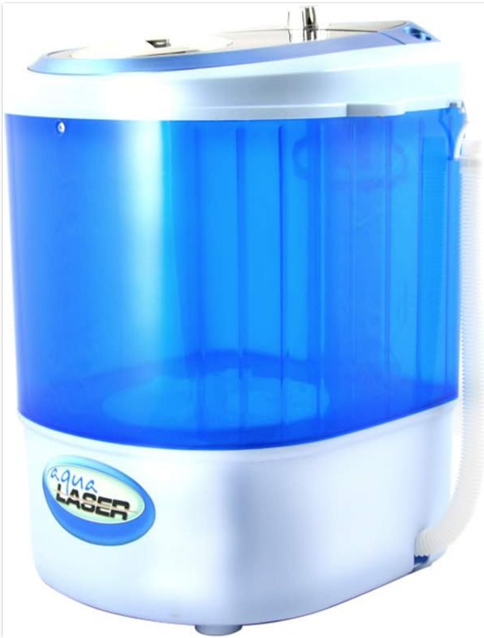
Figure 3.1: Front view of the Aqua Laser Mini Washing Machine. This image displays the compact design, the transparent blue washing drum, and the Aqua Laser logo on the front panel.