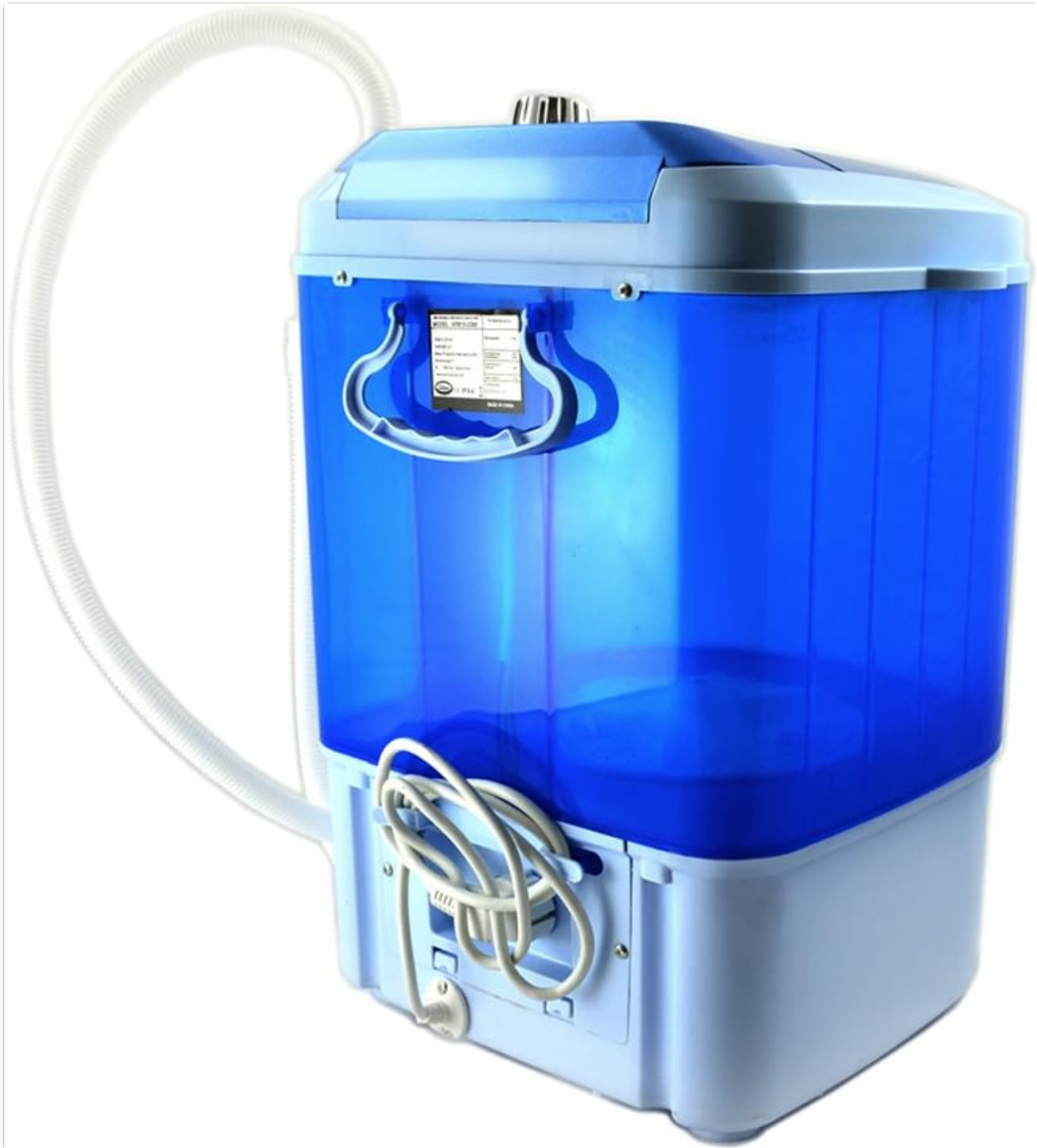
Figure 3.5: Rear view of the Aqua Laser Mini Washing Machine. This image displays the power cord neatly wrapped and the flexible drain hose attached to the side of the unit.