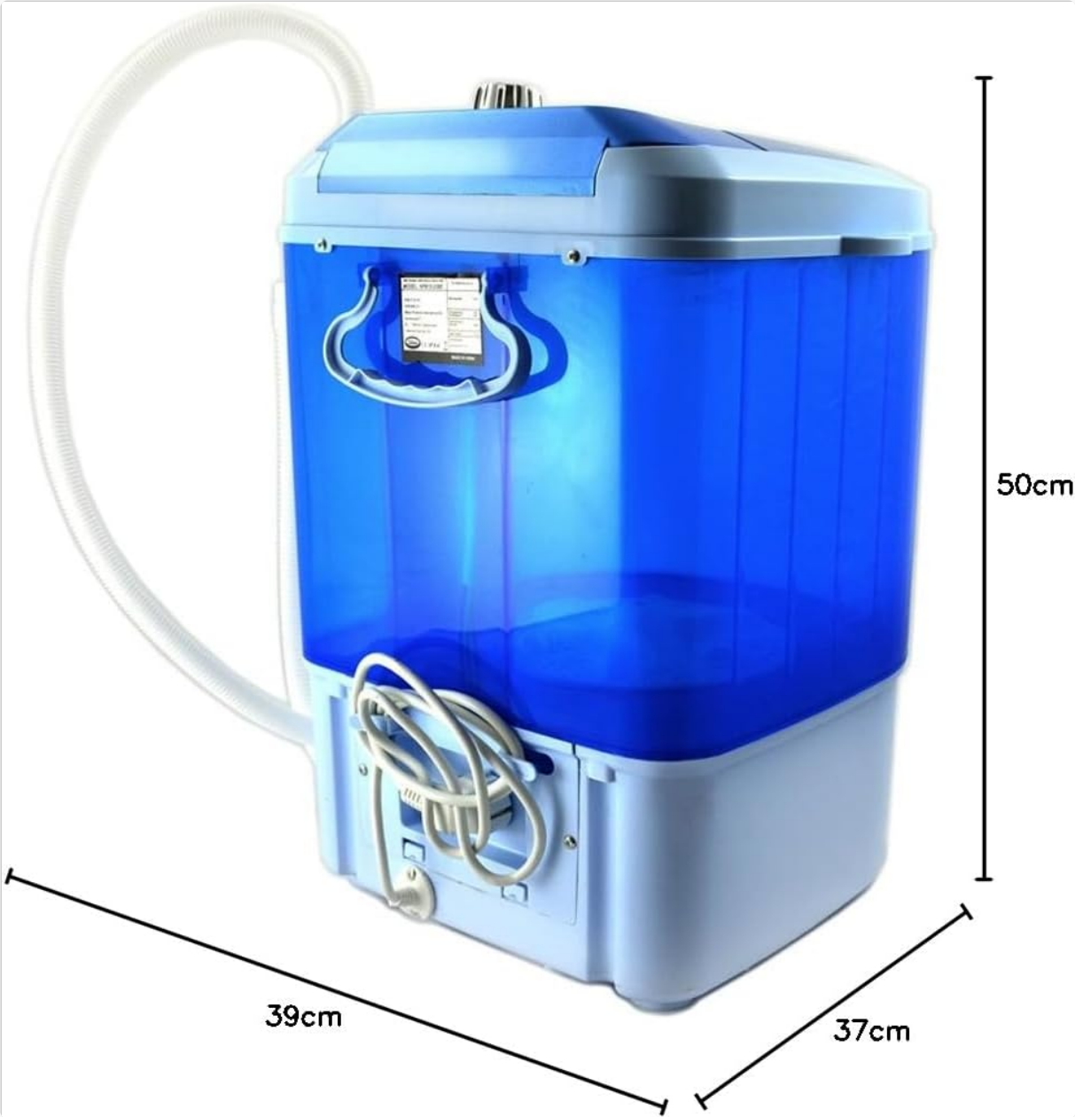
Figure 8.1: Diagram illustrating the dimensions of the Aqua Laser Mini Washing Machine, showing its height (50cm), width (39cm), and depth (37cm).