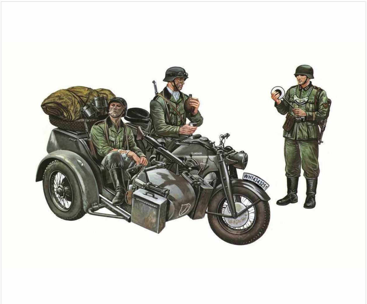
Figure 1: The Italeri Zündapp KS750 with Sidecar model kit box, showing the completed model and included figures.