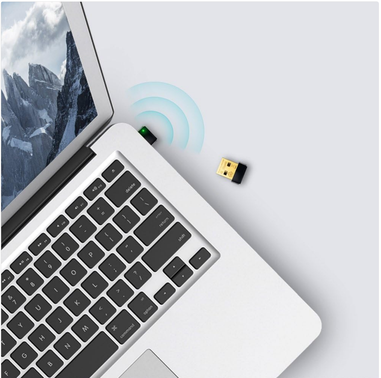
Image: The nano USB Wi-Fi adapter plugged into the side USB port of a laptop, with a green indicator light visible, signifying active connection.