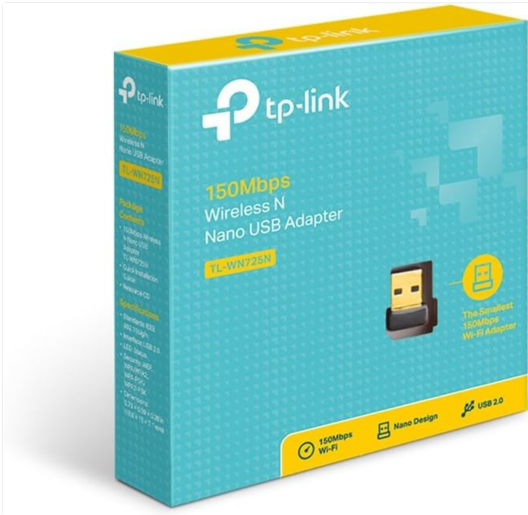
Image: The retail box for the TP-Link TL-WN725N adapter, showing the product name and key features.