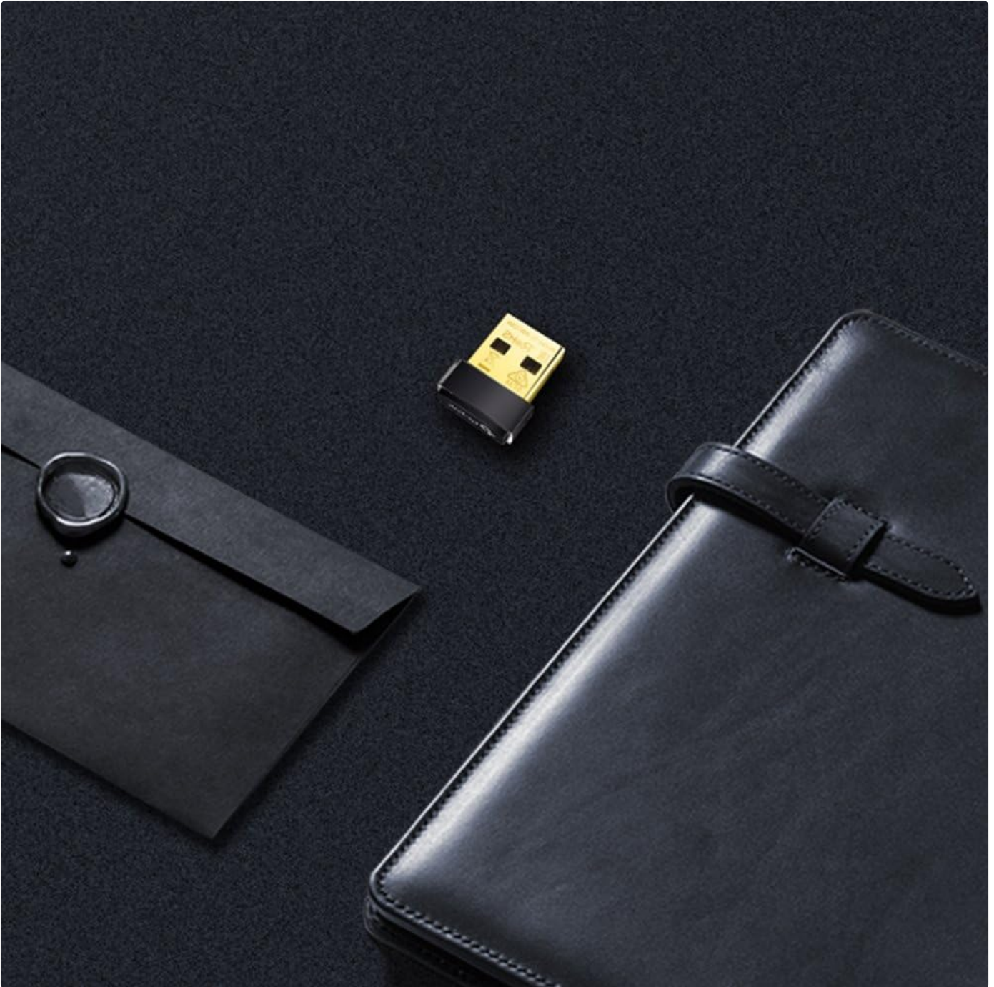
Image: The compact TP-Link TL-WN725N adapter placed on a dark surface next to a black notebook and an envelope, emphasizing its small and unobtrusive design.