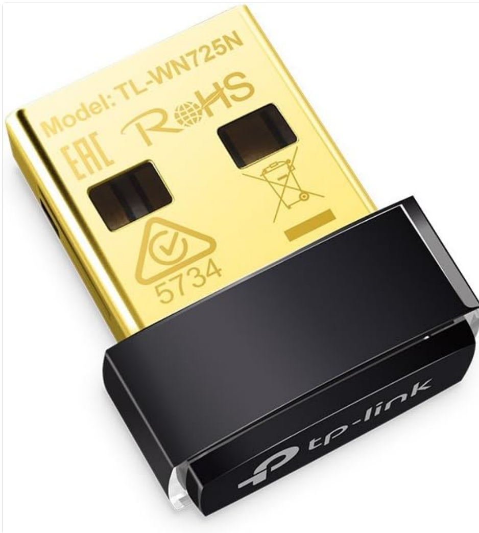
Image: An angled view of the TP-Link TL-WN725N Nano USB Adapter, showing its small black casing and the gold USB connector with the TP-Link logo visible on the side.