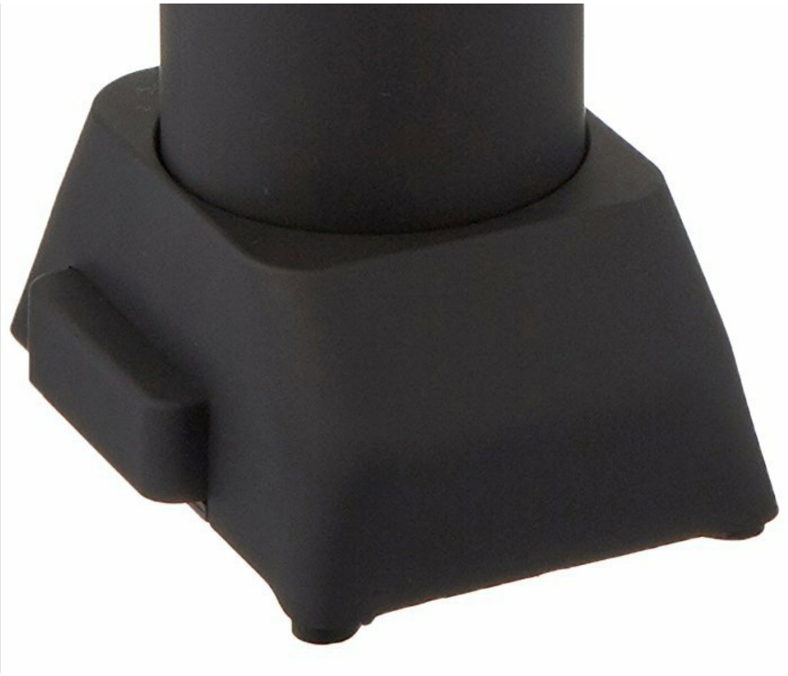
Image: The Brookstone Automatic Wireless Wine Opener. This image displays the main unit, a black cylindrical device with chrome accents, highlighting its compact design and the corkscrew mechanism at the base.