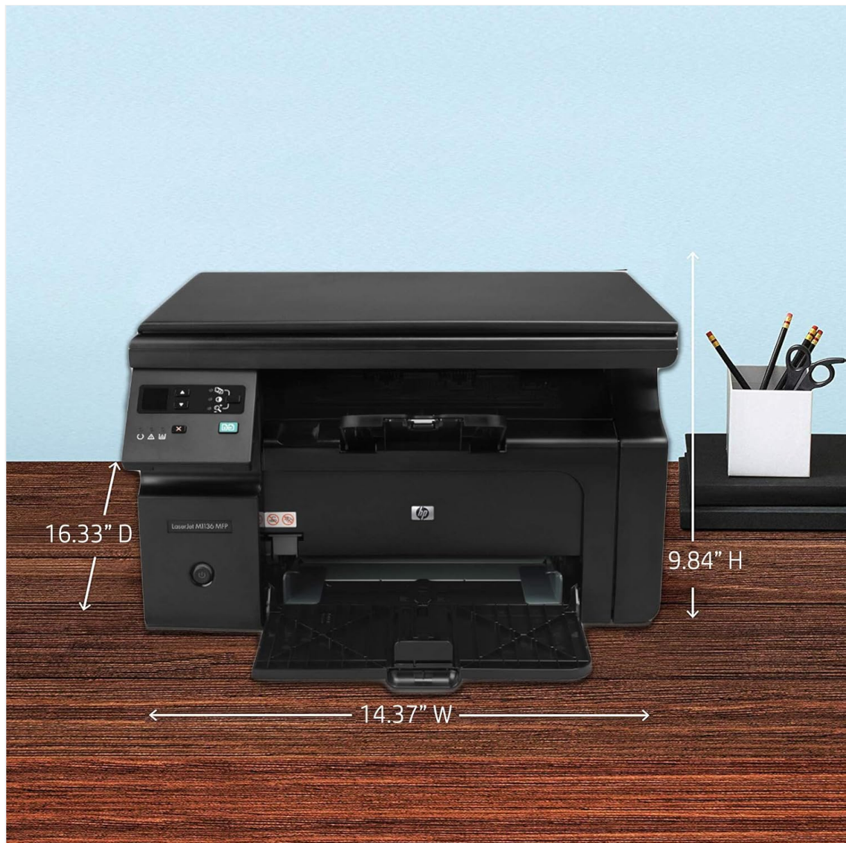
Figure 3: Product dimensions of the HP LaserJet Pro M1136 Multifunction Printer: 14.37" W x 16.33" D x 9.84" H.