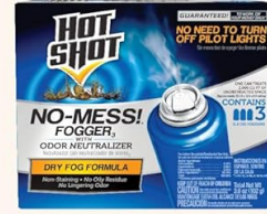
Hot Shot® No Mess! ® Fogger 3 With Odor Neutralizer