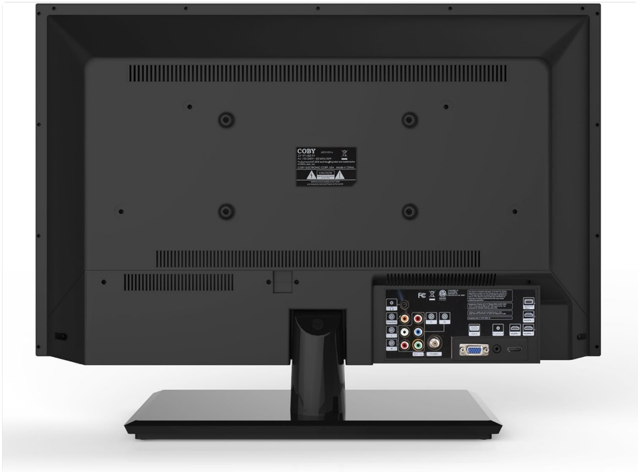
Figure 4.2: Rear view with input ports.

The Coby LEDTV3216 offers various input ports on the rear panel for connecting external devices.