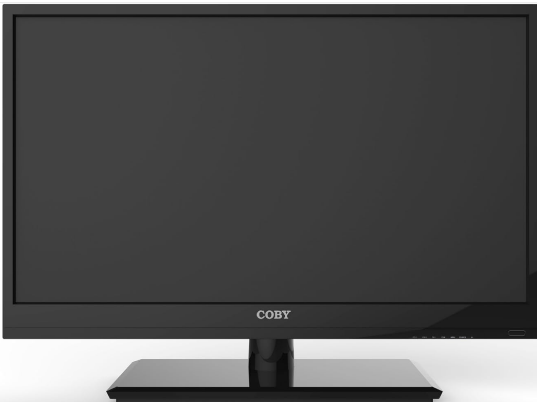
Figure 4.1: Front view of the Coby LEDTV3216 with stand.