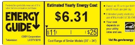
Figure 7.1: Estimated Yearly Energy Cost for LEDTV3216.