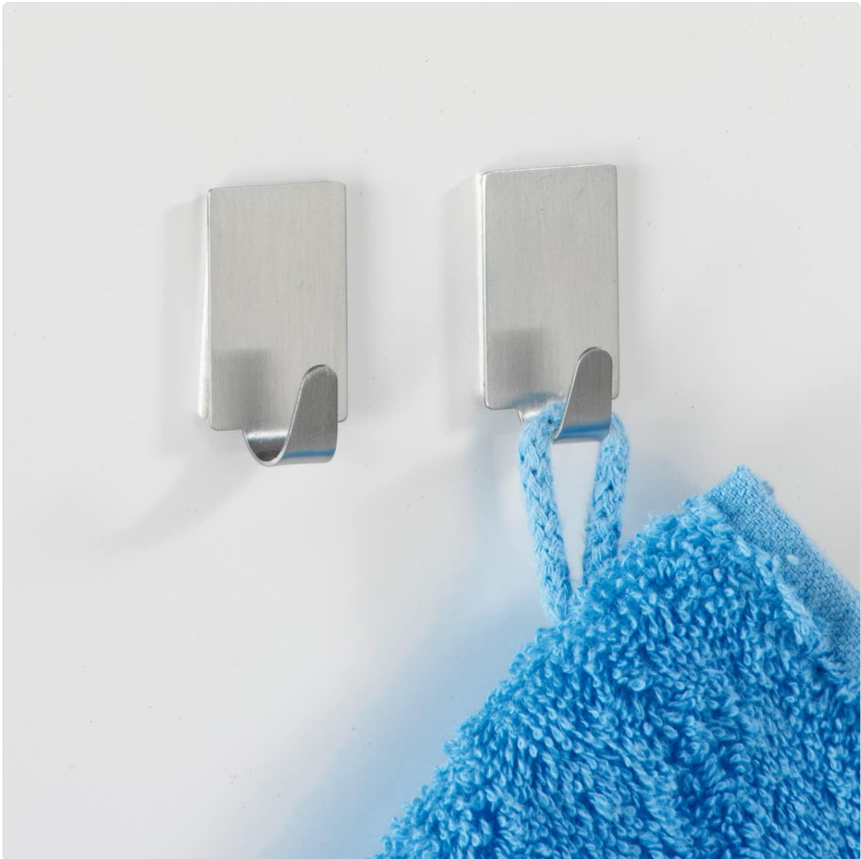
Image 1: Wenko Right Angle Hooks installed on a wall, demonstrating typical usage with a towel.