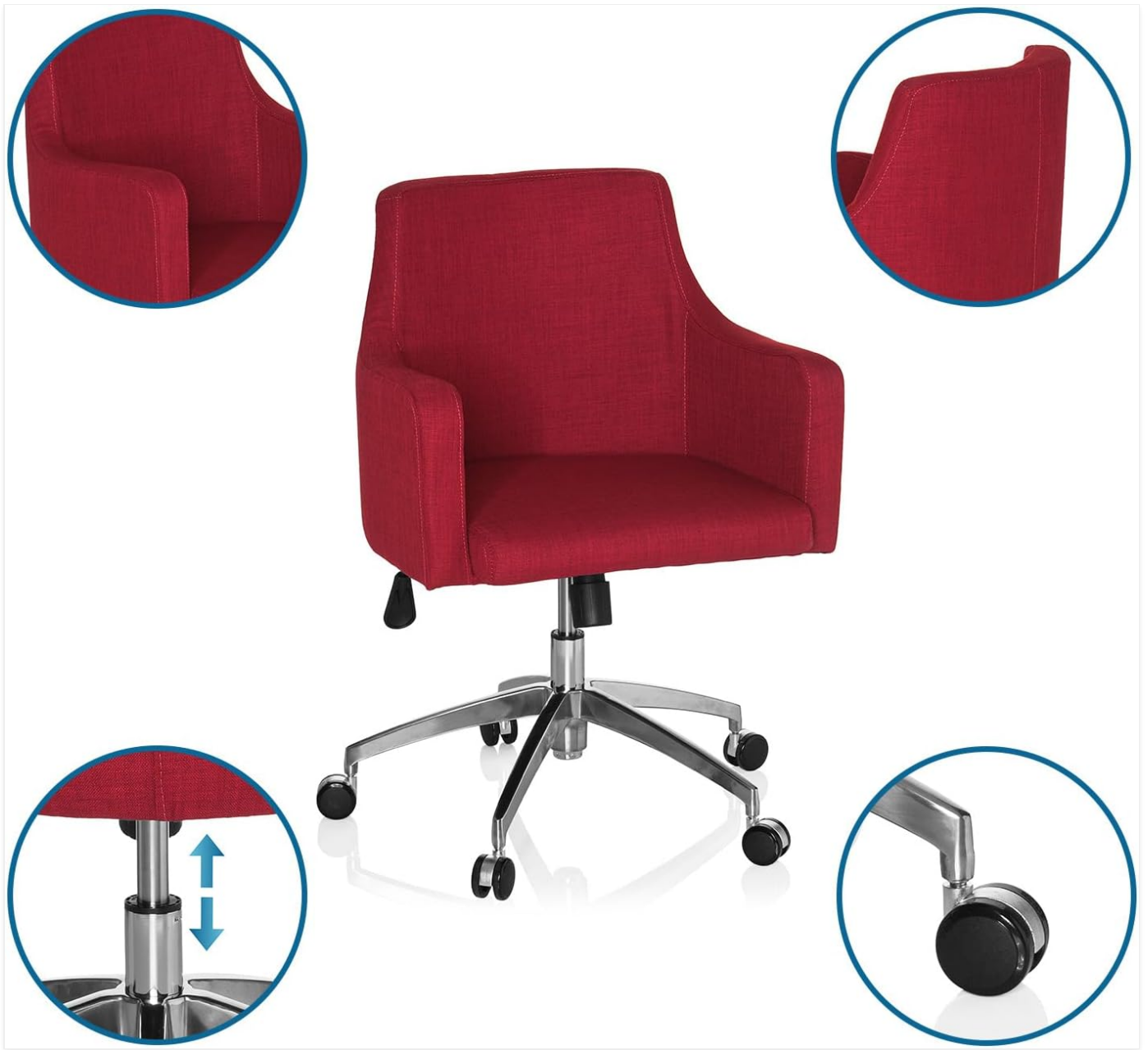
Figure 4: Detailed view of chair features, including the height adjustment lever.