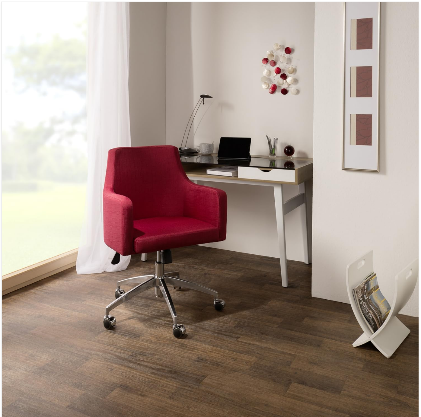
Figure 5: The hjh OFFICE 670560 Swivel Office Chair in an office environment.