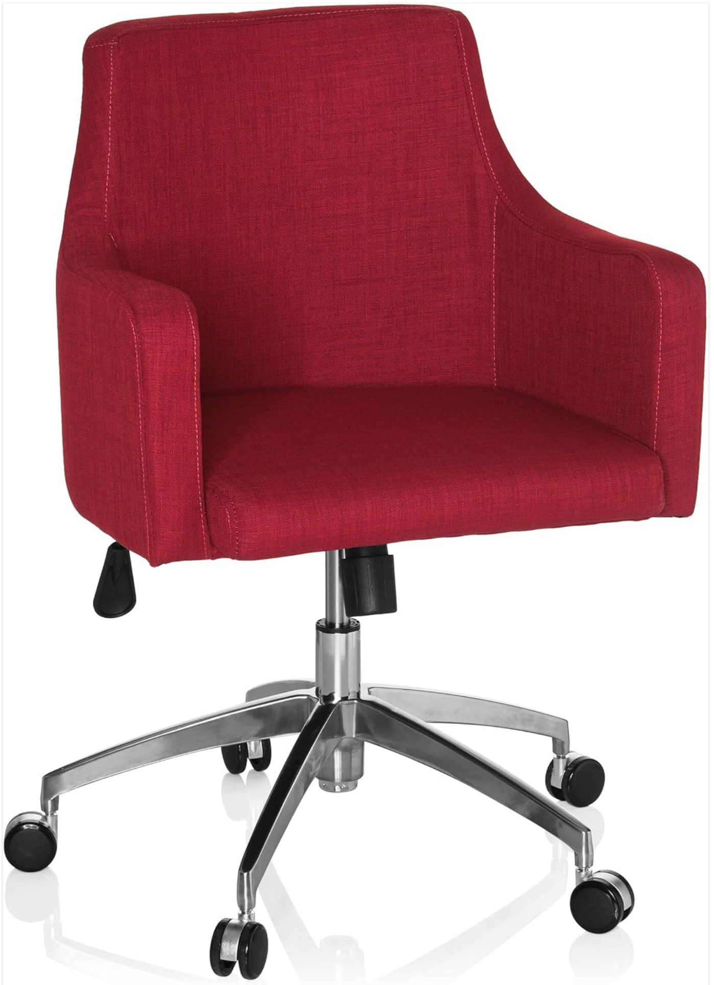
Figure 1: Main components of the hjh OFFICE 670560 Swivel Office Chair.